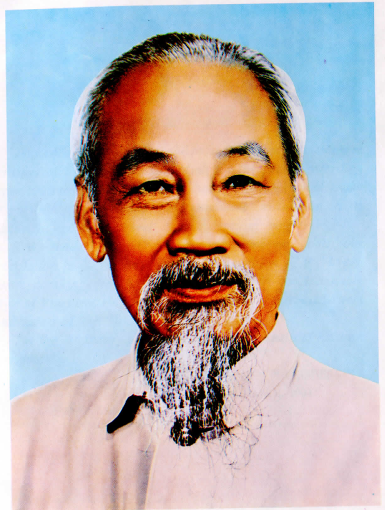
PRESIDENT HO CHI MINH (1890 - 1969)