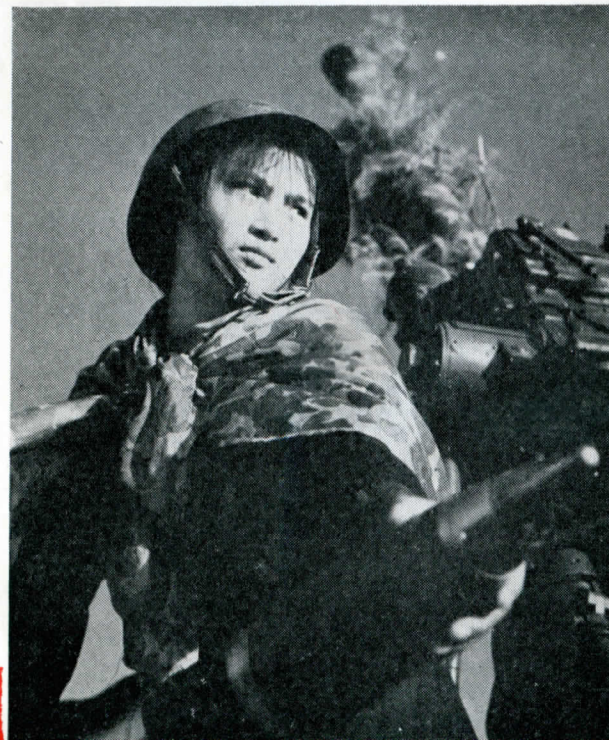
Militia women of Vinh Niem village, Haiphong port city.