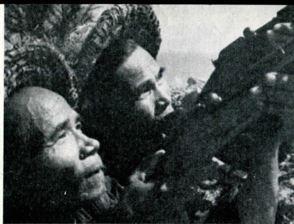
White-haired militiamen of village H. (Thanh Hoa province). They twice downed U.S. aircraft.