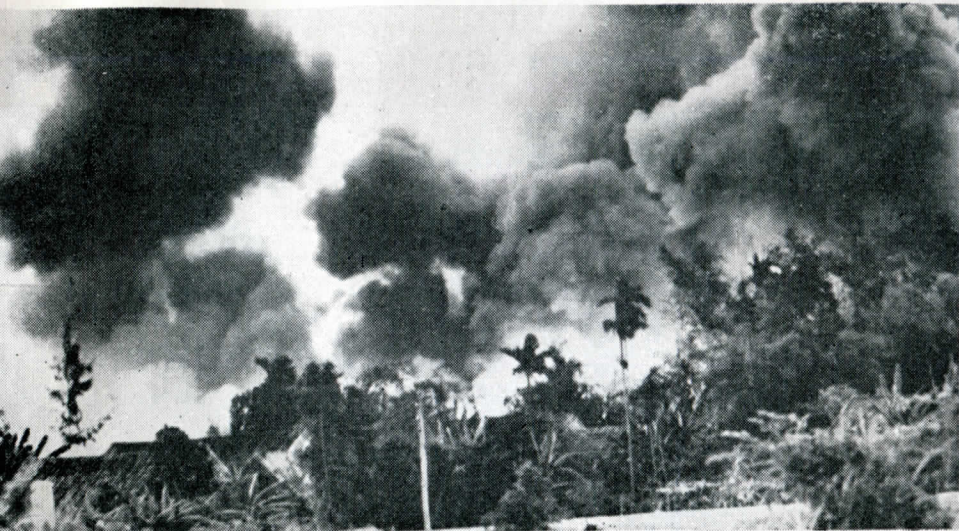
Dong Hoi, capital of Quang Binh province, was among the first towns attacked by U.S. planes.