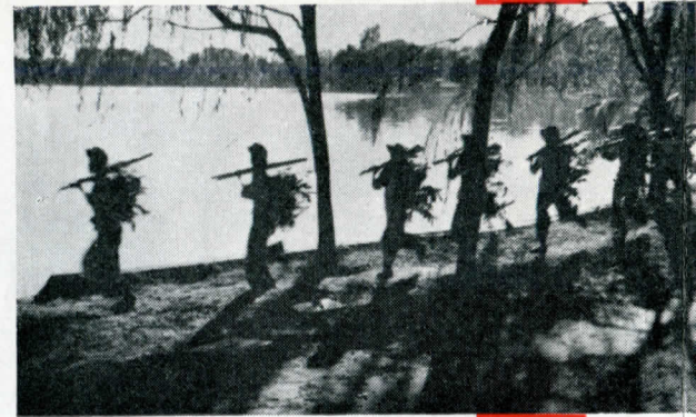
Hanoi youths train hard day and night, ready to fight.

FROM AUGUST 5, 1964 TO JANUARY 27, 1968 QUANG BINH BLASTED DOWN 386 ENEMY PLANES, SET AFIRE OR SUNK 31 U.S.-PUPPET WAR VESSELS OR COMMANDO-BOATS.