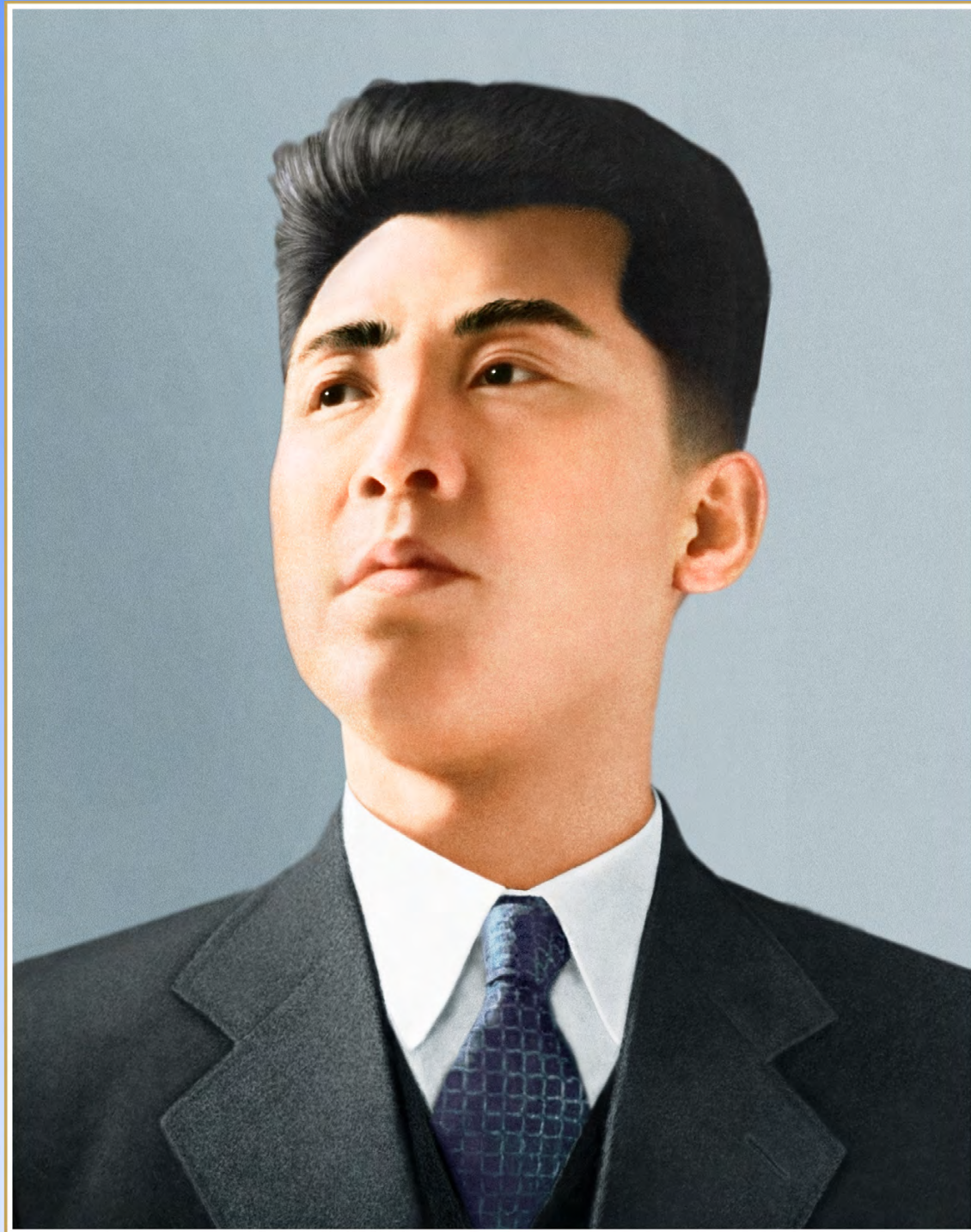
Great leader Comrade Kim Il Sung in the days of building a new country