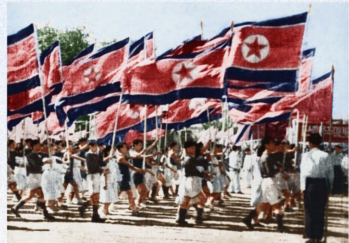
The founding of the DPRK brought great pride and delight to the masses of the working people who became the masters of power.