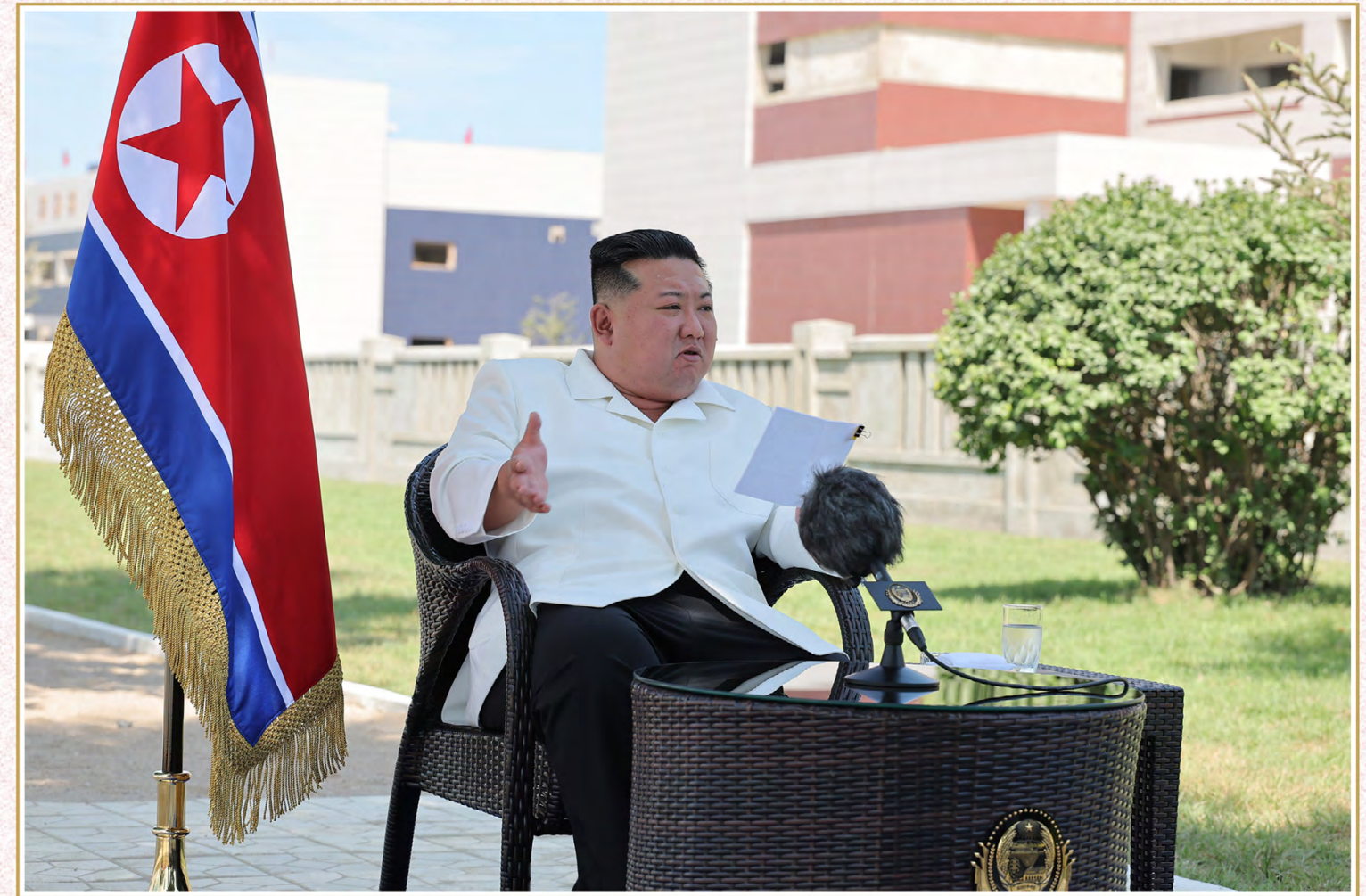
Saying that the WPK has entrusted the huge and sacred historic process of bringing about regional changes by dint of self-reliance to the KPA, believing in its loyalty and fighting efficiency, Kim Jong Un clarified the tasks for giving full play to its might in the honourable gigantic construction campaign.

All the servicepersons who are performing brilliant feats in the vanguard of struggle for implementing the intermediate- and long-term tasks set forth by the Party are the most precious revolutionary soldiers, he said, calling upon the leading officials of the Party and the government and commanding officers of the military to make every possible effort to provide soldier-builders with better working conditions and hygienic and cultured living conditions.