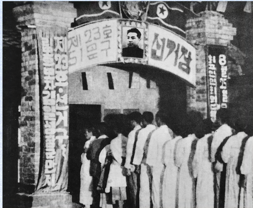
A polling station for the election of deputies to the Supreme People's Assembly in August Juche 37 (1948)