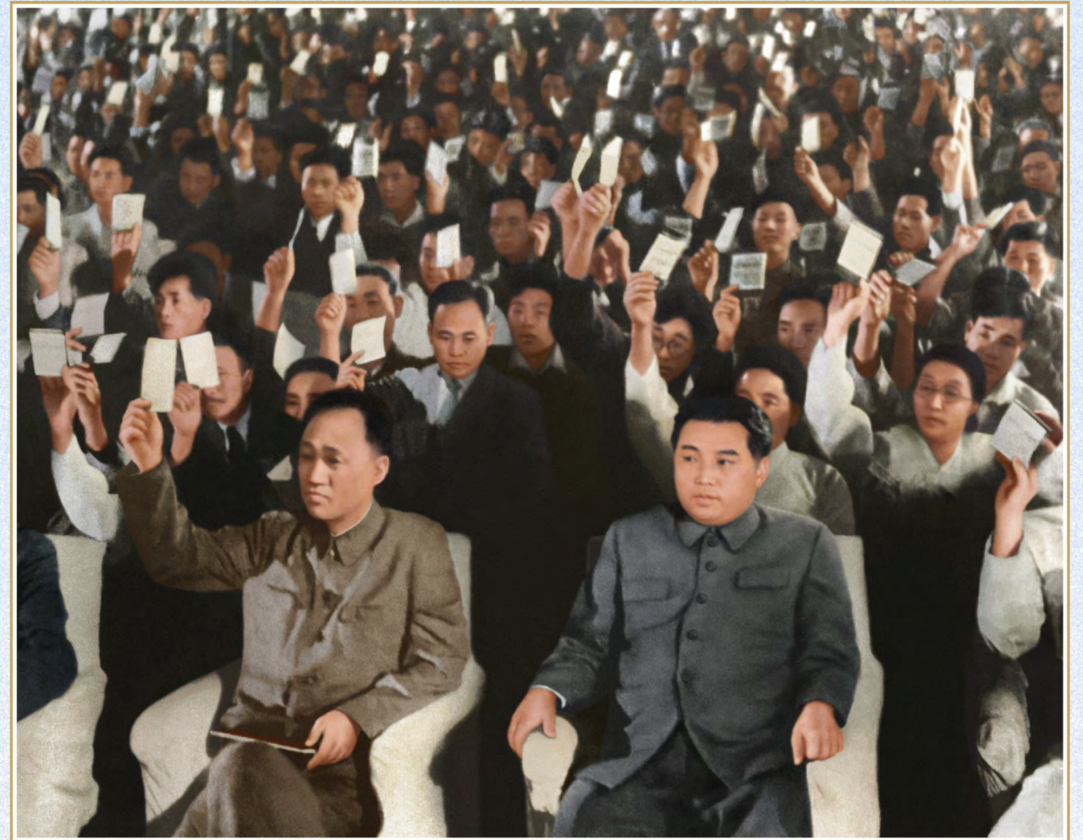
Kim Il Sung being elected Premier of the Cabinet of the DPRK at the first session of the Supreme People's Assembly in September Juche 37 (1948)

(1905-1945) and embarked on the road of building a new country.