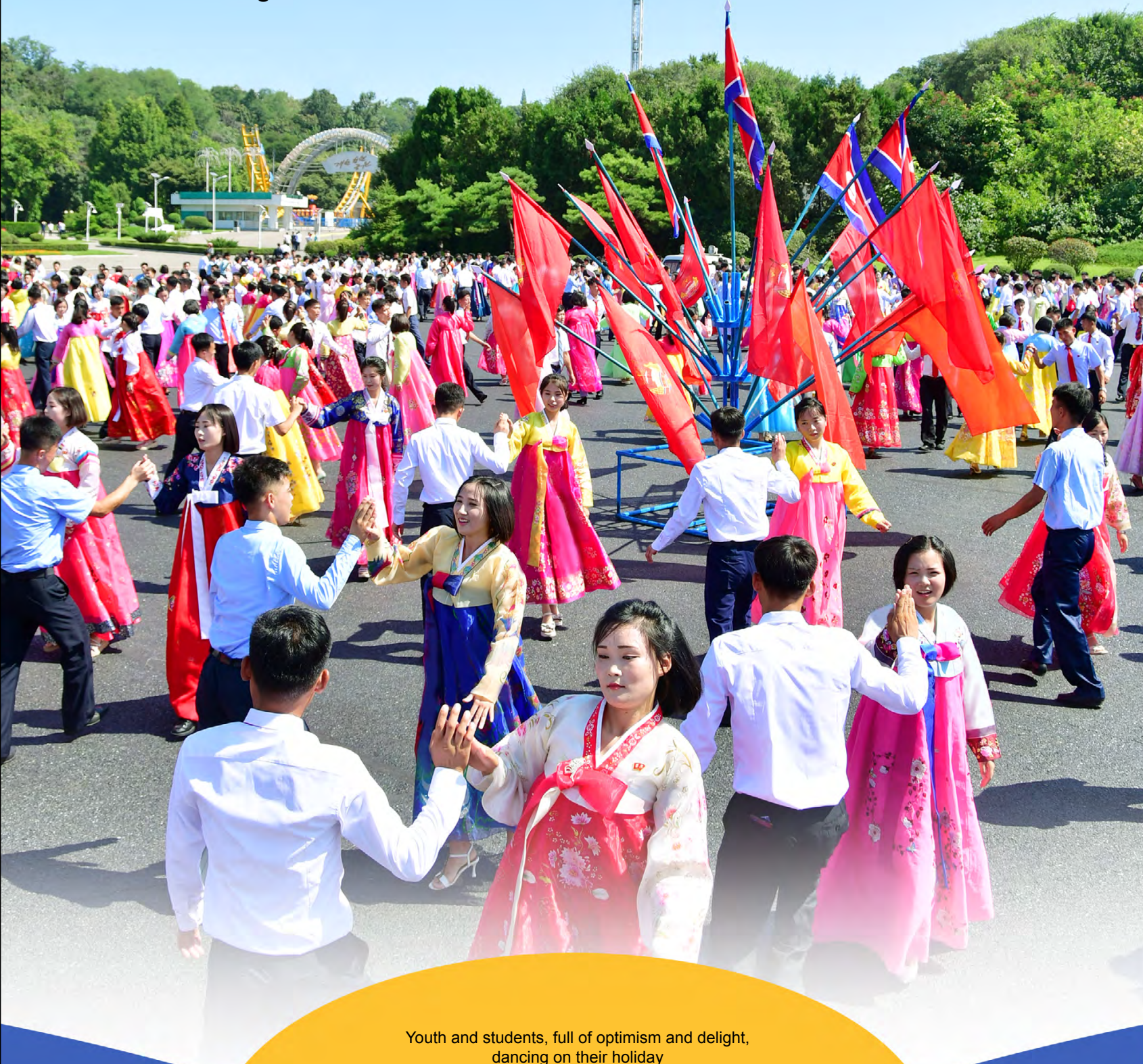
Youth and students, full of optimism and delight, dancing on their holiday

Young people in the capital city of Pyongyang and other parts across the country celebrated their holiday with artistic performances, dancing parties and sports and amusement games.