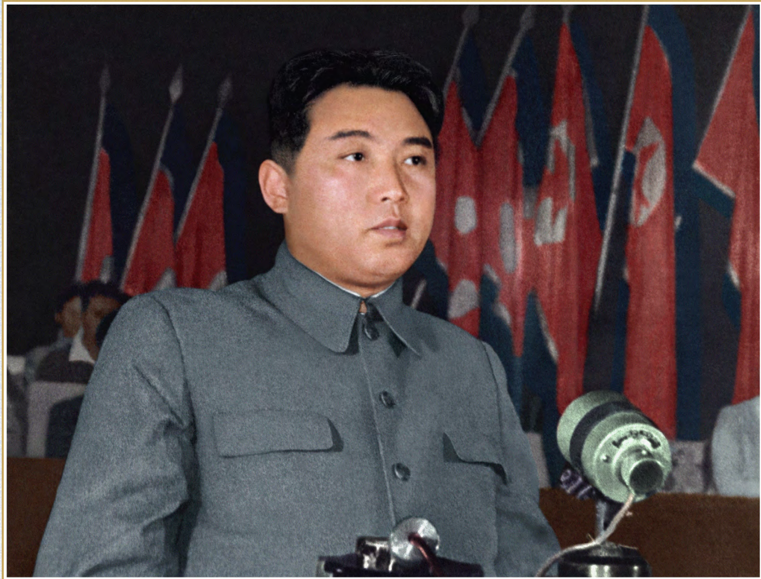
Kim Il Sung making public the political programme of the government of the DPRK at the first session of the SPA in September Juche 37 (1948)

bring our people genuine freedom and happiness and achieve full independence and sovereignty for the country by closely uniting wide sections of patriotic and democratic forces.