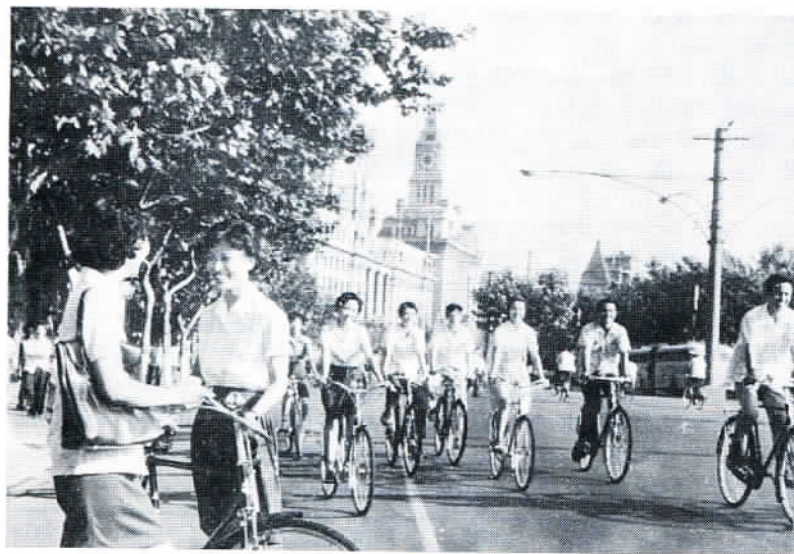
Riding "Yongjiu" brand bicycles.

* These include the variety, output and quality of products, labour productivity, production costs, material consumption, turnover rate of circulating capital and the profit to be handed over to the state.