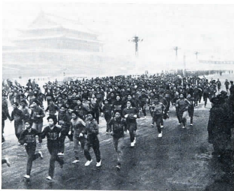
Start of women's round-the-city race in Beijing's Tian An Men Square.

Kenji Sato of the Japanese International Business Machine Corporation, who was invited to take part, captured the men's 13,000-metre race in 42 minutes 15.3 seconds.