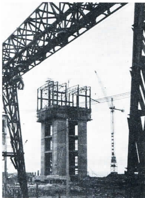
A headframe under construction in the Huainan Coal Mine.

An unprecedented flourishing of the arts has been occurring in China during the last three years. A number of talented young writers have dared to probe into the complexities of modern day life. In the 300 plays produced during this unique period, new heroes and heroines have been created, reflecting the spirit of the times. But recently two topics with mass appeal have emerged — juvenile delinquency and criticism of certain leading cadres for enjoying special privileges and for their bureaucratic tendencies. How to handle these subjects was the theme of a meeting held in Beijing for