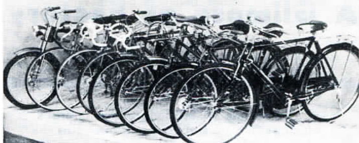
Left: A bicycle produced before liberation. Right: Bicycles produced after liberation.

according to his work" and more pay for more work, the workers, apart from their monthly wages, can also get bonuses, generally about five yuan a month.