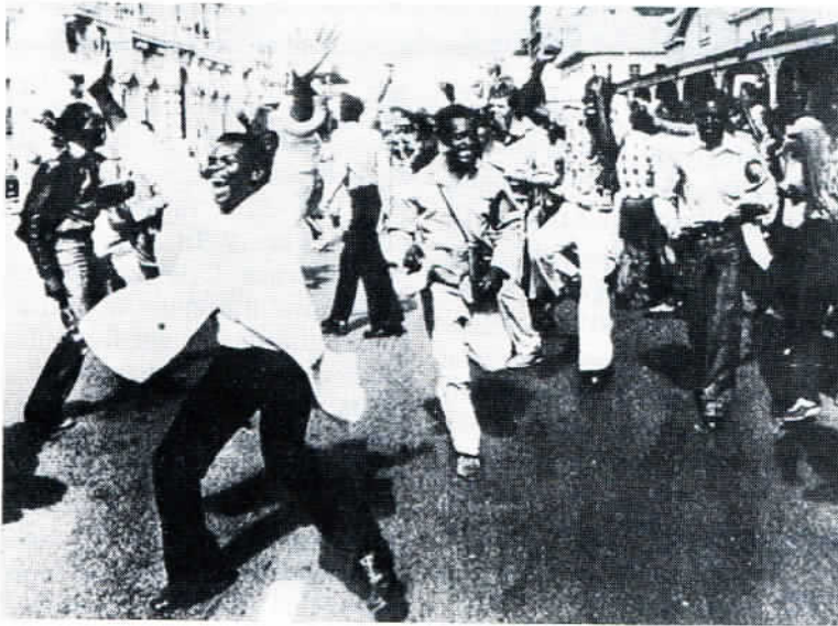
Zimbabweans greet news of election victory.

southern Africa in particular. No matter what twists and turns may crop up on their road forward, the Zimbabwean people are expected to strengthen their unity further and