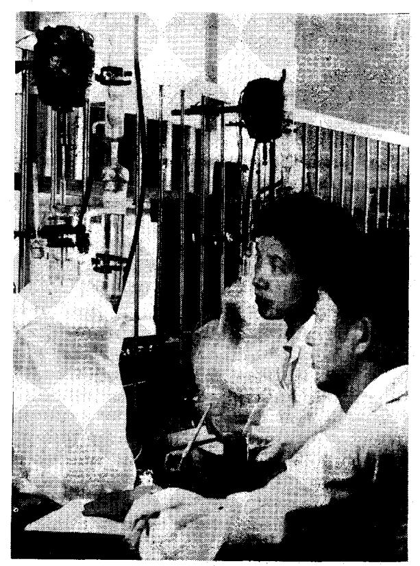
Young members of a Gansu industrial research institute conducting experiments.

a senior middle school in Zhangjiakou city, Hebei Province.