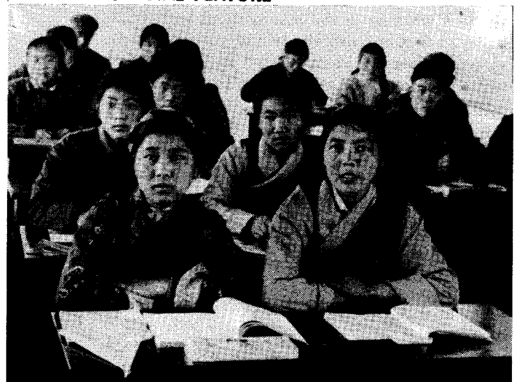
Minority students of the Tibet College of Agriculture and Animal Husbandry.