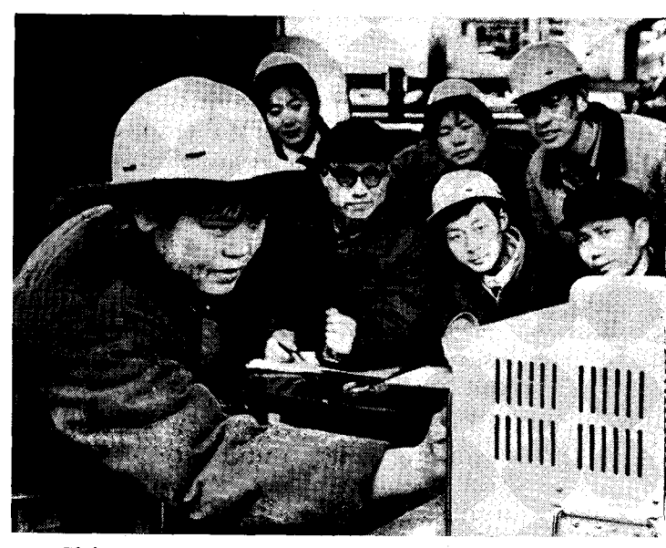
Giving a young worker an exam at a Hubei chemical fertilizer plant.

No longer depressed, she is more confident and mature than ever. She is fully aware of the heavy responsibility of the younger generation — to inherit the art of Beijing opera from the older generation and to raise it to a higher plane. She said: "We should make up the loss brought about by the 'gang of four,' and learn earnestly from the older generation. The traditional operas should be improved and modern operas should be developed. I will work hard for the prosperity of Beijing opera."