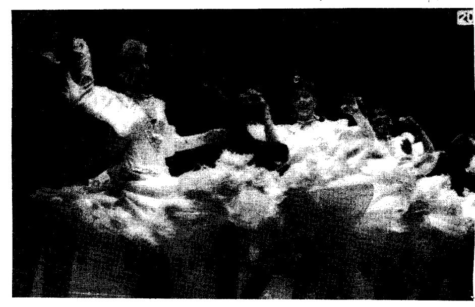
Group dancing presented by the Braunschweig Sports Dancing Troupe of the Federal Republic of Germany in May last year.

leads to China's progress in both the material and cultural spheres. The world wants to understand China and vise versa. An analysis of China's 2,000-year history of cultural exchanges with foreign countries shows that Chinese culture has flourished by enriching its fine cultural heritage with the achievements of foreign cultures and in this way made its new