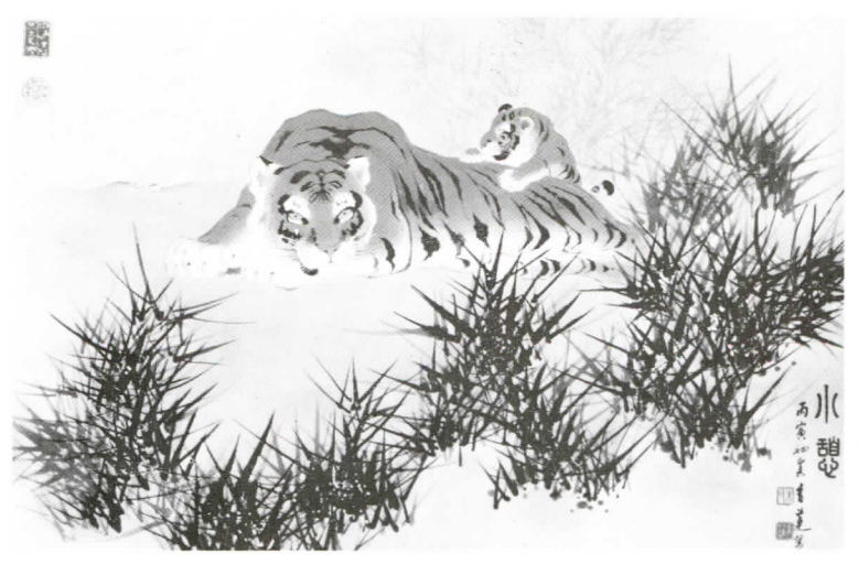
A Tiger With Its Cub.