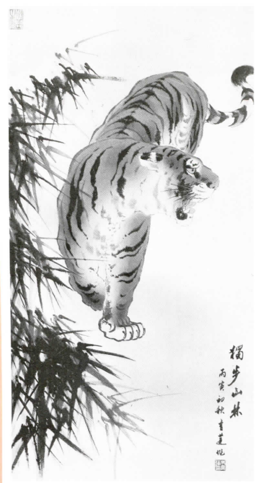
The Roar of a Tiger.