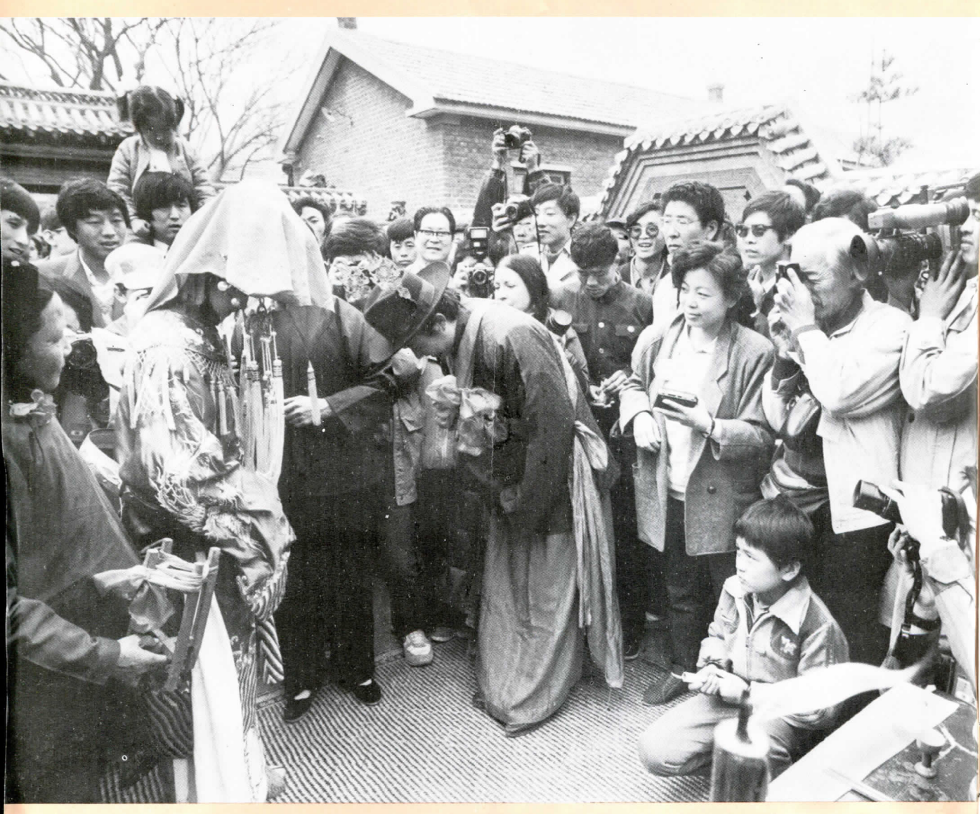
Tourists from China and abroad congratulate the bride and groom at a traditional Chinese wedding ceremony.