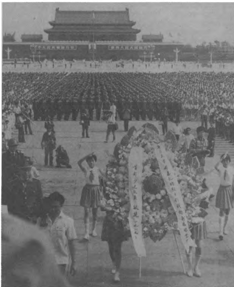
On June 17, 10,000 young pioneers of Beijing held a gathering with the theme "Love the Communist Party of China and love our socialist motherland" at the Tiananmen Square recently swept clean. Some officers and men of the martial law enforcement troops attended.