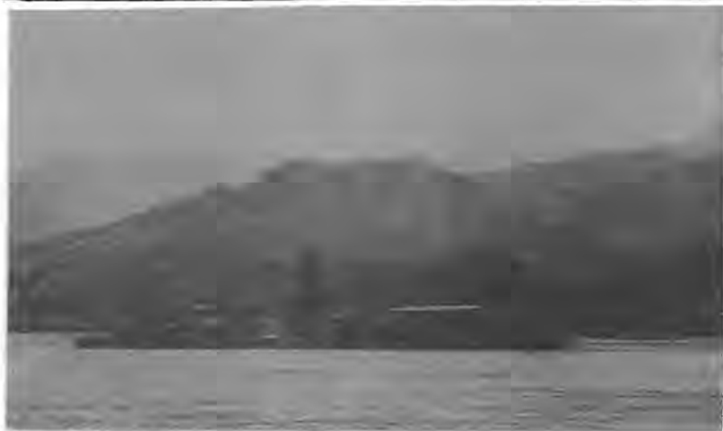
Drilling in the river.