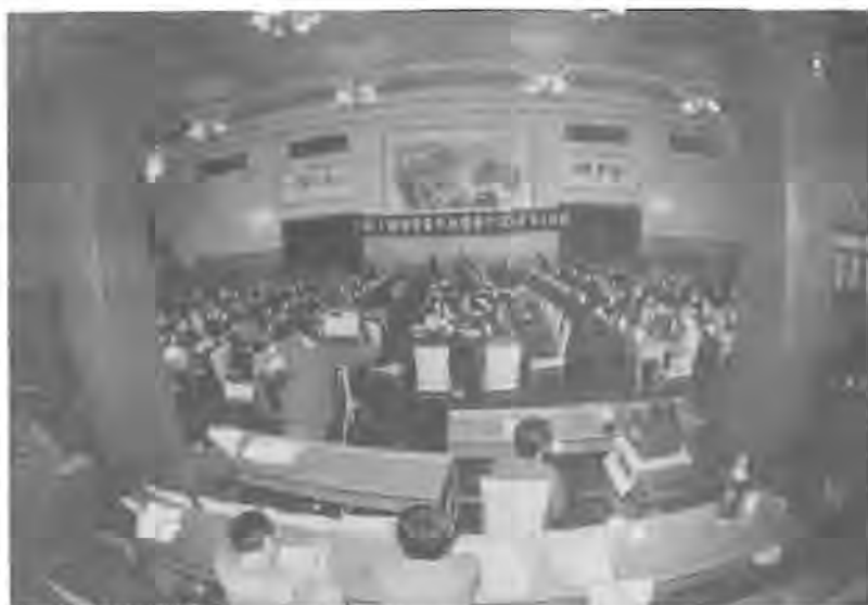
At the 10th enlarged leading group meeting on the feasibility study for the Three Gorges project. XU CHANGJUN

project may result in floods on the upper reaches of the river caused by silt. In addition, other problems may arise such as earthquakes induced by the reservoir, and damage to the ecological environment. In short, the project seems to present the people with more disadvantages than advantages. Therefore they suggested that tributaries of the Changjiang should be developed first, then its mainstream, in light of the river's concrete conditions. They hoped the central government would not make a final decision before the completion of further feasibility studies.