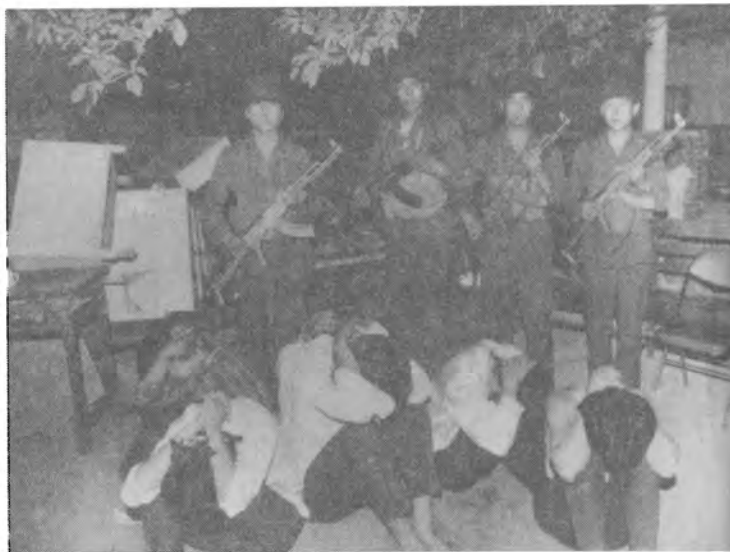
Some of the rioters were caught red-handed.