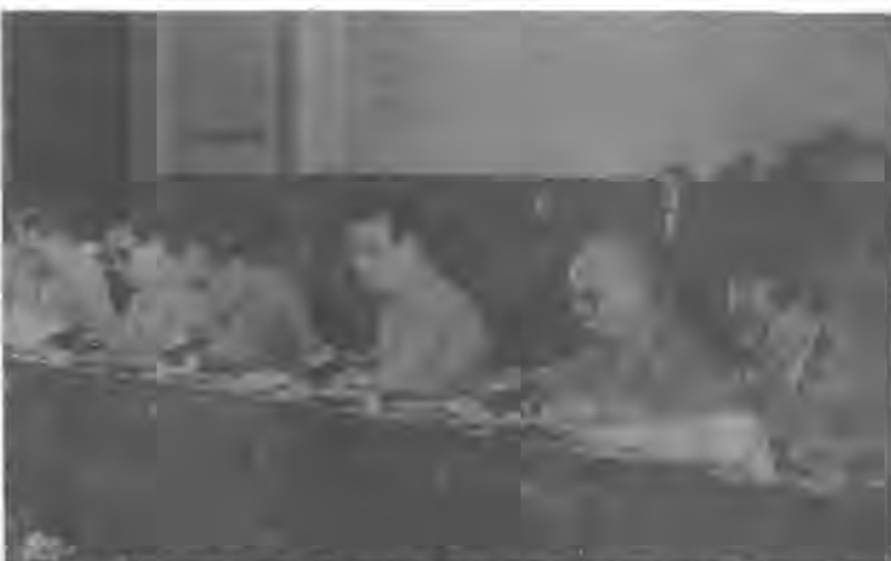
On the rostrum. From left: Song Ping, Qiao Shi, Jiang Zemin, Li Peng, Yao Yilin, Li Ruihuan.

pendence and self-reliance, plain living and hard work, and oppose bourgeois liberalization in real earnest; the fourth is to greatly enhance the building of the Party, democracy and legal system, resolutely penalize corruption, and accomplish a few things of popular concern so as to live up to the people's expectations of the Party.