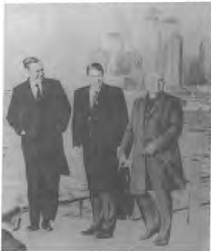
Mikhail Gorbachev (right), Ronald Reagan (centre) and George Bush met on Governor's Island in New York Harbour on December 7, 1988.

4. Adopting different approaches towards East European countries and promoting their access to the US on a basis similar to that of Finland. The Bush government will supply Hungary and Poland with economic assistance but restrict its economic and other relations with the German Democratic Republic, Czechoslovakia, Romania and Bulgaria. However, the US government will try to prevent anarchy in Eastern Europe and any movements by countries there to separate from the Warsaw Pact so that the reforms in Eastern Europe will not be stopped halfway through suppression by the Soviet Union.