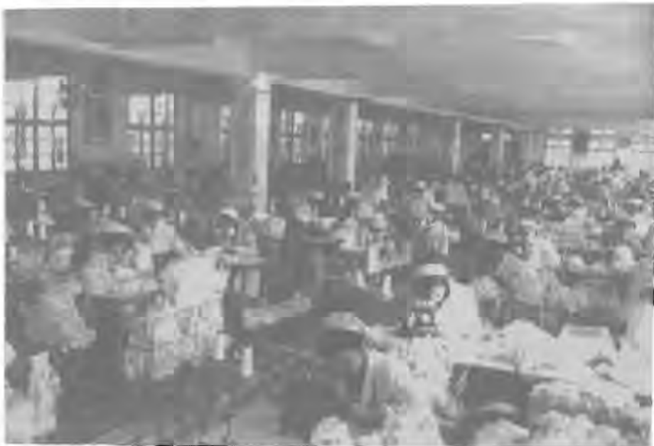
A workshop in the Quanzhou Glove Factory.