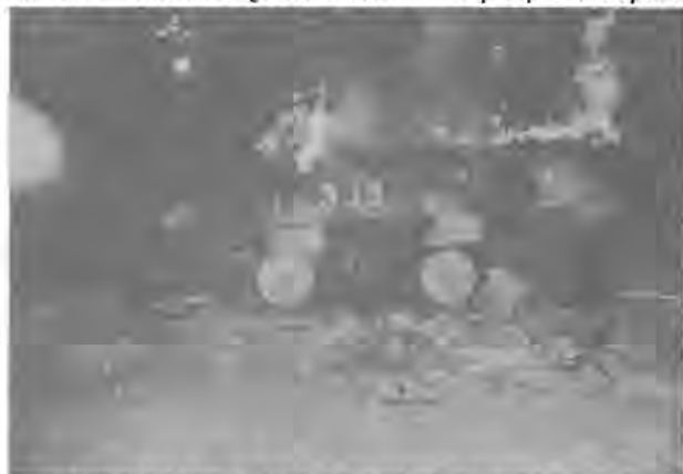
An armed vehicle burnt by rioters at Liubukou in Beijing on the evening of June 3.