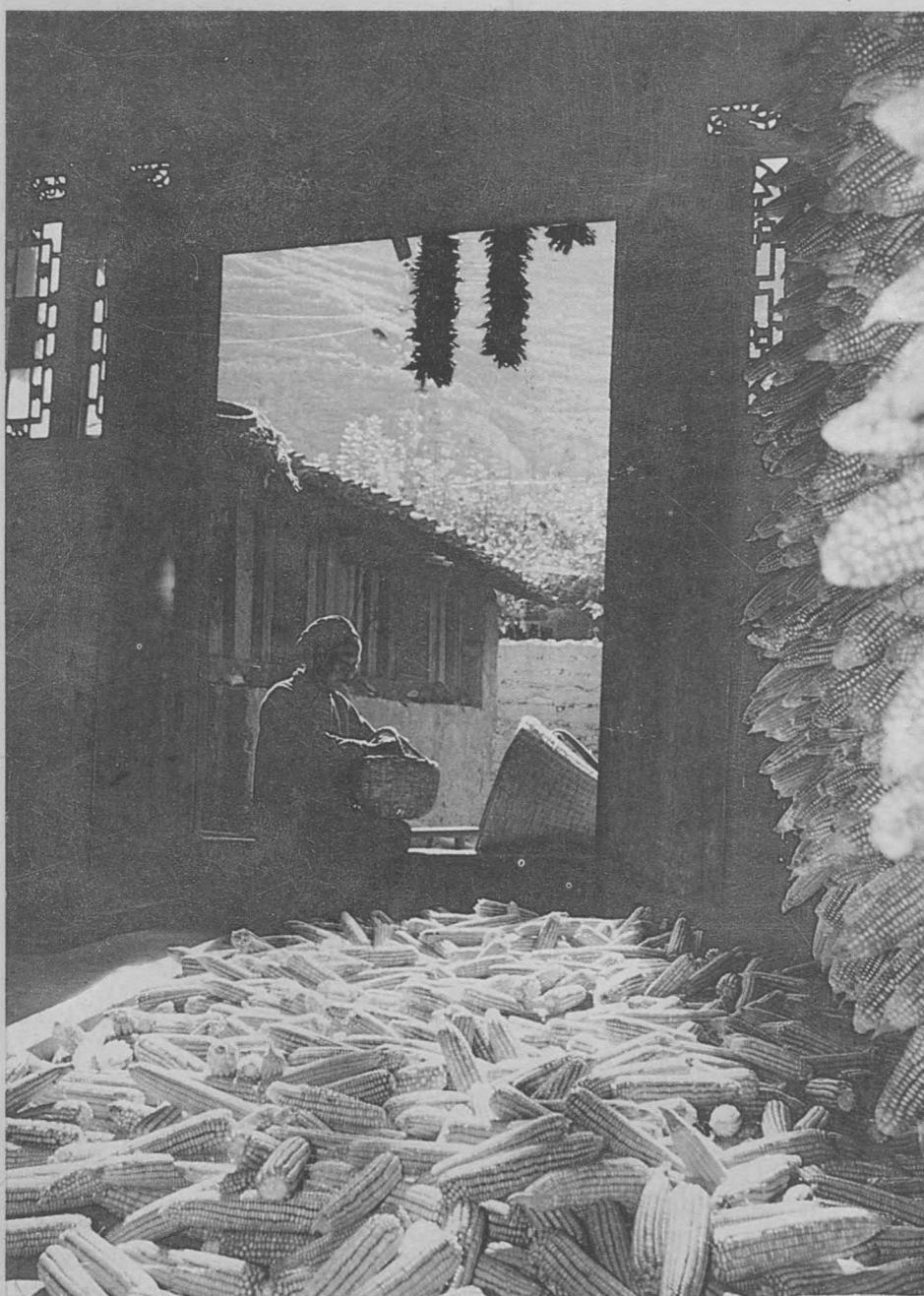
A farmer rejoices over his bumper harvest.