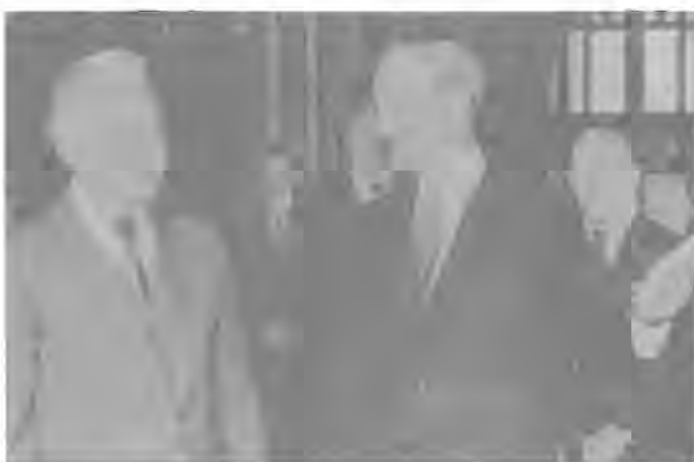
Soviet Foreign Minister Eduard Shevardnadze (left) held talks with US Secretary of State James Baker in Moscow on May 10, 1989.

The relationship between Washington and Moscow is tending towards relaxation and cannot