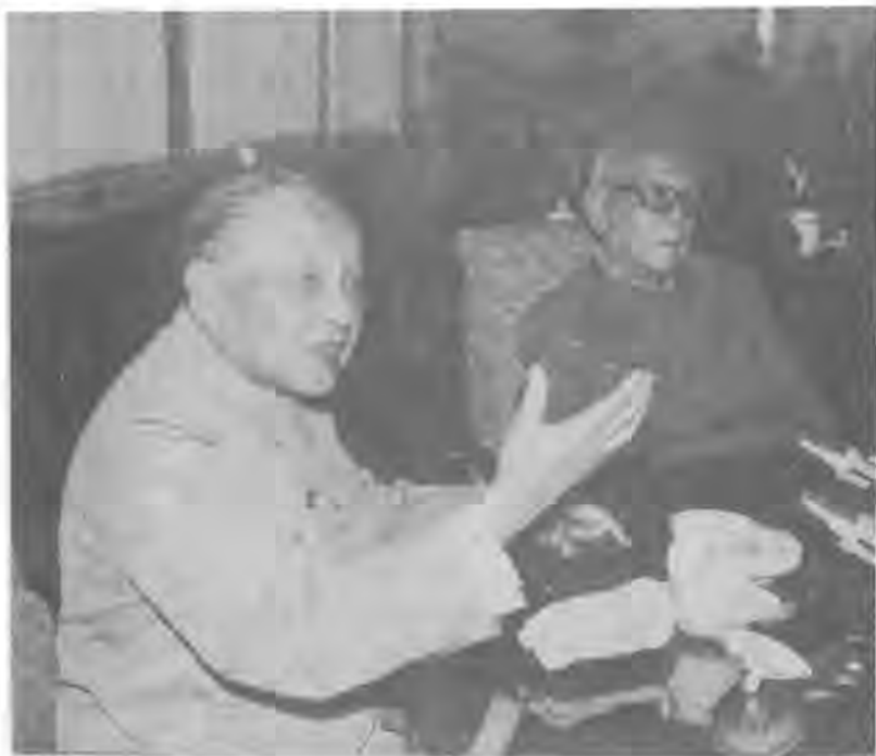
Deng Xiaoping meets the commanders of the PLA martial law enforcement troops.