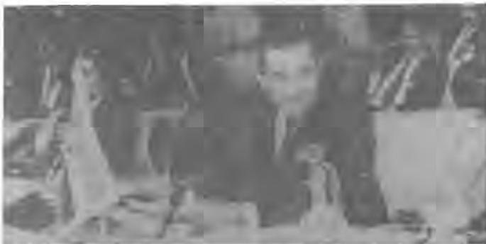
Egyptian President Hosni Mubarak at the opening ceremony of the summit on May 23.

The summit has decided to set up a supreme committee headed