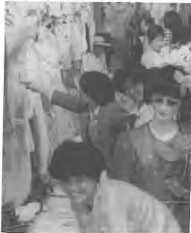
A market fair run by individually owned businesses in Changshu City, Jiangsu Province.

There used to be a sort of idea that socialist socio-economic relations should be as pure as pure can be. In fact, this is erroneous. As early as in 1918, while talking about the transition from capitalism to communism, Lenin pointed out, "But what does the word 'transition' mean? Does it not mean, as applied to an economy, that the present system contains elements, particles, fragments of both capitalism and socialism? Everyone will admit that it does" ("Left-Wing' Childishness and the Petty-Bourgeois Mentality," Collected Works of Lenin , Vol. 27). In 1921, Lenin again noted, "One way is to try to prohibit entirely, to put the lock on all development of private, non-state exchange, i.e., trade, i.e., capitalism, which is inevitable with millions of small producers. But such a policy would be foolish and suicidal for the party that tried to apply it. It would be foolish because it is economically