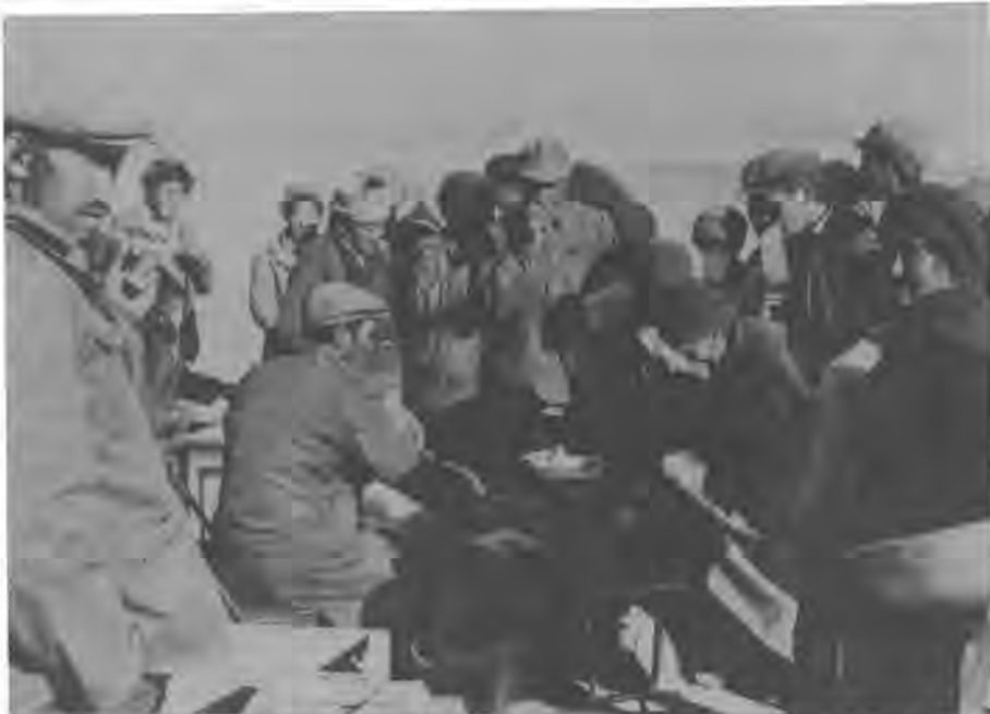
Xiangga villagers shopping for their Tibetan New Year celebrations at the mobile shop of the Caigongtang Township Supply and Marketing Co-operative.

"If I was the village leader," he added, "I would have first arranged new homes for the other villagers, leaving myself un-