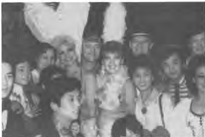
Members of China's Kunming Acrobatic Troupe and the Moscow Variety Show Troupe meet in Lima, Peru.

In recent years, Sino-Soviet economic relations have made considerable progress, and the economic and trade exchanges in the Sino-Soviet border areas, in