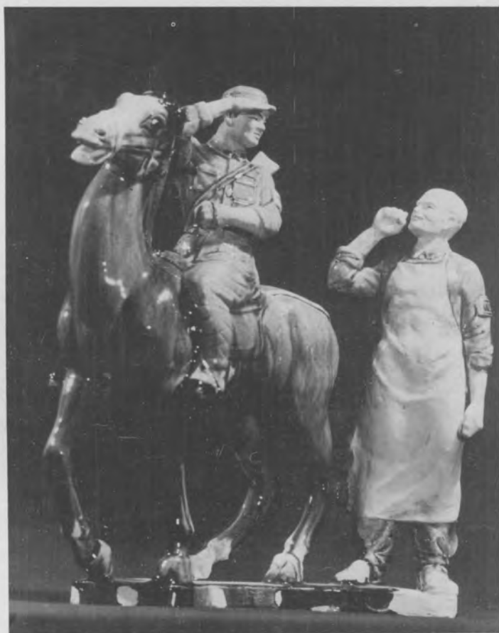
Dr. Norman Bethune and an Eighth Route Army Fighter (painted pottery sculpture).