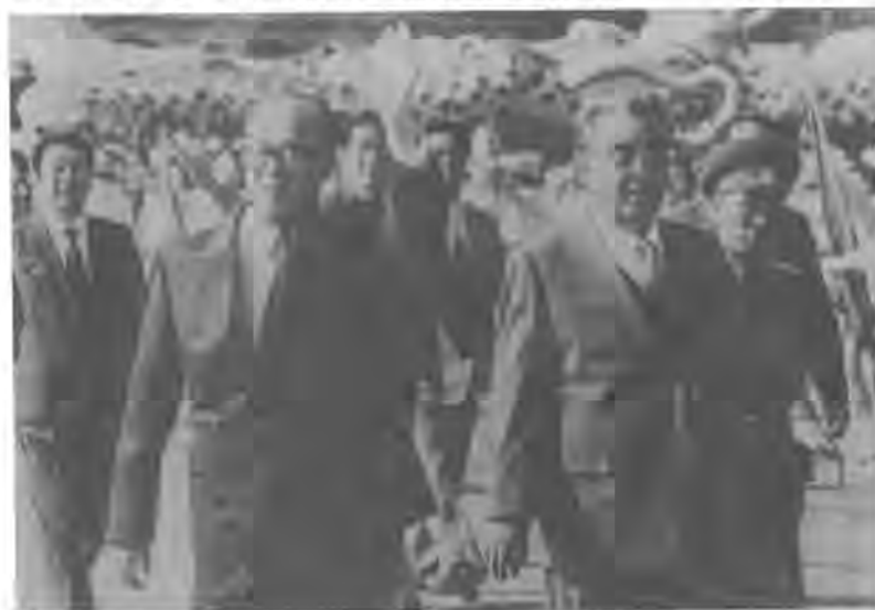
Waving to Korean well-wishers, General Secretary Zhao Ziyang (Front-R.) strolls with Kim Il Sung after his April 24 arrival in Pyongyang.