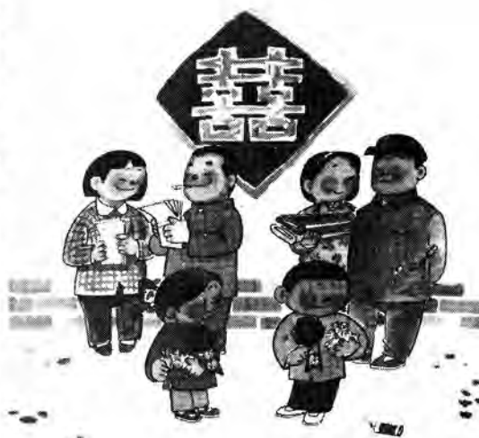
Caricature: Infant marriage still plagues China.