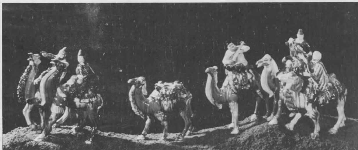
A Trade Caravan Travelling the Ancient Silk Road (painted pottery sculpture).