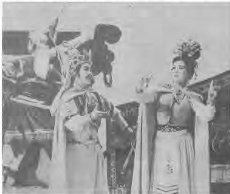
Princess Yile and Prince Nuosang in a scene from "Fairy Yile."

The Qinghai provincial art troupe comprises mainly of Tibetans. They were therefore able to perform Fairy Yile in the Tibetan language, adding even more national flavour to the performance.