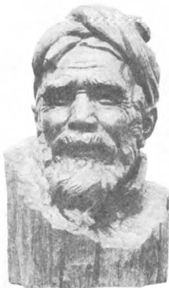
An Old Peasant.