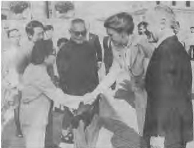
President Li Xiannian and his wife Lin Jiamei welcome King Hussein and Queen Noor al-Hussein.

Palestine Liberation Organization will seek common grounds, put aside their differences and unite to fight their enemy.