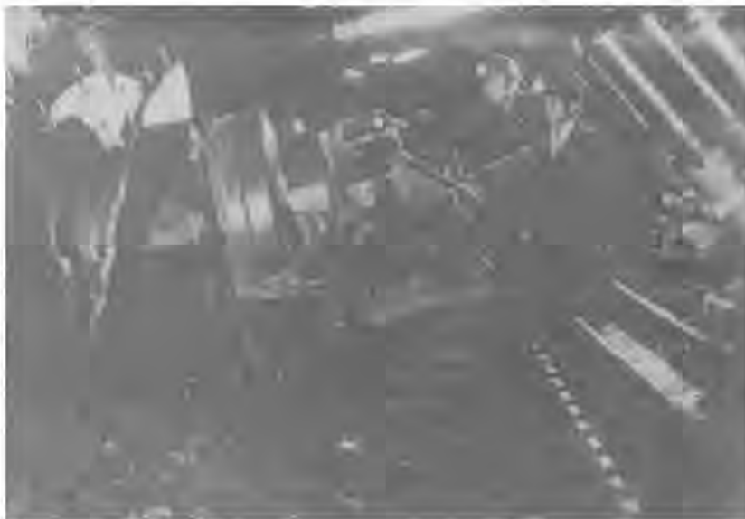
The coal cutting team of the Erdaohezi Coal Mine in Heilongjiang Province adopts a new technology to extract coal from a seam which tilts 17 degrees.

and their annual output totals more than 300 million tons. In addition, there are more than 19,500 mines run by the localities, including small collectively owned mines, their annual output being nearly 300 million tons. The country's total number of coal miners is 4.6 million, of whom 500,000 are engaged in capital construction. There are 29 coal industrial engineering institutions throughout the country, which design coal mines and coal dressing plants of different types and varying capacities. These will play an important role in the future construction of new mines and the technical transformation of existing ones.