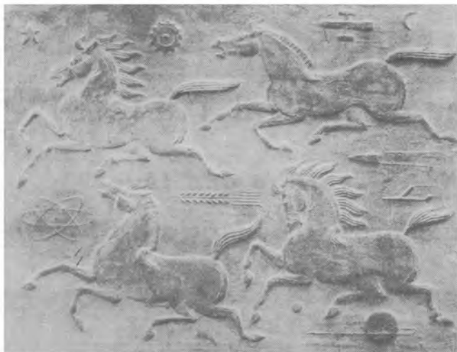
Gallop- ing Horses.