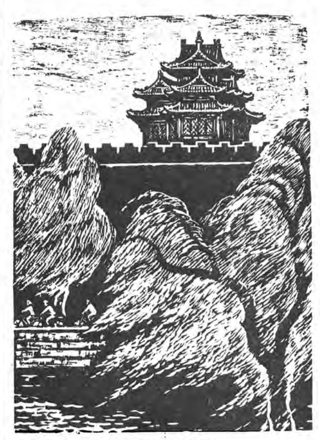
A corner of Beijing.