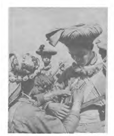
Youth of Lisu nationality in their holiday best for traditional festival.

Four Shanghai families who have won "five goods" titles indicates new ethics for family relationships in present-day China (p. 15).