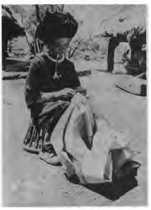
A Va woman.

bers were mostly Hans, yet they were very friendly to us."