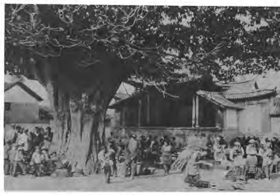
At a rural fair in a Bai-inhabited area.

"However, when a work team organized by the PLA and the Communist Party entered the village, they were not what we thought them to be. Their mem-