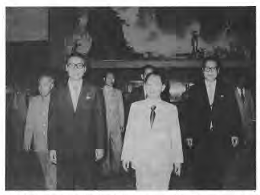
Hu Yaobang meets with Yang Hyong Sop and other Korean comrades.

pendent and peaceful reunification of their country.