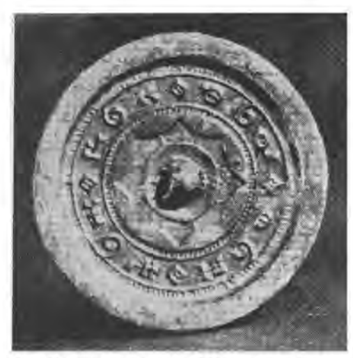
Intricate designs on the back of the bronze