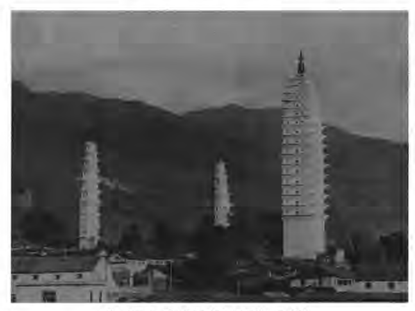
The Santa (Tri-Pagoda) Temple in Dali.

But there is another side to this life. In the mountain