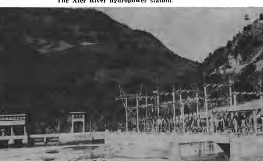
The Xier River hydropower station.

In 1981 and 1982 the province's annual grain output