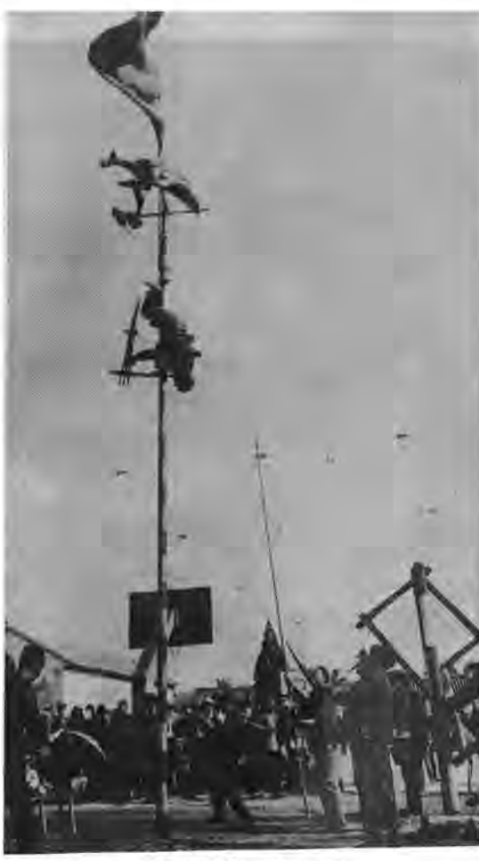
Climbing a pole upside down, a favourite sports event of the Miao people.

The following figures provided by the Luxi County epidemic prevention station show that when prevention work is neg-