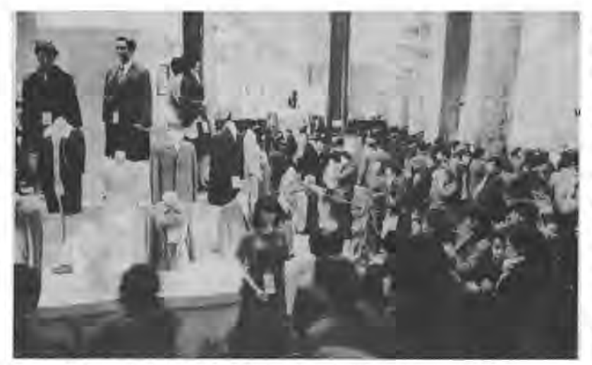
The Beijing sales exhibition of spring and summer clothes.

Stylish uniforms will soon be available for 200 million college and middle and primary school students.