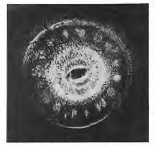
"Reflection" of the back designs and characters on a wall when the sun shines on its smooth side.

dynasty right through the Tang Dynasty (618-907 A.D.).