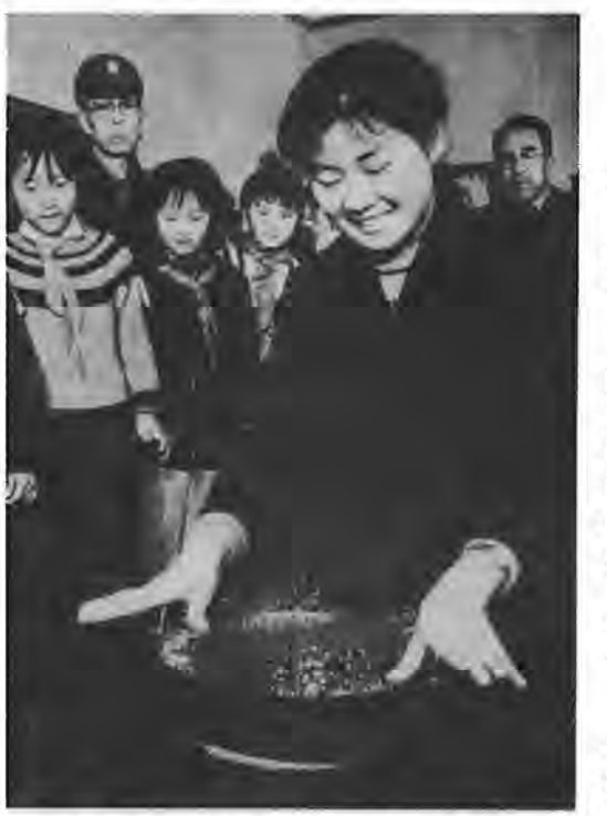
When the two handles of the basin are rubbed, water spurts from the walls of the basin.

How clever the Chinese craftsmen of ancient times were at designing this water-spurting fish basin utilizing natural laws!