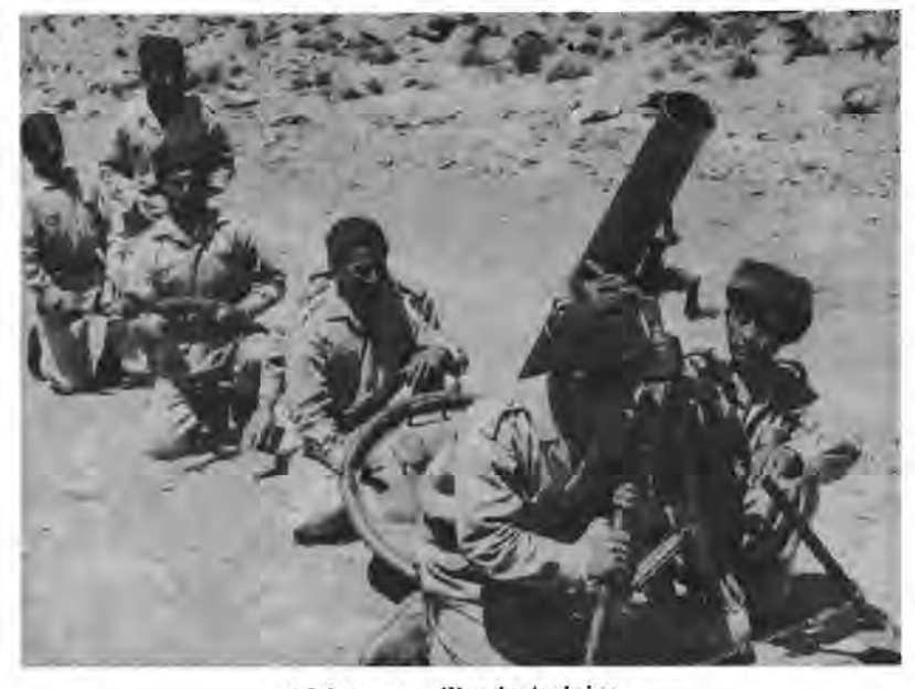
Afghan guerrillas in training.

bat Forces. Although the Afghan guerrillas suffered some losses during the latest campaign, they have gained experience and raised both their fighting capability and morale. The number of Afghan resistance forces has now reached 100,000 and they still control over 80 per cent of the villages and most of the country's mountainous areas.