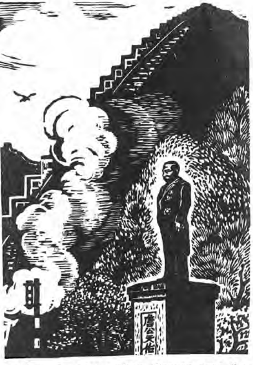
Statue of engineer Zhan Tianyou near the Qinglongqiao Railway Station.