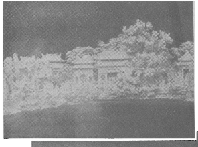
Ivory carving of "Grand View Garden." Inset shows a detail of it.

The craftsmen created innovative techniques while using traditional ones. Hollow, shallow and deep sculpting as well as bas relief — all are used. In addition, it is the first of its kind to re-present a long novel on a single carved piece of ivory.