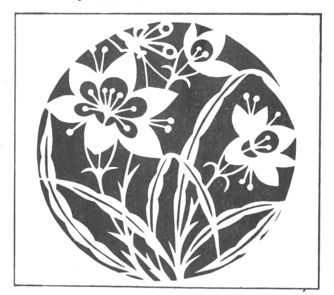
Pillow cover pattern.