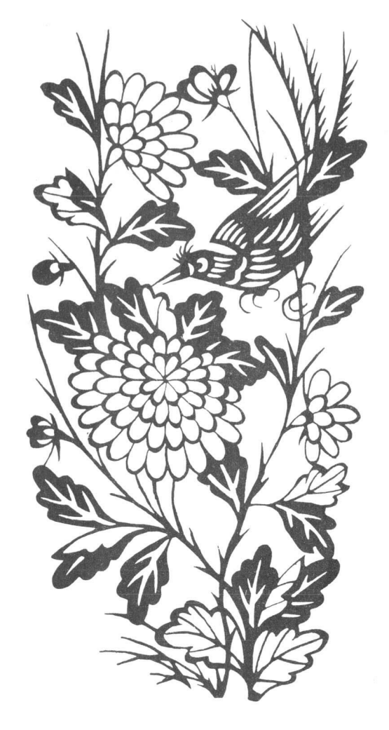
Papercut for a window.