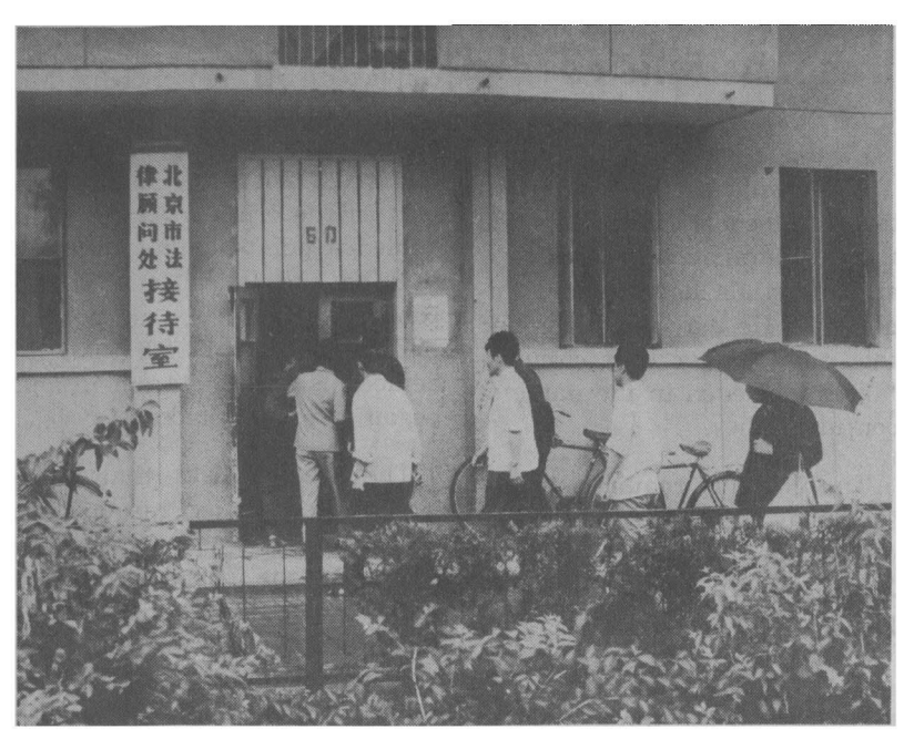
The legal advisory office in Beijing.

— It helps the judicial and educational departments to give professional legal training.