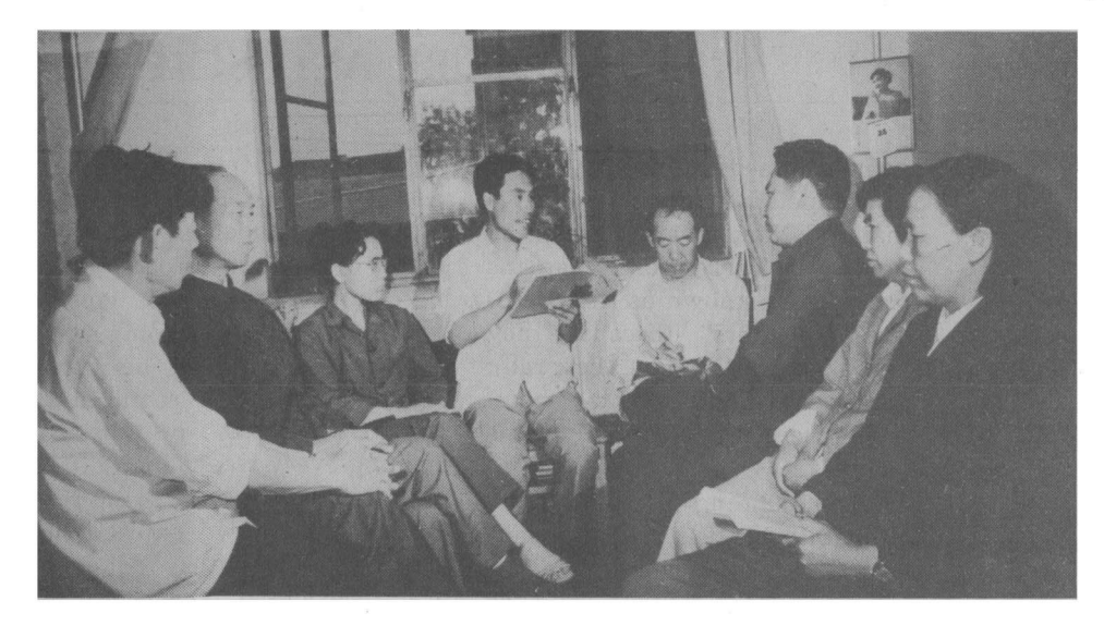
Beijing lawyers prepare a defence in a criminal case.

1,086 letters from the people. It has seen a great increase in economic disputes, as well as enterprises asking for legal advice. Some cases have been rather complicated. These developments are considered a normal phenomenon following the establishment of the legal system.