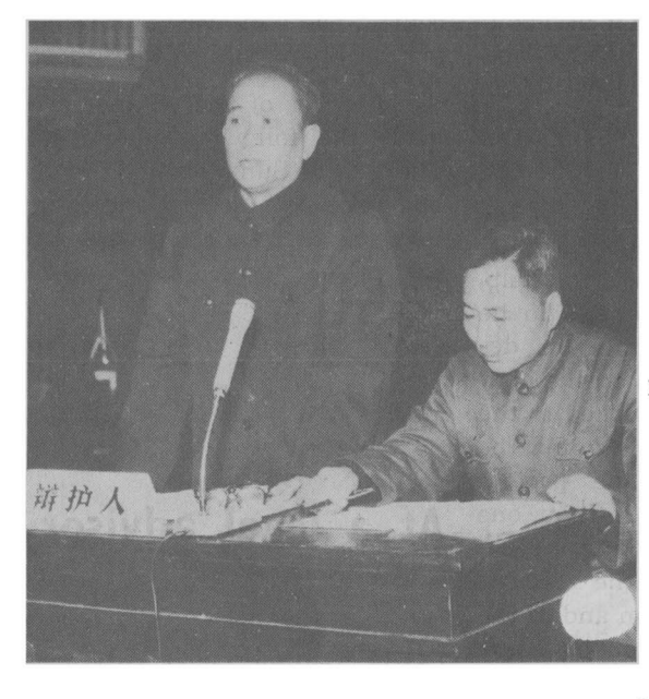
Legal counsels in a Shanghai court.

After a careful review of the evidence and the defence, the