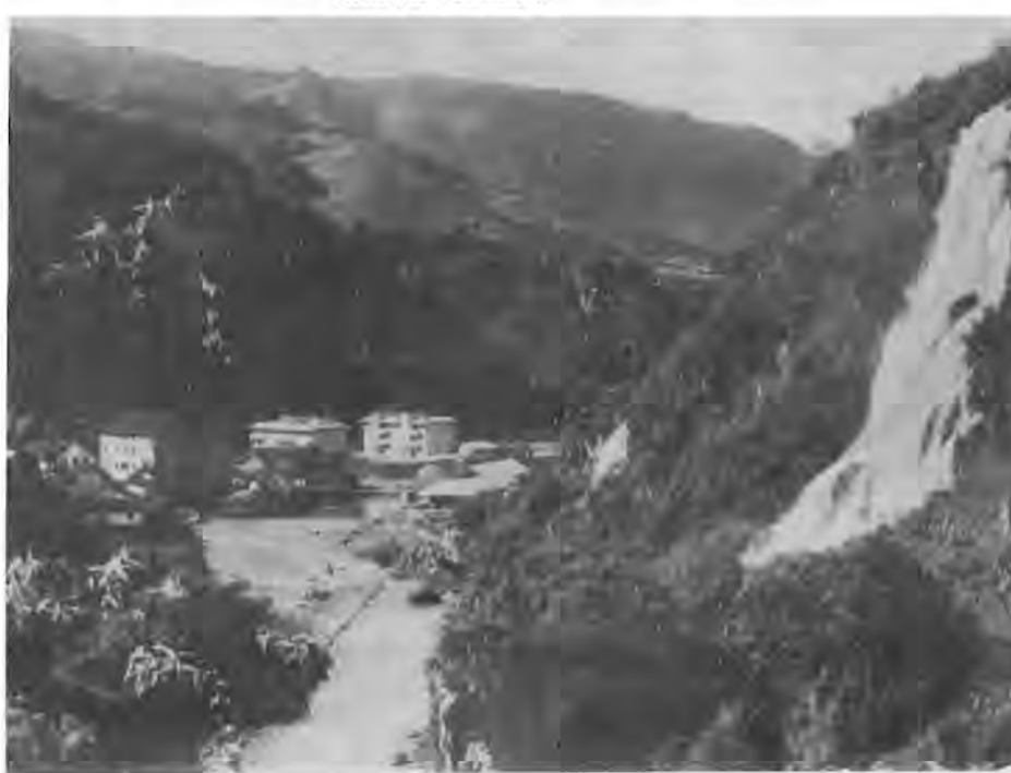
A glimpse of a successful mountain village in Junlian County, Sichuan Province.

Furthermore, the government has properly reduced the agricultural tax in grain for some areas that concentrate on forestry and livestock breeding and changed over to collecting local produce. It also plans to provide grain to areas that cannot grow enough for themselves.