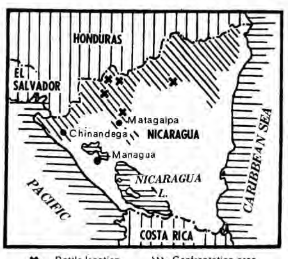
# Battle location

In early March, they launched attacks against government troop garrisons. Fighting broke out in small towns and medium-sized cities. Confrontations spread to six provinces and the anti-government forces even attacked a town 67