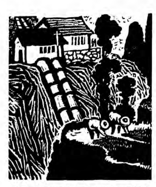
A country scene. Woodcut by Zheng Yulin

Artists capture the bustle of activity in China's vast countryside brought by the policy changes of the last few years.