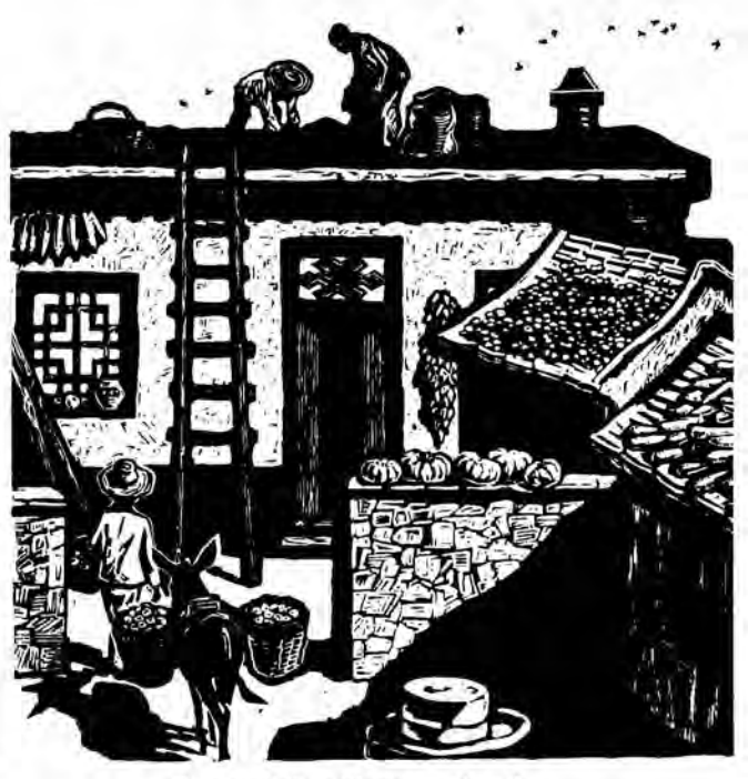
A mountain village courtyard. Wooden by Gu Yuan