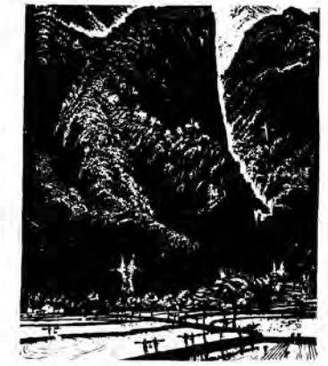
In the mountainous areas. Woodcut by Gan Yingxiang

Progress in mountainous areas has been accelerated by the implementation of new policies, illustrated here by the achievements of one county in Zhejiang Province (p. 22).