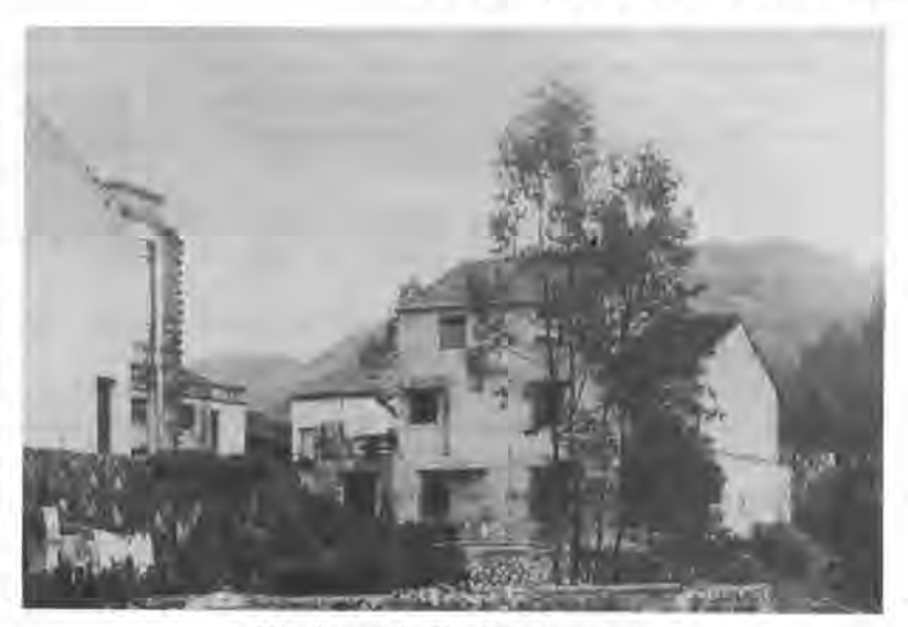
New houses in Shankou commune.

In grain production, for example, the per-hectare yield is only 7.5 tons, half of that in better-off counties. The output can be substantially increased with the application of scientific farming methods such as planting better-quality seeds and more rational use of fertilizer and irrigation.