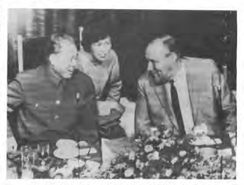
Premier Zhao Ziyang talks with Prime Minister Muldoon.

The two leaders also discussed the world economy. Prime Minister Muldoon detailed his proposal for a new Bretton Woods Conference. Premier Zhao said he deeply appreciated this suggestion in the context of the great changes that have