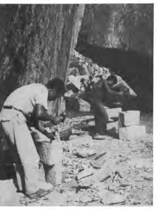
In the quarry of Jintian production brigade.