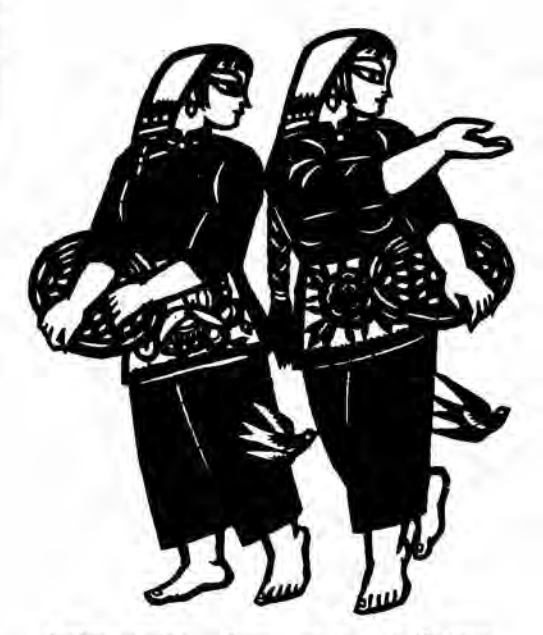
Spring sowing. Paper-cut by Lin Ximing