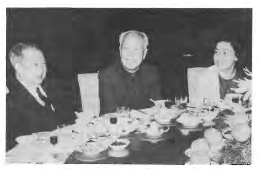
Acting Premier Wan Li fetes Samdech Norodom Sihanouk.