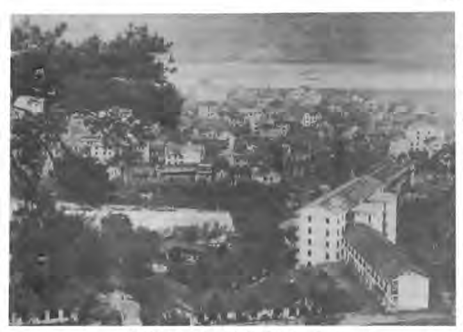
A bird's-eye view of the Qingtian County seat.

The key to economic development is making use of our natural advantages. But in the past we failed to do so," said a county leader.