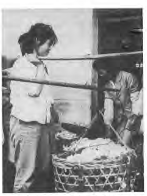
A production team in Hecheng gathers in a rich harvest of silkworm cocoons.

After the team took over the factory, it invited two techni-