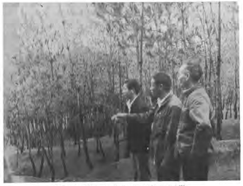
A forestry farm built on once barren hills.

In 1978, the annual per-capita food grain was only 150 kilogrammes. In 1981, it was 250 kilogrammes.