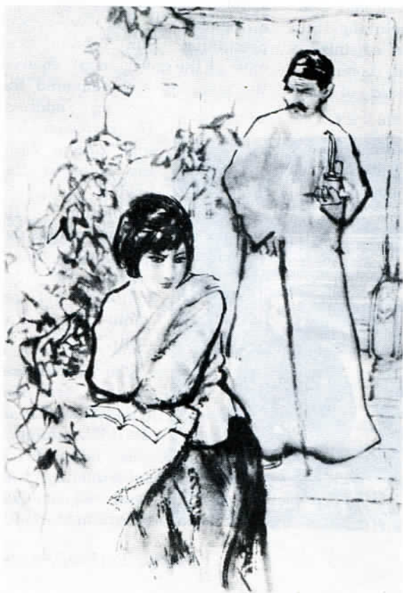
A page from the picture-story book "Regret for the Past," one of Lu Xun's works. Drawn by Yao Youxin

to folk operas, showed concern for the reformation of old operas, supported the growth of modern drama, propounded a theory of folk literature and skilfully practised calligraphy.