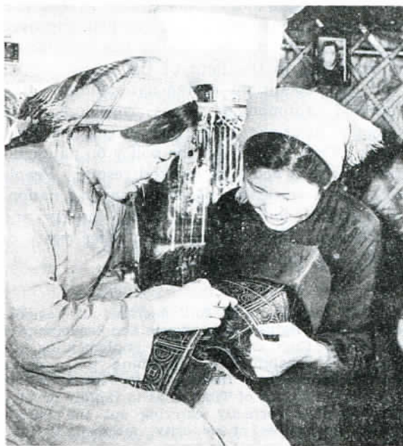
Mongolians making boots for holiday attire.

In our construction, we cannot copy capitalism, maintain or even expand the differences between nationalities in the level of economic development. We must take the socialist road so as gradually to narrow and eliminate these differences. Otherwise, we will no longer be Communists who uphold thorough national equality. Our national regional autonomy is a good system of both political co-operation and economic and cultural co-operation between nationalities. A unified state can give help to minority nationalities in developing their economy and culture, and can organize mutual aid among them. Seriously carrying out national regional autonomy enables us to give play to the positive factors in the minority nationality areas, especially to the people themselves. This will play a tremendous role in promoting the country's socialist construction.