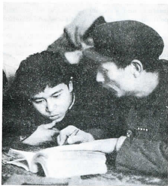
Young Uyghur teacher tutoring a student.

omy. That is a great event that has ever happened in thousands of years.