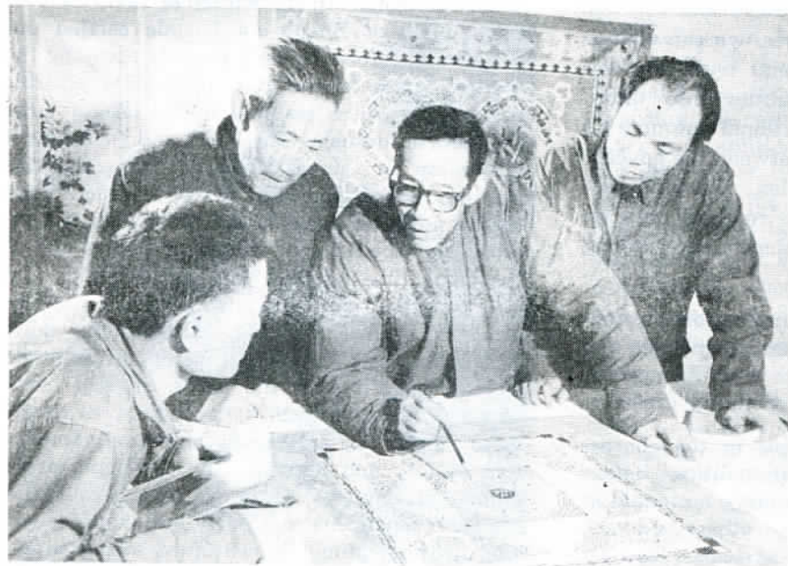
Designers at the Guiyang Nationality Commodity Factory discussing the composition of a silk batik.

Ours is a country of unity and co-operation between nationalities. The Hans and the minority nationalities are represented in the National People's Congress, the supreme organ of state power, in which they discuss state affairs. This is unparalleled in Chinese history. The state grants the minority nationalities the right to act as masters in running local affairs through the practice of national regional auton-