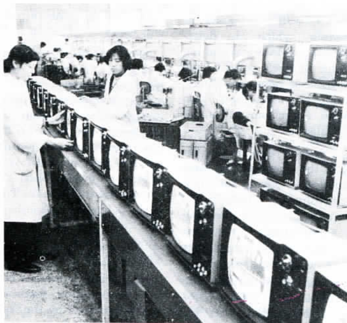
TV sets produced by the Shanghai No. 18 Radio Factory have a good market at home.

—The leadership of every enterprise should work diligently and take effective measures to solve problems affecting the quality of products or projects, learn modestly so as to master the advanced technology and experiences of foreign countries and popularize effective quality-control methods.