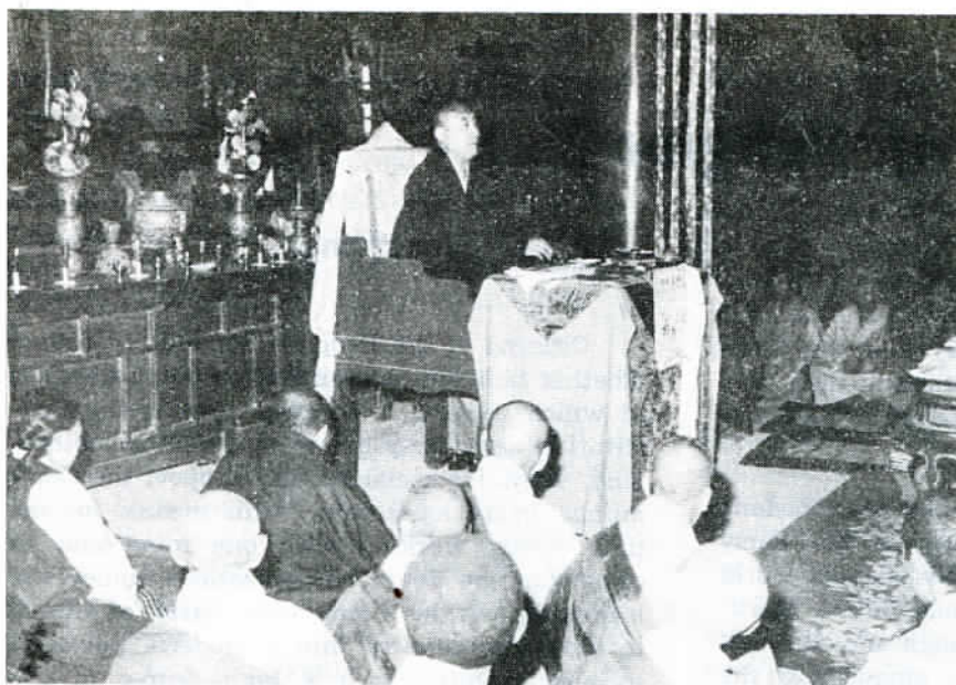
The Honorary President of the China Buddhist Association, Bainqen Erdini Qoigyi Gyaincain, addressing monks, nuns, pilgrims and lay Buddhists in Shanxi.

Of course, religion is not eternal. Once the system of exploitation is done away with, religion will find its influence weakening with the development of production, the flourishing of science and technology, the betterment of people's material and cultural well-being, the enlightening of their minds and the raising of their cognition to a higher plane, and it will eventually die out. But this will take a long historical period. As long as religion is in existence, there will be people believing in it—this is an objective fact. In present-day China, a considerable number of people are religious believers. We should respect this objective fact and proceed from this reality in working out our policies.