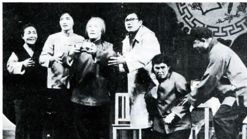
A scene from "Smashing a Bowl."

In the last few years, numerous operas on historical themes have been restaged. In addition, new operas, like the 10 presented at the recent festival, which reflect modern life while preserving traditional styles, have been developed. These operas are extremely popular. The Fourth Daughter staged in September last year in Sichuan's Zigong had a 90 per cent box-office gross and about 20 per cent higher than a traditional opera piece. Smashing a Bowl has been staged for more than 300 times, thus becoming the most widely performed huaiju opera ever.