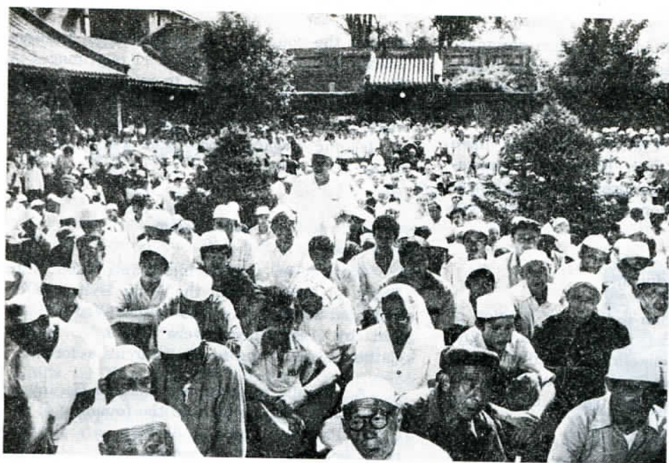
Chinese and foreign Moslems gathered at a mosque in Beijing to celebrate the Id-ul-fitr (Festival of Fast-Breaking).

ple and seven other nationalities who believe in Islam; the Tibetan, Mongolian, Dai, Yugur and other people who believe in Buddhism (including Lamaism); and the Miao, Yao, Yi and other nationalities among whom Christianity is quite influential. This being the case, while we should not identify nationality with religion, we should take note of the close connection between nationality and religion. Carrying out the policy of freedom of religious belief will greatly facilitate a correct resolution of the national question, help strengthen national unity, and consolidate and develop this big Chinese family of nationalities.