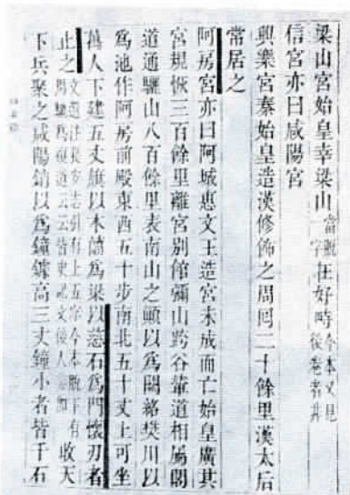
A line from "Sanfu Huangtu": "Epang Palace had a magnetic door and those who bore weapons were forbidden."

said: "The Qin magnetic door was 15 li southeast of Xianyang. It was the north gate of the Epang Palace. It was built of magnetite. When those who wore armour came to the door, they were attracted by the magnetism and could not pass."