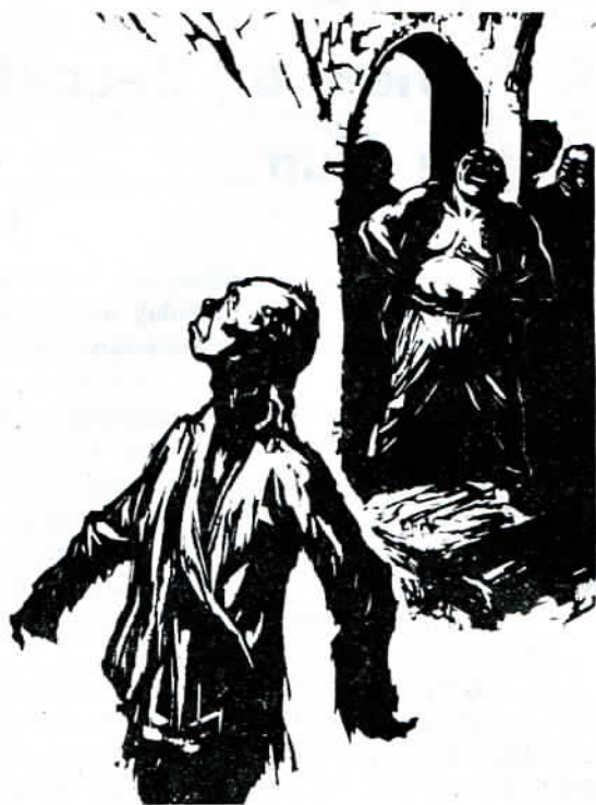
An illustration of a scene from "The True Story of Ah Q."

Lu Xun's thoughts about the reformation of China's national character received considerable attention during the symposium. About 16 papers were devoted to this topic. One author suggested that Lu Xun frequently discussed it with one of his classmates, Xu Shoushang, while he was studying in Japan during the early part of the century.