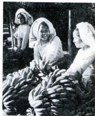
Three Dai women.

Ten operas in traditional styles and with contemporary themes were staged during an opera festival in Beijing last month. Reflecting life today and depicting characters with socialist consciousness, they help educate the people in working-class ideology (p. 30).