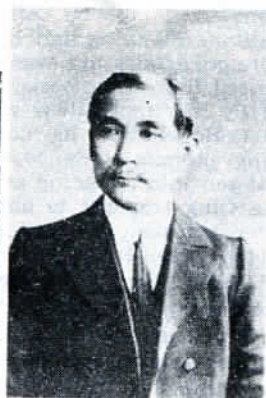
Sun Yat-sen as the provisional president and his office in Nanjing.

the nature of old democracy, was the most revolutionary thinking in China at the time. Sun Yat-sen directed the revolutionary activities of Tong Meng Hui with this progressive thinking, exploded the fallacies of the reformists with his revolutionary theories and overthrew the rule of the Qing government by revolutionary armed force. Sun Yat-sen's Three People's Principles prevailed throughout the anti-Qing revolution, but were unable to cope with the powerful alliance of imperialism and feudalism. Failure to prevent Yuan Shikai from ascending the throne, and especially the failure of the struggles against warlord ambitions in Anhui and Hebei, showed the old Three People's Principles as inadequate to guide the Chinese revolution forward. A new revolutionary road was needed.