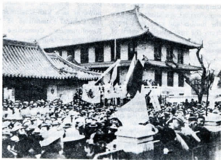
Beijing citizens taking part in the funeral procession for Dr. Sun Yat-sen in 1925.

After experiencing the new-democratic revolution, New