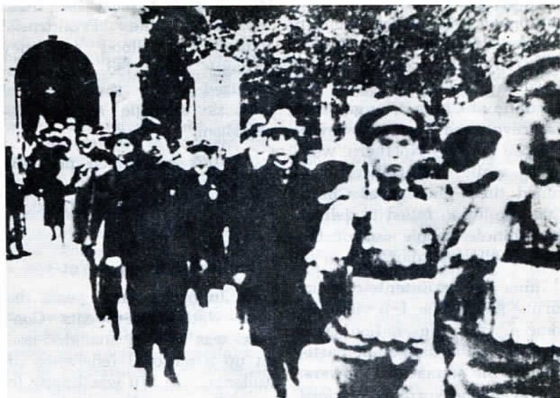
Dr. Sun Yat-sen (centre) and Li Dazhao (left), a founder of the Chinese Communist Party, after attending the First National Congress of the Kuomintang in January 1924.