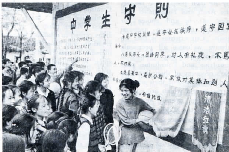
Students of the 3rd Middle School of Guanghua County, Hubei Province, hailing the implementation of the regulations for middle school students.

Vice-Chairman Deng Xiaoping and Premier Zhao Ziyang met on separate occasions with Egyptian Deputy Prime Minister and Foreign Minister Kamal Hassan Aly who arrived in the Chinese capital on September 8. Vice-Premier and Foreign Minister Huang Hua and Deputy Prime Minister Aly had wide-ranging and in-depth discussions on the world situation, the Middle East, Afghan and Kampuchean questions in particular,