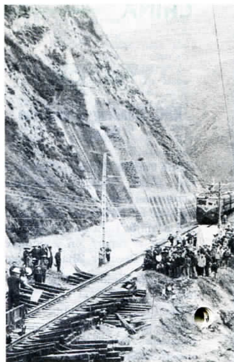
Repairing the railway line from Baoji to Tianshui.

The latest flood took a toll of 764 people; more than 5,000 were injured and 200,000 were