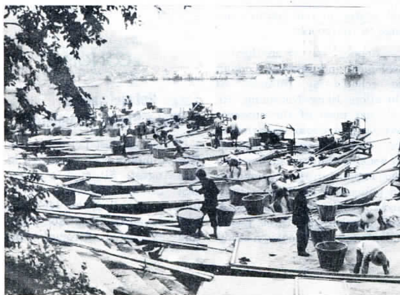
Peasants of Jiaying in east China's Zhejiang Province selling surplus grain after reaping a good harvest of early rice.

With the help of PLA units and the local people, 7,000 railway workers dispatched by the Ministry of Railways braved the