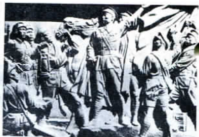
Wuchang Uprising on October 10, 1911. (Part of the carvings on the basement of the Monument to the Heroes of the People at Tian An Men Square.)

The US administration faces hard decisions this autumn at home and abroad (p. 11).