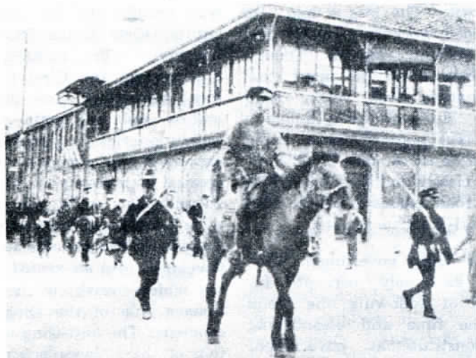
Insurrectionary army men patrolling the streets in Hankou.

Sun Yat-sen's Three People's Principles, though still carried