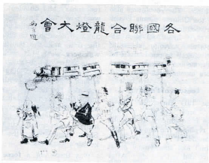
A cartoon carried in a newspaper in 1909, satirizing the Qing government's selling of China's sovereign rights and the imperialist powers' grabbing of the country's railways.

The 1911 Revolution contributed a great deal in ending the Qing court's 260-plus years of reactionary rule and nearly