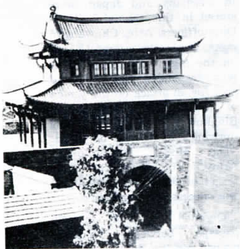
Newly renovated Qiyimen (Uprising Gate) in Wuchang.

In the defence of Yangxia, about 10,000 revolutionaries lost their lives, but the Qing forces also suffered heavy casualties. The Wuchang revolutionary base and the newborn republican regime were defended; the fighting will of the people of the whole country was inspired. Uprisings were sparked in other provinces, thus hastening the collapse of the Qing court. □