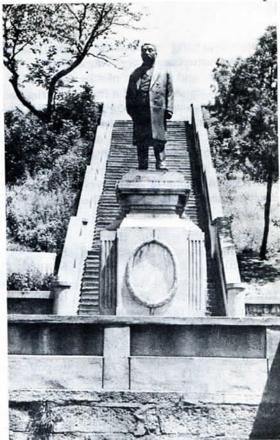
Statue of Huang Xing.

The battle in defence of Yangxia, which lasted for 40 days, added an epic chapter to the history of the Wuchang Uprising. Just a few days after the founding of the Hubei Revolutionary Military Government, the imperial court, trying in vain to strangle the nascent Wuchang Uprising, moved the main force of the Beiyang army to Hubei and launched a large-scale attack. By that time, the Revolutionary Army had already grown into a force of 30,000 soldiers. Though half of them had no training and many still in civilian clothes, they pitched into heated struggle. In the face of the enemy troops which were well-equipped, well-trained and many times more numerous, the Revolutionary Army men fought on resolutely.