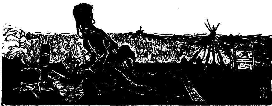
The Grassland Awakes