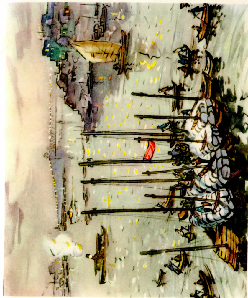
Hankow at Night

"Why didn't she tell me?" Old Liang looked taken aback.