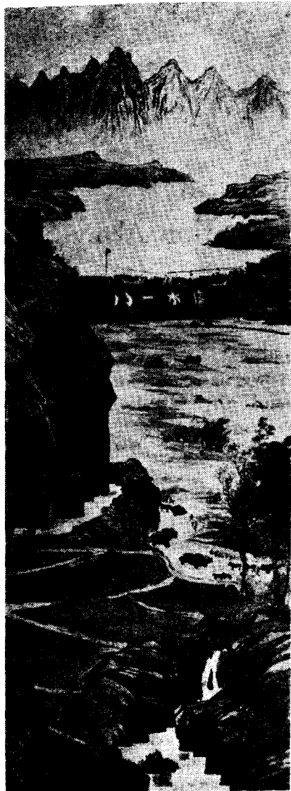
Building the Reservoir