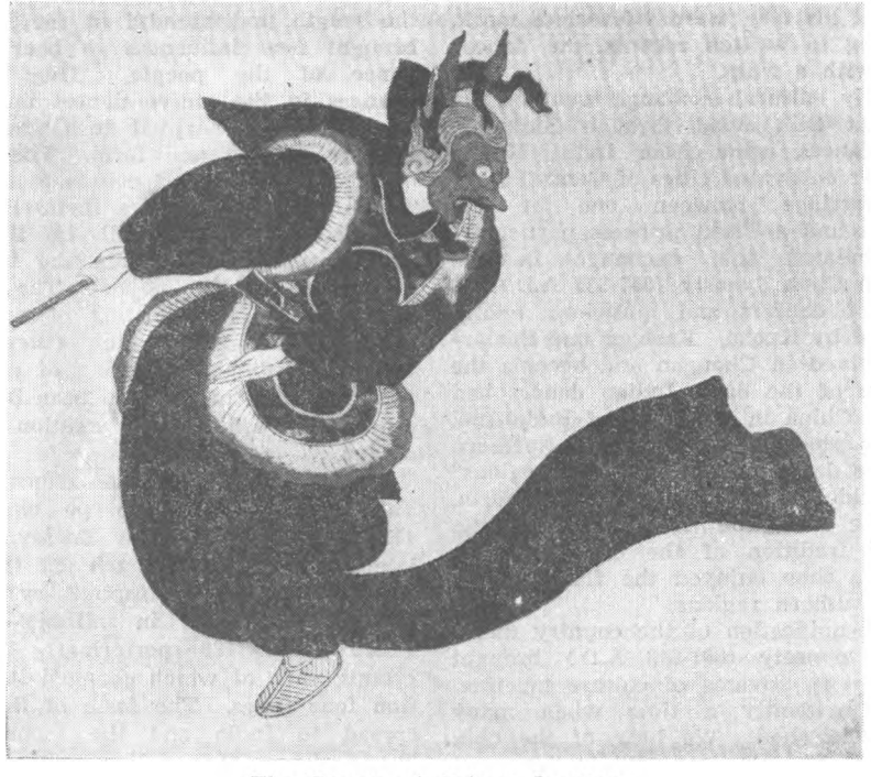
The Dance of Prince Lanling

Stone carvings of the time show that most of the dancers wore long sleeves which are clearly the prototypes of those worn by our own opera actors today. Others danced with swords and still others with long silk streamers tied to short sticks. It may safely be said, there-