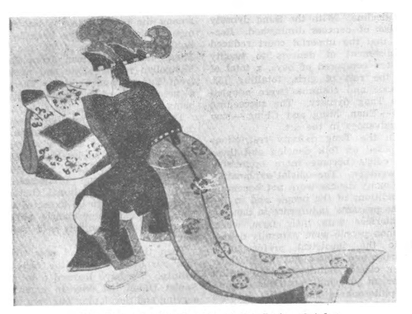
The Dance to the Singing of the Spring Oriole

The absorption of foreign influences which began as early as the Han, increased steadily till the Tang dynasty. But not all the dances that came from outside were accepted in their entirety. Some of them disappeared after enjoying a short-lived popularity. The dance of po han hu (Sprinkling Water on the Frozen Foreigners) for instance is a comedy in which men on horseback sprinkle water for fun from the leather bottles they carry onto walkers on the road. After a short time the dance was transformed into hun tuo wu, a dance of