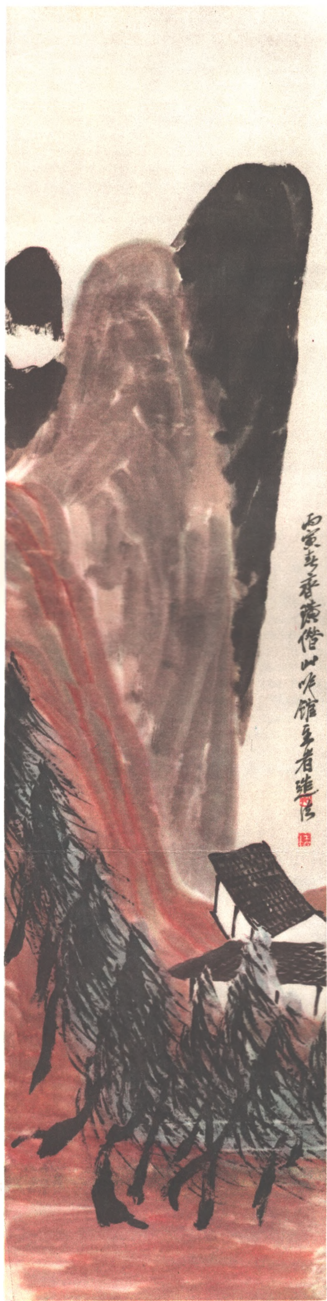
CHI PAI-SHIH: Wind Blows from the Mountain