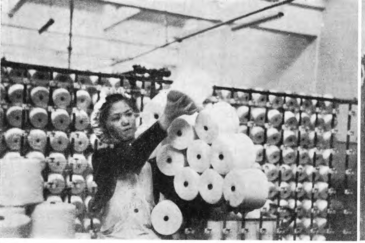
A model worker in the spinning department