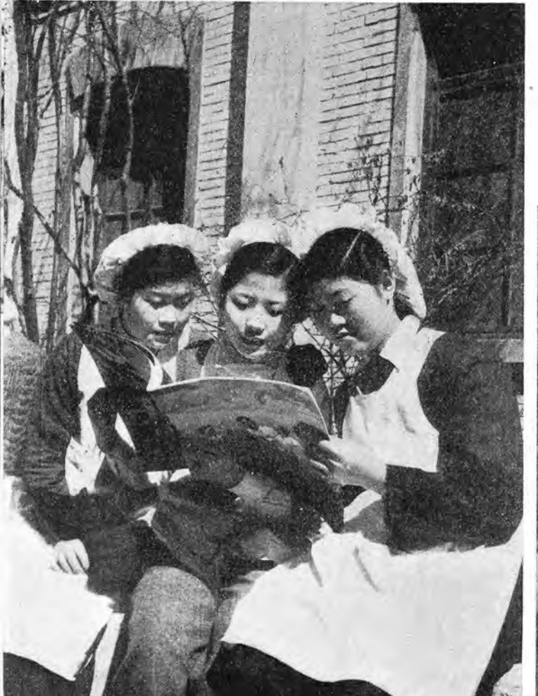
During a break workers relax with popular magazines