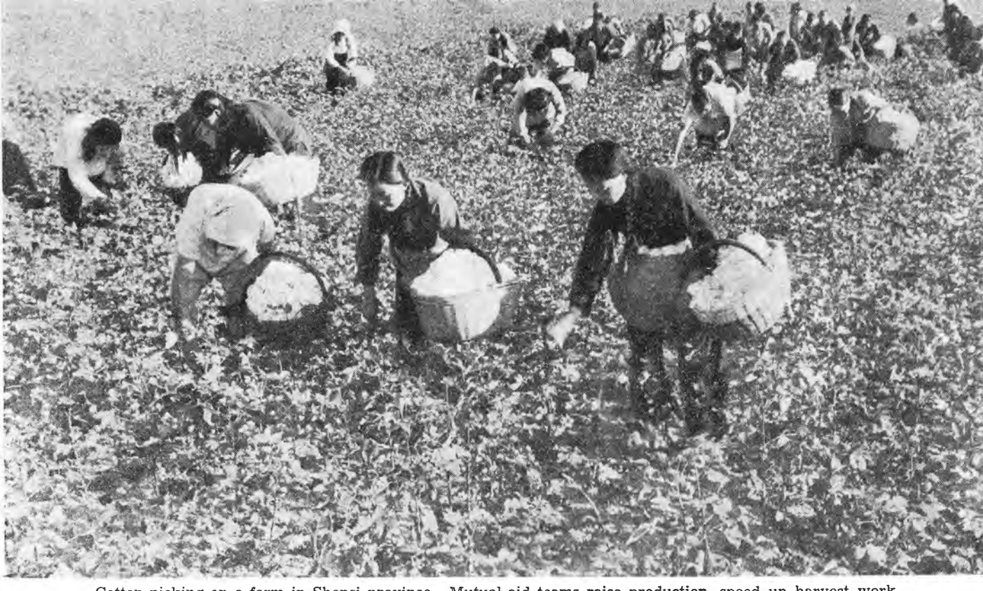
Cotton-picking on a farm in Shensi province. Mutual-aid teams raise production, speed up harvest work