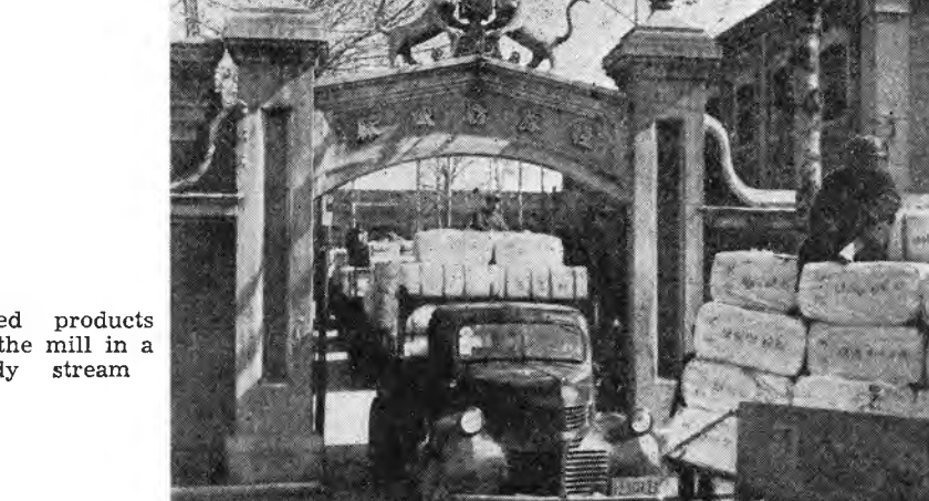
Finished products leave the mill in a steady stream