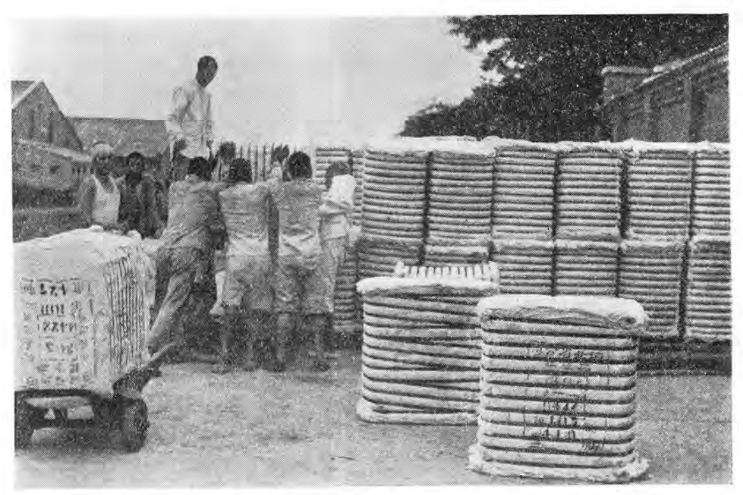
After sale to the co-operatives and state-trading agencies, cotton is baled for delivery to the factories

China's textile industry has been transformed. Freed from imperialist domination, it is now working for the people. The problem of raw materials has been solved by the peasants' enthusiastic response to the call of the People's Government to expand cotton acreage. In 1950, cotton yarn production was 16 per cent and cotton cloth production 7.8 per cent above the 1936 level. Enough cotton textiles are produced to meet the nation's urgent needs.