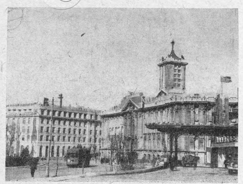
The Port Arthur and Dairen Trade Union building in Sun Yat-sen Square, Dairen

A well thought out cultural network serves the twin cities. They possess 92 cultural clubs and 240 libraries. There are also 483 cultural "stations", places where people can read popular books, attend elementary lessons and talks in the evenings. Many workers have organised brass bands and amateur dramatic troupes. An amazing proof of the genius of the common people flowering in the air of libera-