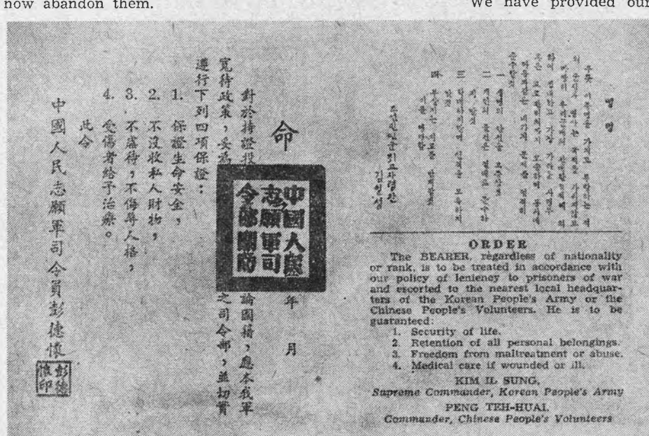
Soldiers of the "U.N." invading forces in Korea who lay down their arms find their way to safety with safe-conduct passes such as that reproduced above

and medical care as well as recreational facilities. And they are free to write to their folks at home. We have built them air-raid shelters protect them from dropped bombs their own planes. And even though we are sometimes short of food on the front, we give newly-taken P.O.W's our own concentrated rations. Many of them have been deeply affected by the real friendship they have found and have publicly expressed their gratitude to the Koreans and Chinese for the good treatment they have been accorded.