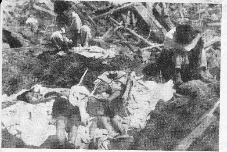
Korean children-innocent victims of American planes

people who weren't able to move, such as old and weak ones. They would yell or they would cry, but it didn't do them any good, we shot them anyway.