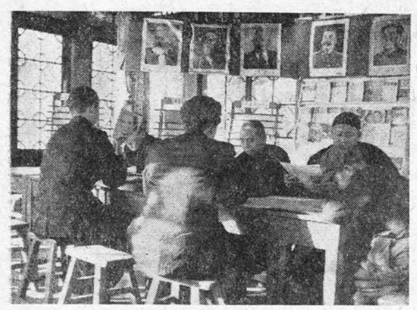
In the reading room run by the G.P.O. in Peking's famed Peihai Park

By the end of July 1951, the circulation of newspapers was increased by 278 per cent and that of magazines by 1,166 per cent compared with January 1950. No small part of this phenomenal increase goes to the credit of the Post Office and its carriers.