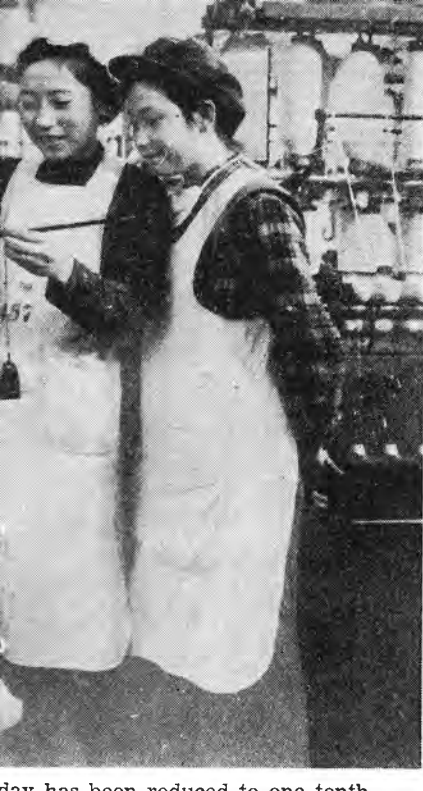
day has been reduced to one-tenth re in a campaign to lower producls themselves keep a daily check