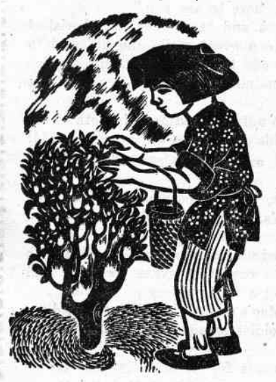
Woodcut by Huang Yung-yu

After Changchiachuang completed land reform in the winter of 1948, the peasants started planning their spring work with greater enthusiasm than ever before. But the villagers were all obsessed with planting more grain, for this