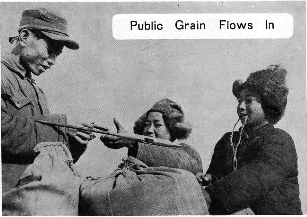
Two brothers get a tag which certifies that their family has fulfilled its public grain quota on time with grain of good quality