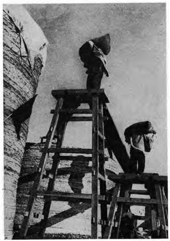
Stocks of public grain to ensure supplies to the PLA and to stabilize the market