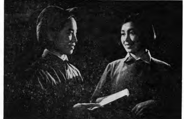
Invisible Front — The fight against KMT spies. A girl (right) confesses to a government cadre that she has worked for the KMT