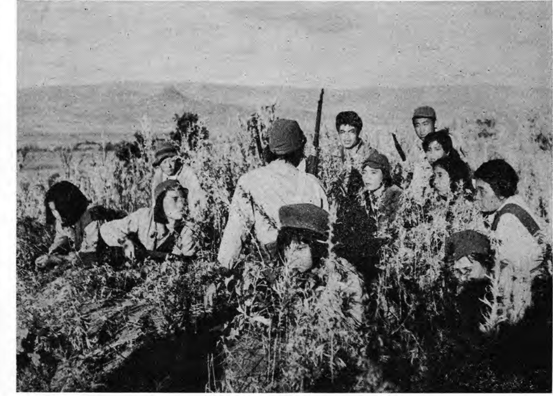
Cornered while decoying superior Japanese forces from their own main units, the eight women leap into Sungari River rather than be captured

bring of 1949, The first full-length duced in liberated e story of how a \gamma workers tackled cruction task. The th an enthusiastic the masses betive realism of its photography and "ked improvements binese productions