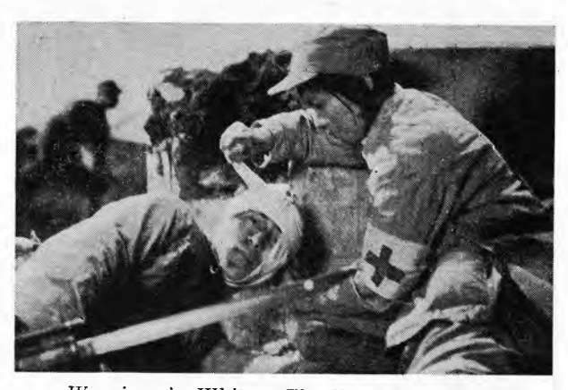
Warriors in White — The life of front-line nurses and their problems in caring for the wounded during the War of Liberation