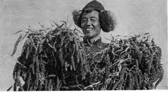
Manchurian peasants flock to pay their lowerthan-ever taxes after last autumn's harvest