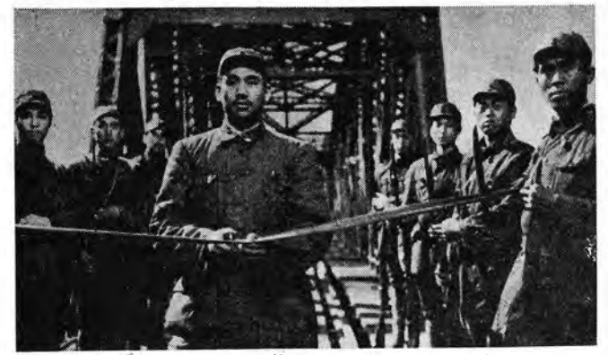
Rebuilt, the bridge is opened to trains carrying supplies urgently needed by the advancing people's army