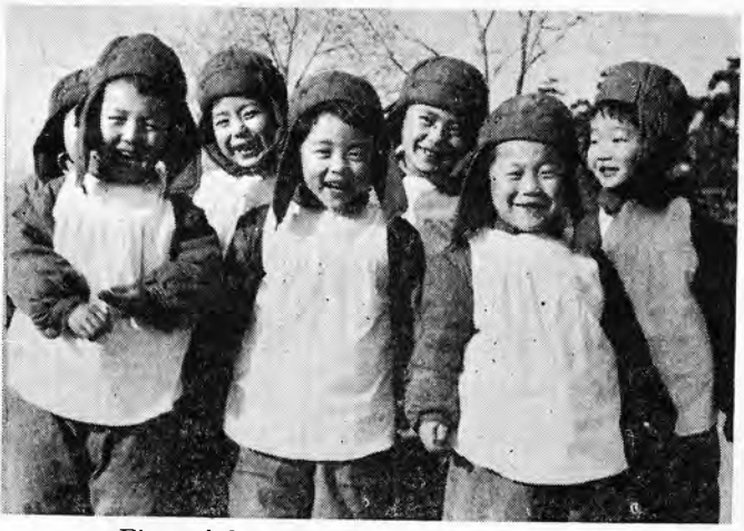
Fit and happy children of New China