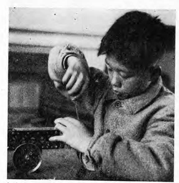
A future engineer at play