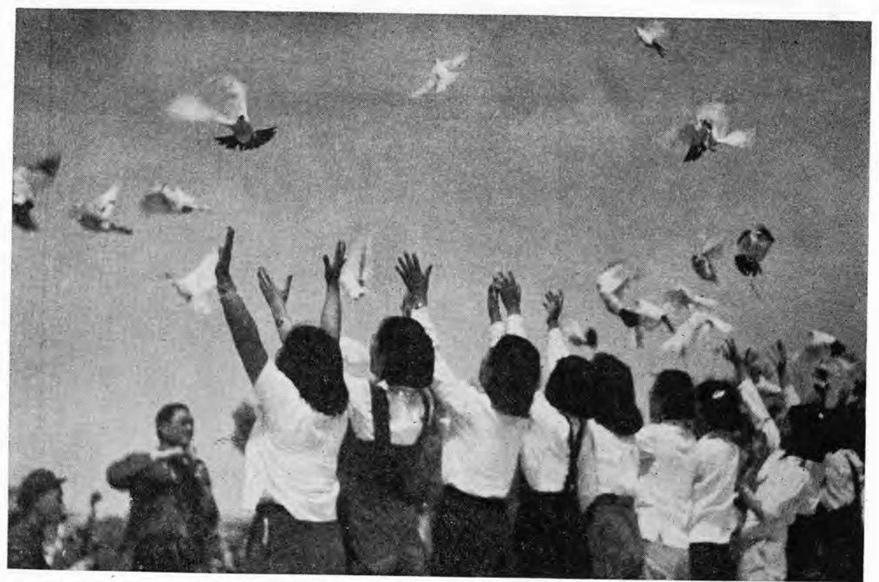
Releasing "doves of peace" at a mass rally at Peking's Chung Shan Park on May 14