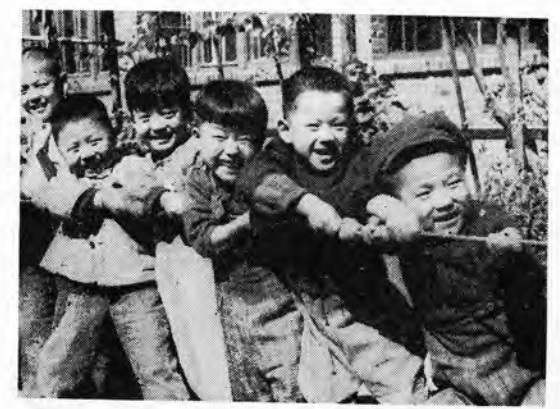
They used to roam the streets