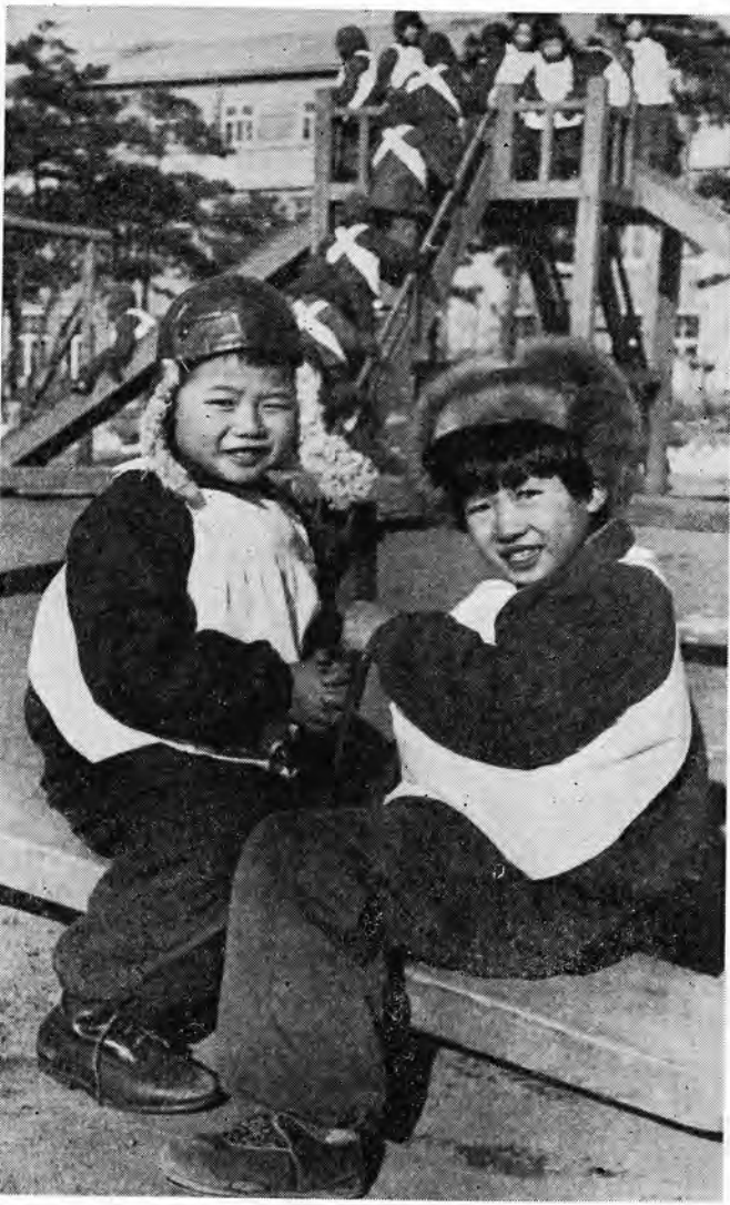
In the playground of a Manchurian nursery. New nurseries are being established all over the country as fast as funds permit