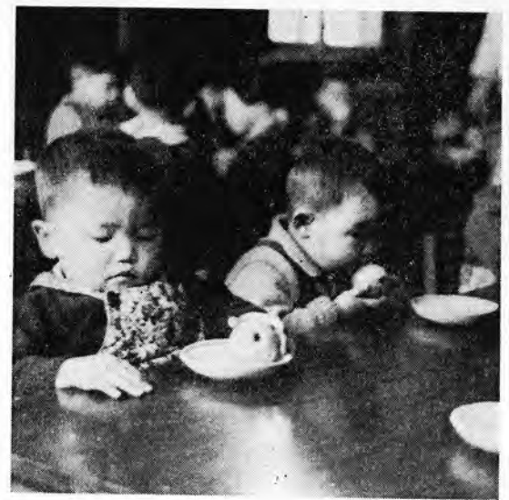
Morning break for fruit