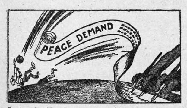
Cartoon by Chao Yen-nien from the Liberation Daily

The Chinese people know that their contribution to this campaign for peace must be practically linked with the task of consolidating their own revolutionary victory, and thus strengthening to the utmost the bastion of peace that is China. They are underscoring their signatures to the peace appeal