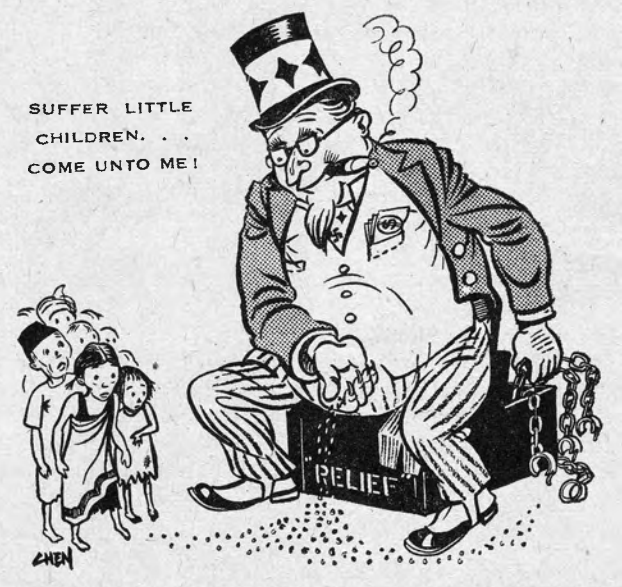
by Jack Chen

American propaganda must be seen for what it is. While the State Department is trying to make political capital out of the "relief" campaign for China, it is paying increasing attention to other countries in Asia, which, in the eyes of the American imperialists, are "under-developed areas" and, therefore, need their "help." If it is not "famine conditions," then it is "backwardness." A pretext can always be found. But the grim face of imperialism cannot be hidden by the sophistries of Truman's Point Four policy "for the development of backward areas." This sugar-coated programme, which the State Department is trying so hard to sell to Southeast Asia, aims at nothing less than dollar domination of the recipient countries. There is no lack of evidence to show that any country which opens itself to the U.S. imperialists' "relief" is opening its gates to U.S. imperialism in all its rapacious greed. The past experiences of the Chinese people should serve as a warning and a lesson to all the Asian nations.