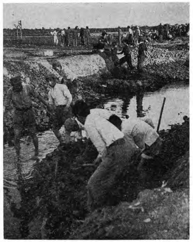
Ke\ Ta intellectuals prove by ditch-digging that they no longer look down on manual labour.