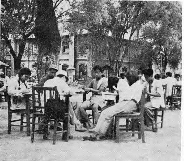
Mass lecture and small group discussion — the two main forms of study at Ke Ta.

A number of KMT agents infiltrated into Ke\ Ta . Here are some of the firearms they later voluntarily surrendered.