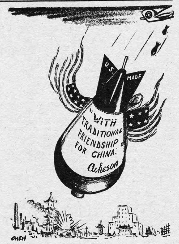
Acheson's Easter Egg

After World War I, American imperialists became the protectors of warlords Tsao Kun and Wu Pei-fu, who wrested control of the Peking regime from the Japanese-supported warlords, Tuan Chijui and Chang Tso-lin. It is well known that the many struggles among Chinese warlords were essentially the reflections of conflicts among the imperialist powers. In 1923, American imperialists