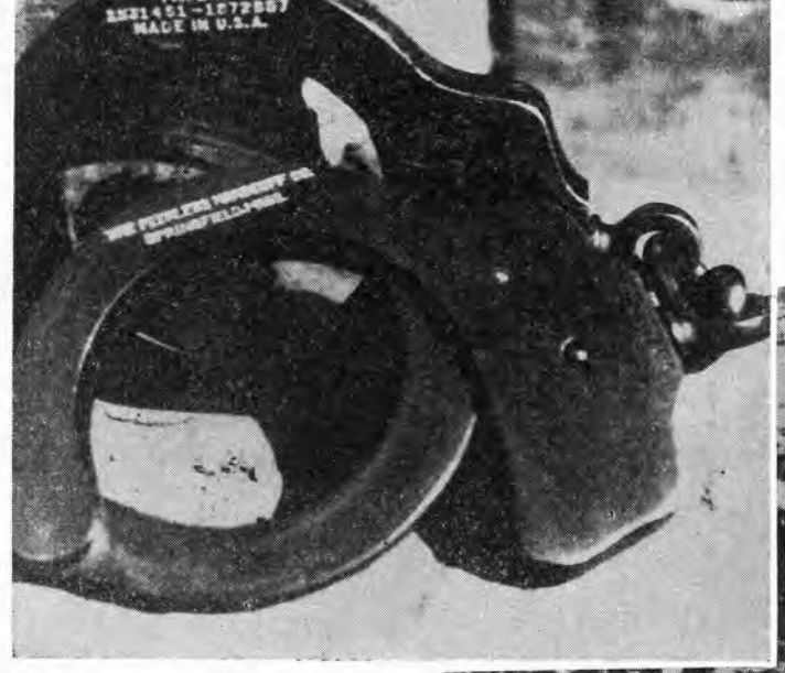
A big burial pit for murdered political prisoners, littered with blood-stained handcuffs. All bear the trade-mark "Made in U.S.A."