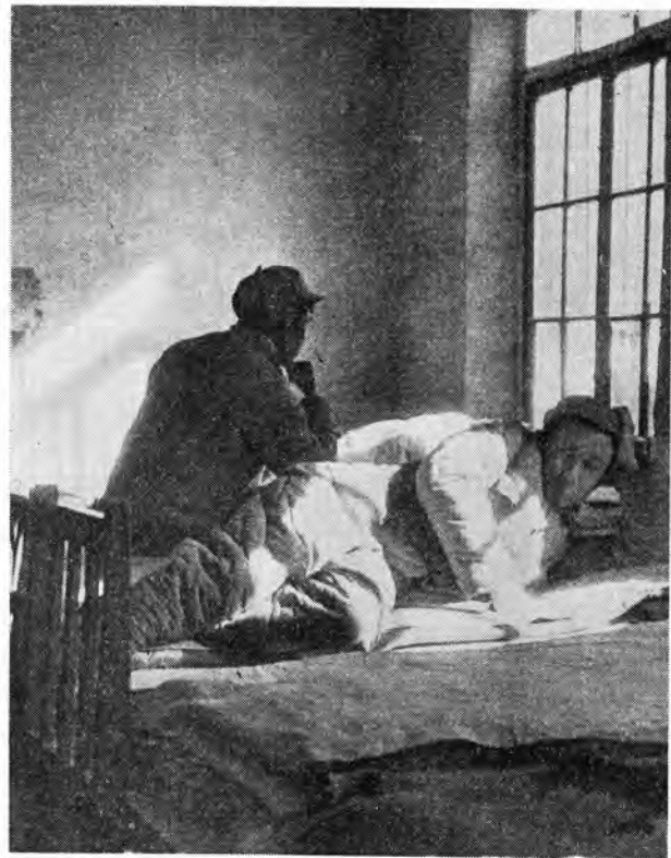
Two Ke Ta students deep in thought as they analyse their former thoughts and actions.