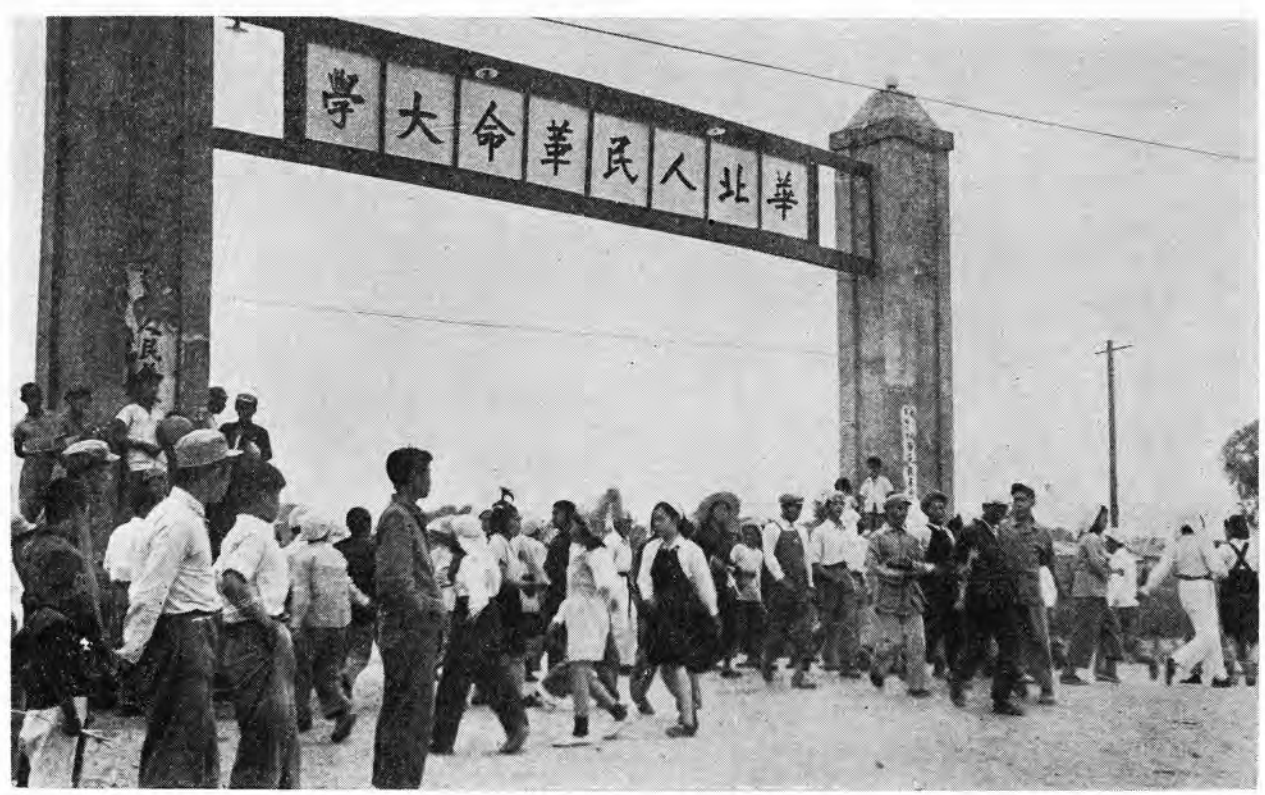
The entrance to Ke\ Ta , the North China People's Revolutionary College, in Peking. Some students are doing a yangko dance. The story of Ke\ Ta begins on page 17.