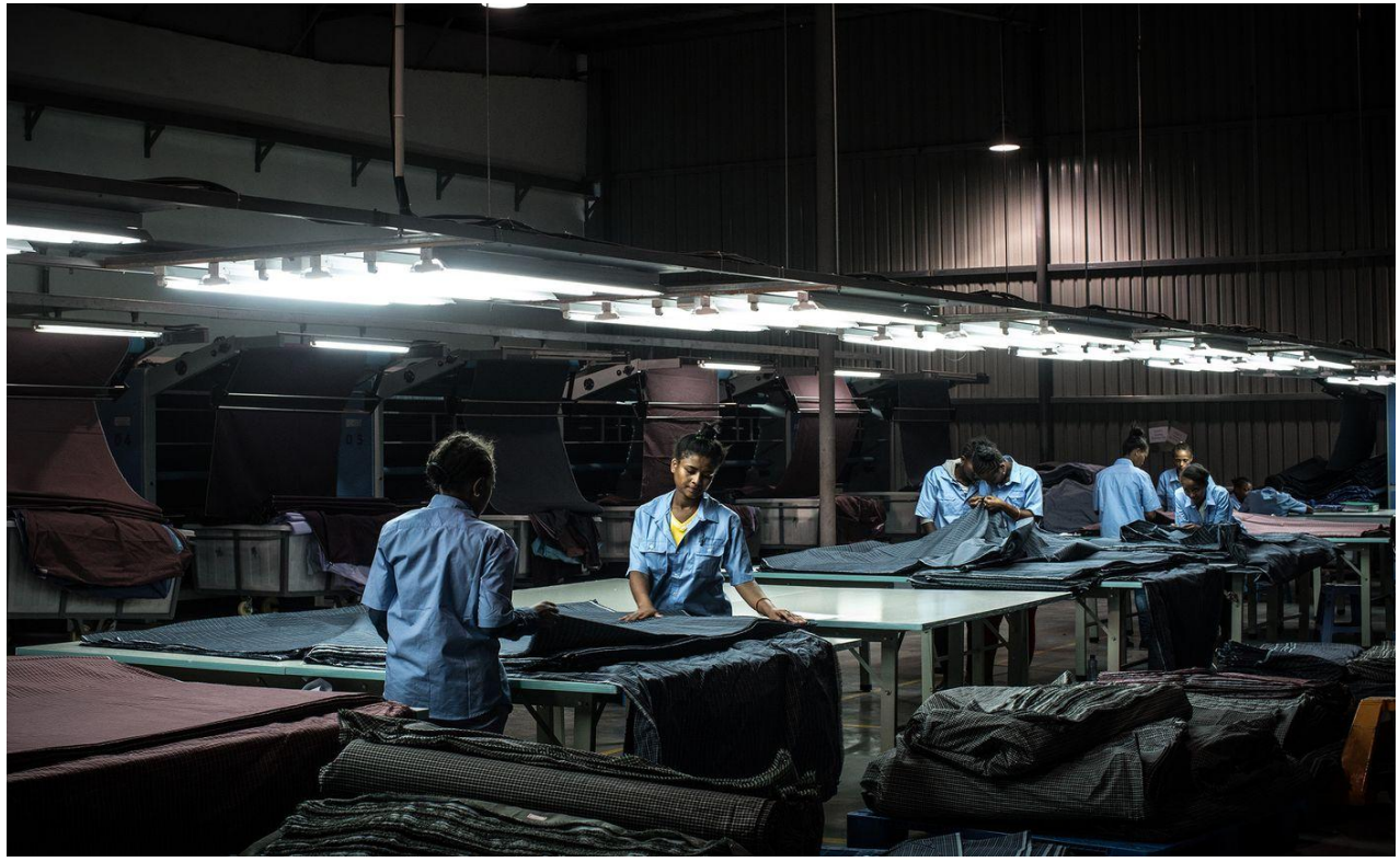
Inspecting finished fabrics.