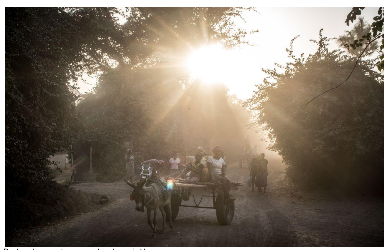
Donkey-drawn carts carry workers home in Hawassa.