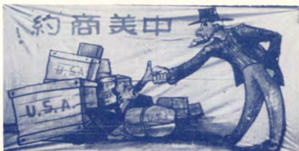
“What the American Trade Agreement (with Kuomintang China) does to the people”