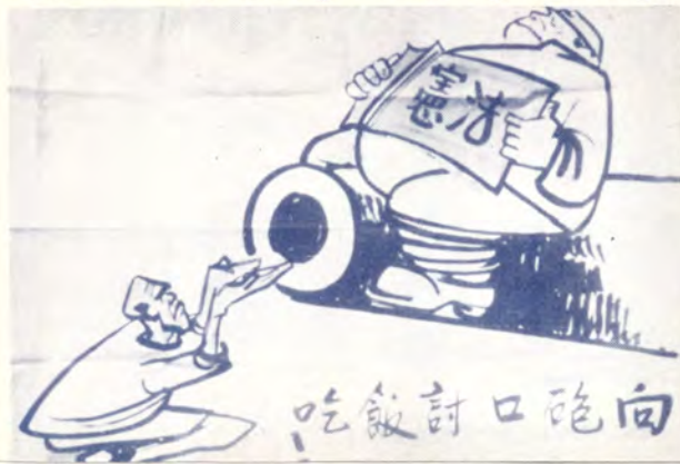
“We beg for food—at the mouth of a cannon with the militarist holding ‘the law’ against the people”