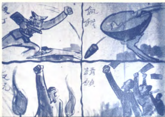
“Police suppression—Rice bowls broken by militarists— Protests—Petitions”