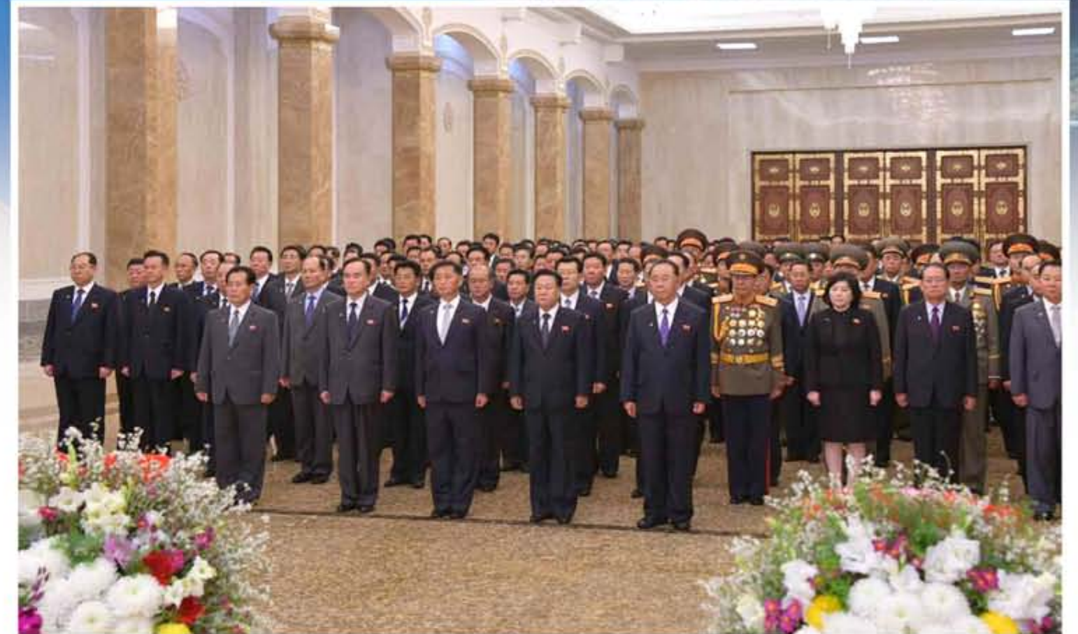
Members of the central leadership body of the Workers' Party of Korea and officials of the Party Central Committee visited the Kumsusan Palace of the Sun on the occasion of the anniversary of the WPK and paid high tribute to President Kim Il Sung and Chairman Kim Jong Il at their statues.