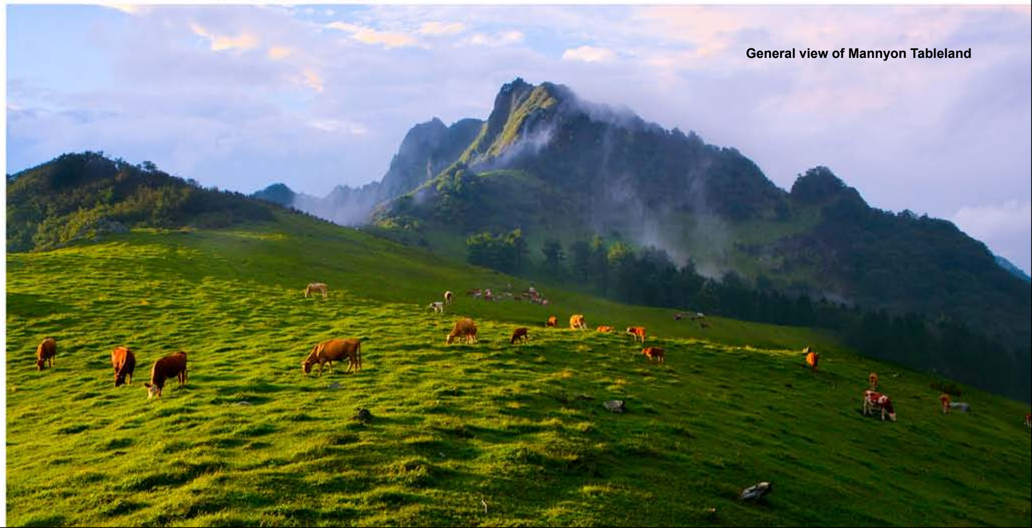
General view of Mannyon Tableland