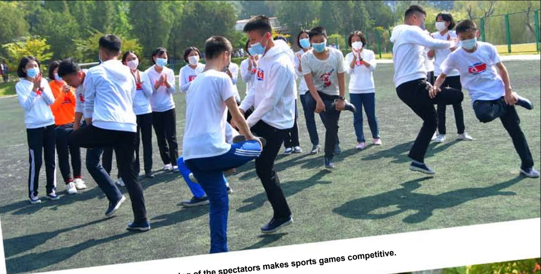
Enthusiastic cheering of the spectators makes sports games competitive.