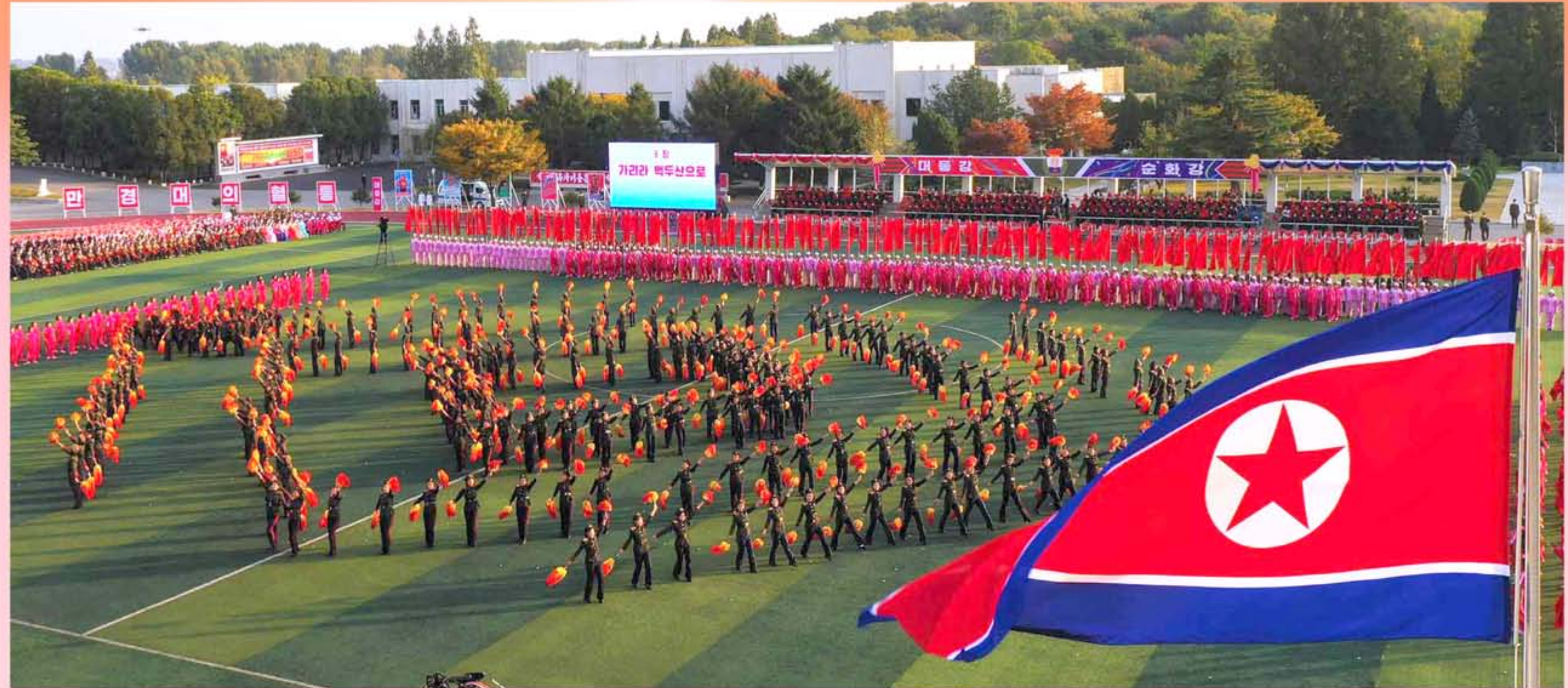
There took place a mass gymnastic performance of the students of Kang Pan Sok Revolutionary School, We will staunchly carry forward the lineage of Mangyongdae, the lineage of Paektu.”