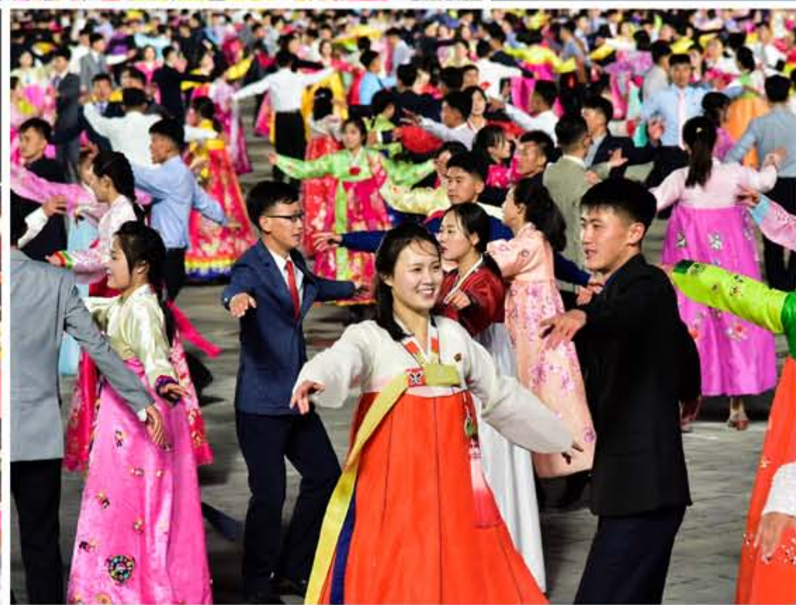
Youth and students held a gala evening and a firework display took place at Kim Il Sung Square in Pyongyang.