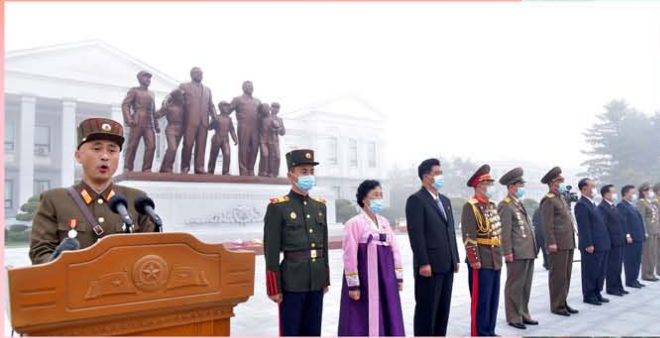
Participants in the commemoration ceremony held a meeting of adopting a letter of pledge to Kim Jong Un at Mangyongdae Revolutionary School.