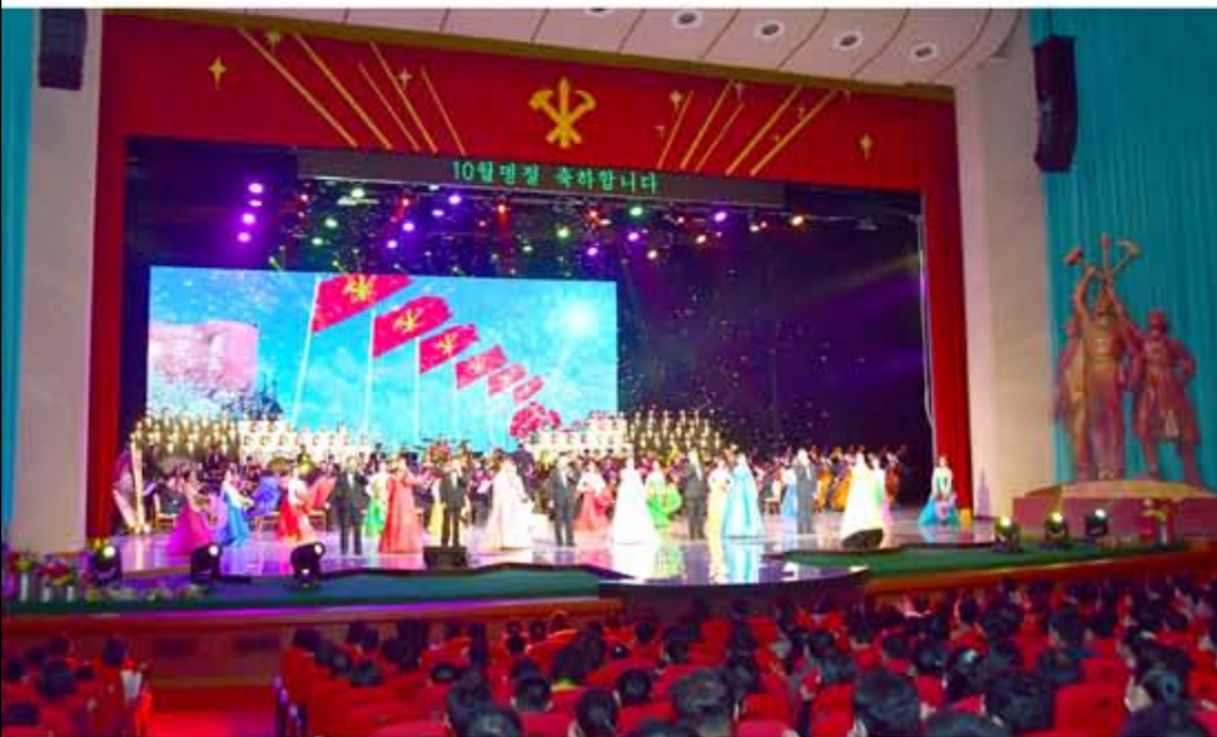
A variety of celebratory performances, including a joint performance by the Mansudae Art Troupe and the National Symphony Orchestra, were given.