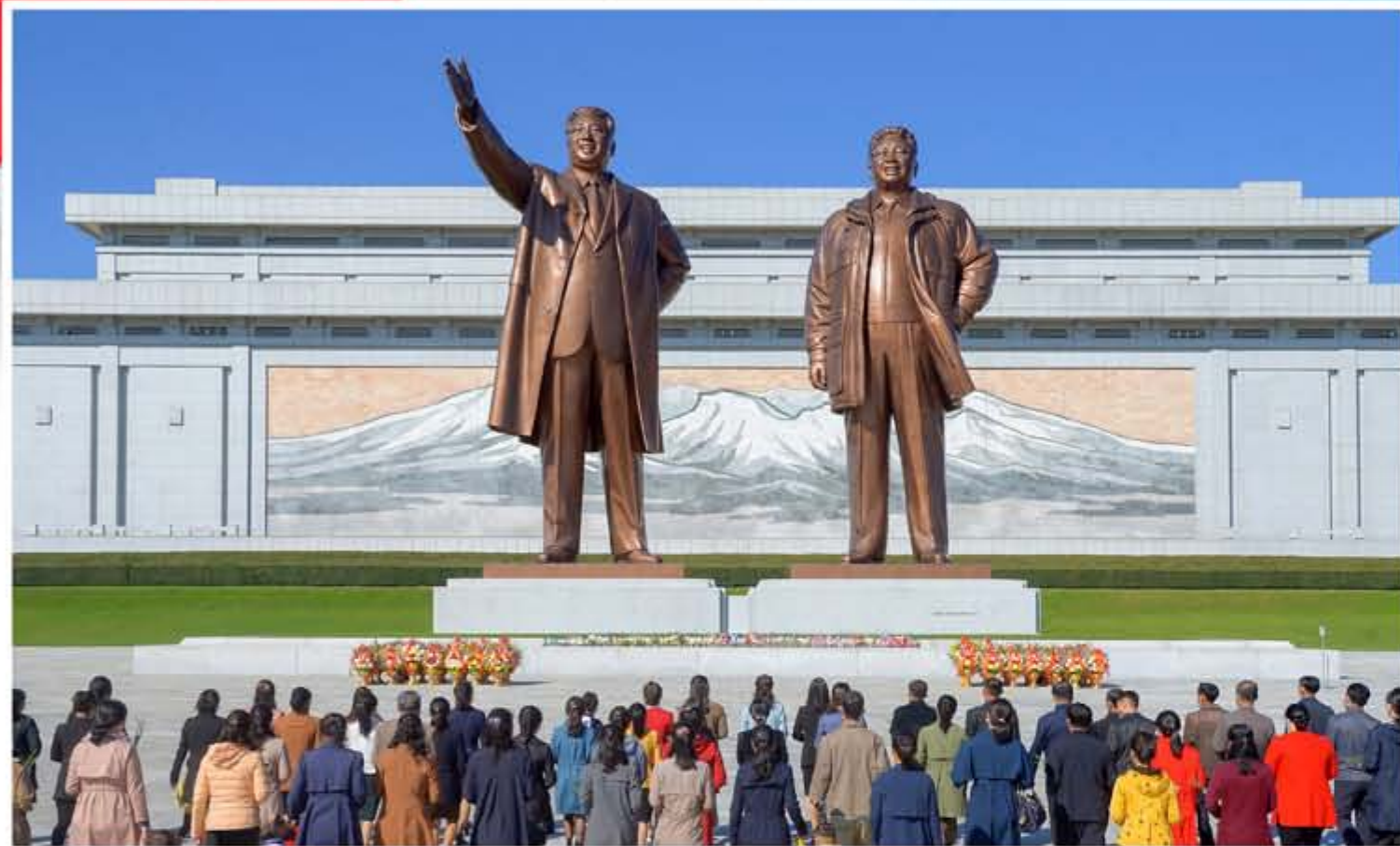
Officials, working people, service personnel, youth and students visited the statues of President Kim Il Sung and Chairman Kim Jong Il on Mansu Hill to pay floral tribute to them.