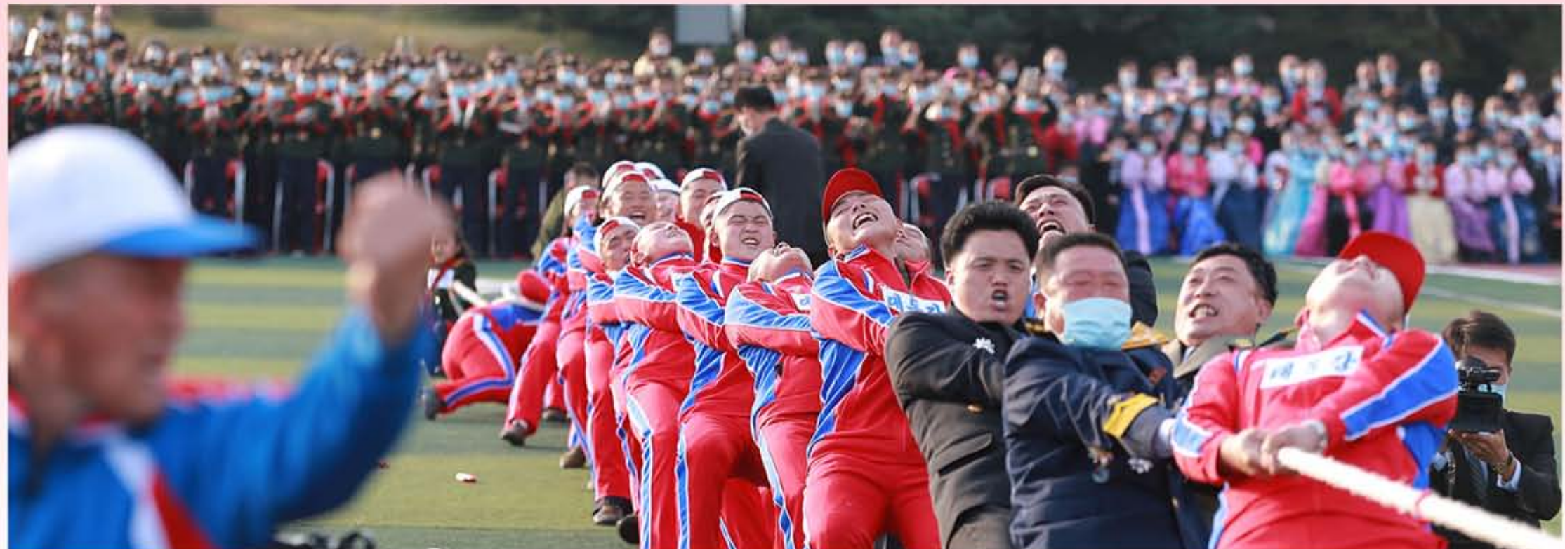
Sports and recreational games to mark the 75th founding anniversary of Mangyongdae Revolutionary School and Kang Pan Sok Revolutionary School took place at Mangyongdae Revolutionary School.