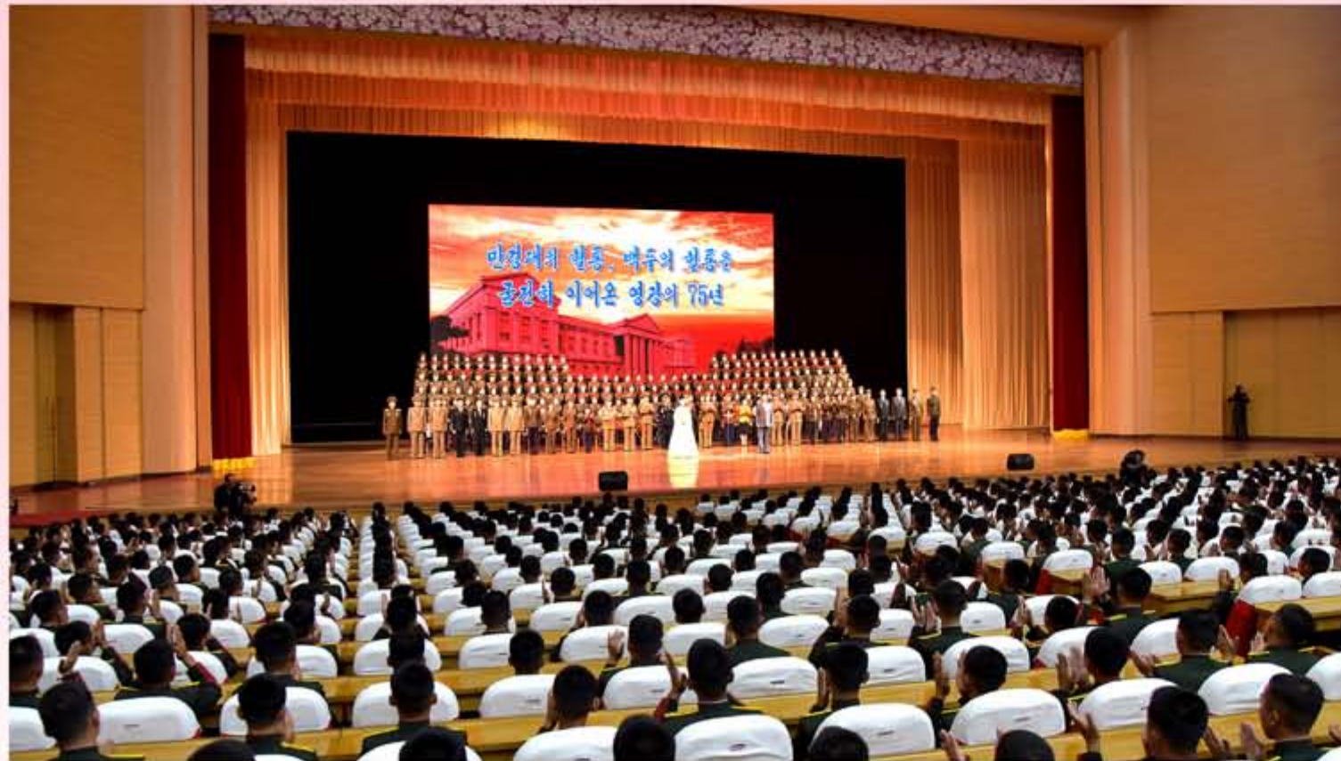
A joint meeting, titled, Glorious 75 years of staunchly carrying forward the lineage of Mangyongdae, the lineage of Paektu , took place.