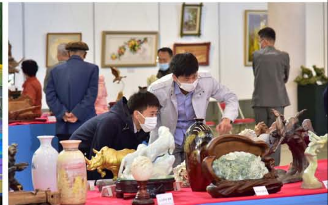
The third national sculpture and handicraft festival was held.