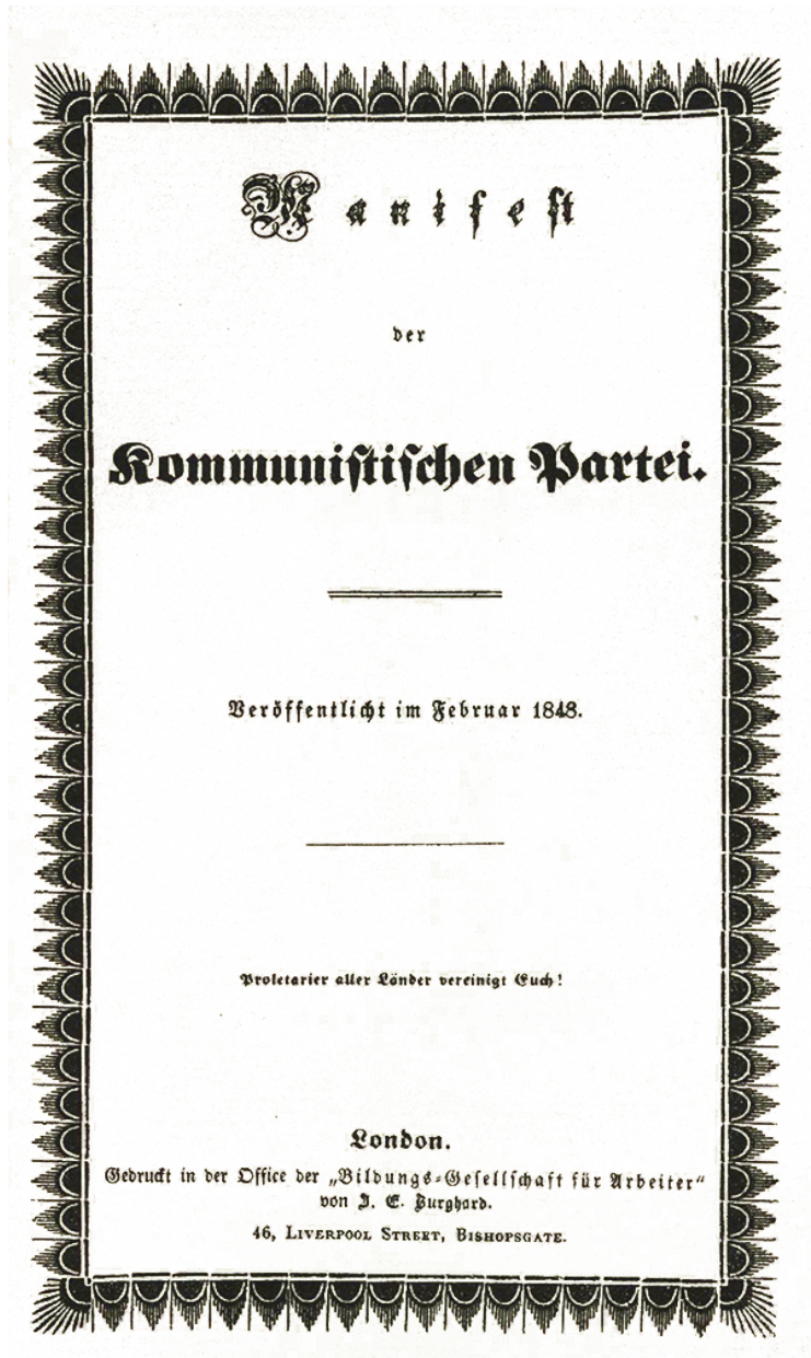
Cover of the First Edition of the Communist Manifesto