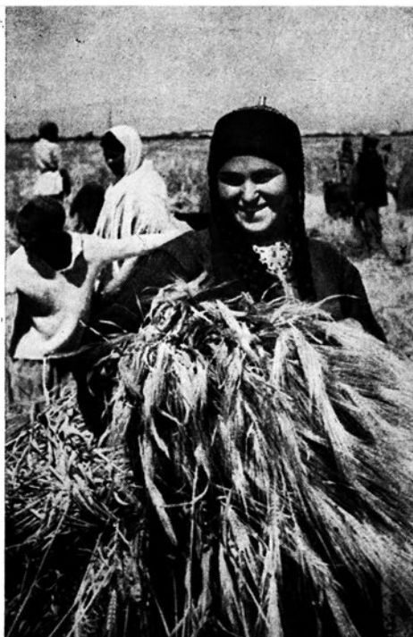
A Turkmenian schoolgirl helps bring in the barley harvest of a collective farm in her native republic.

On the battlefields Hitler's wehrmacht faced masters of mechanized war who had been trained on the Soviet Union's mechanized farms and factories. In the less known battle of hunger the integrated, collective farm system overcame the Nazi seizure of about a third of its food growing areas. The resourcefulness shown is little short of miraculous. The Soviet farmers won the battle of hunger. That victory was as decisive in its own way as the Battle of Stalingrad.