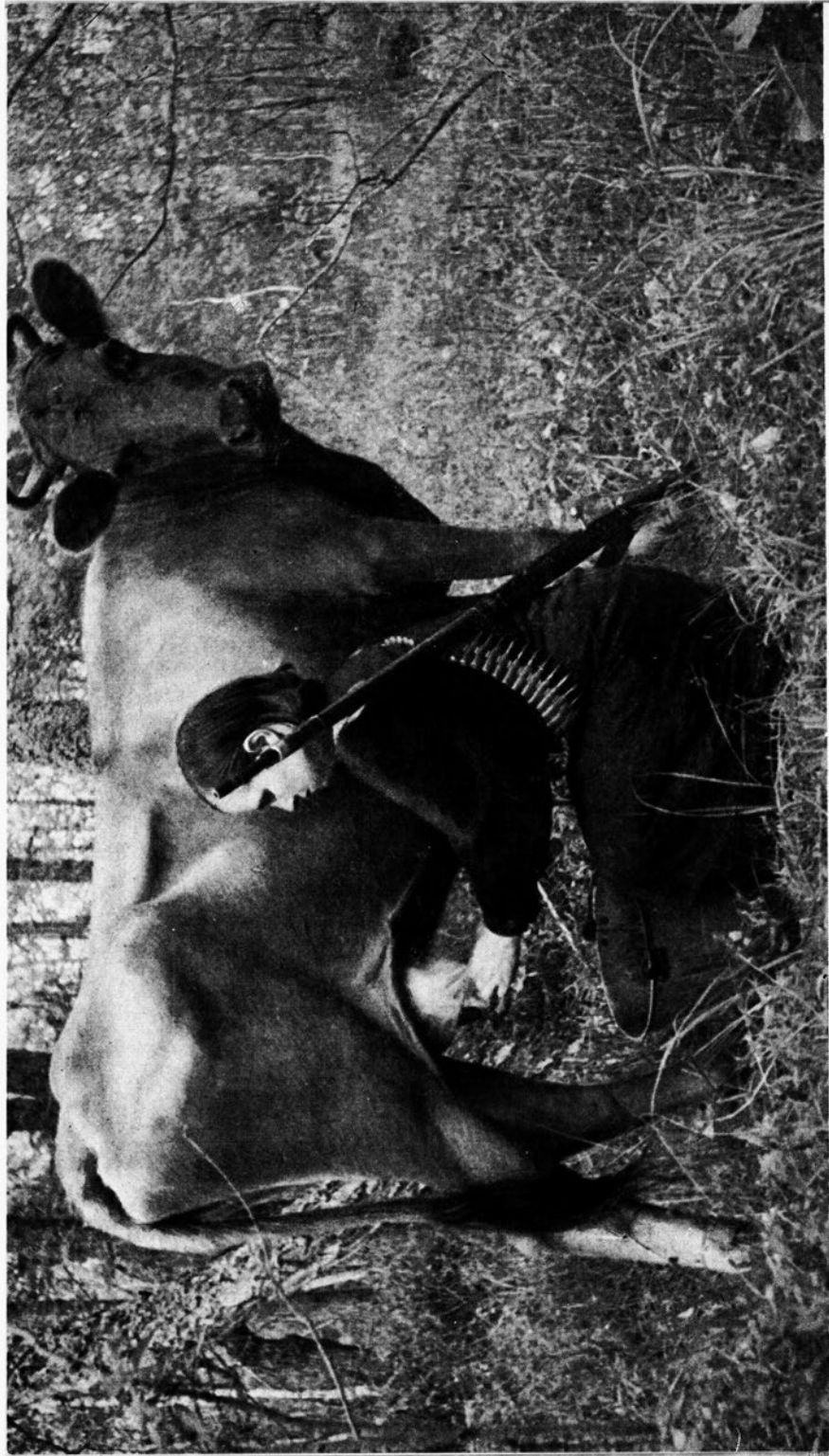
A collective farm woman with a guerrilla band deep in the woods behind the German lines, helps to provide nourishment for the wounded.