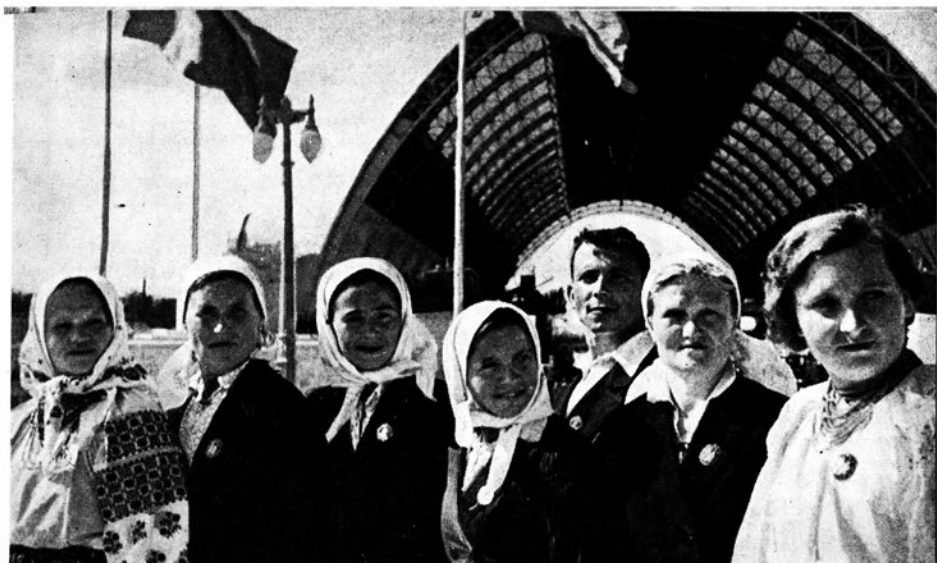
A group of collective farmers visiting the great Agricultural Exhibit in Moscow.

families in various types of producers' cooperatives numbered 195,000, which would have been regarded as an achievement by the cooperative movements of most countries; but this was less than one farming family in every hundred on the vast lands of the USSR. Outwardly they made little difference to the picture of the Russian countryside; most of the land was still farmed with primitive tools in long thin strips. The cooperatives themselves were small groups, from ten to thirty families working an average of 150 crop acres. Often their lands were still scattered in many pieces among the village fields. This was far from what Soviet leaders regarded as the urgent need of the country—a basic change-over to mechanized farming through cooperative forms.