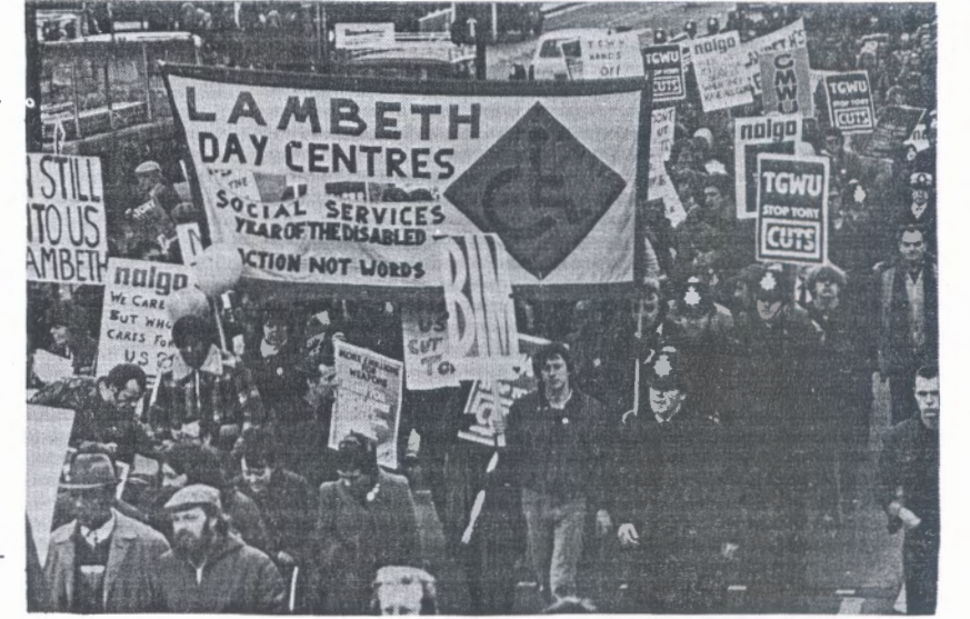
The workers of Lambeth marched last week in support of the Week of Action against the Thatcher Government's policy of destroying our local services. As with the councillors at Clay Cross, Thatcher is attempting to pick off local councils who defy her Government's dictats.

Whether supporting councils who refuse to wield the axe, or opposing those who manoeuvre to swipe against us, we are forced to make war on the government. For just one week Lambeth workers gave a graphic demonstra-tion of what Thatcher would introduce for good: the rub-bish piling up in the streets, the library doors locked and barred, colleges of education closed