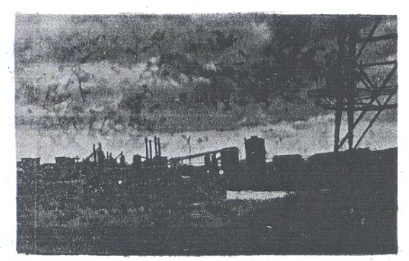
The gaunt slihouette of Normanby Steelworks in Scunthorpe, threatened with closure.

For every reason of self-interest and common humanity we must get out of the NATO alliance which is the major threat to peace in the world today. The fact that it would probably have to be over Thatcher's dead body makes leaving even more att ractive. Thatcher out Britaln out of NATO!