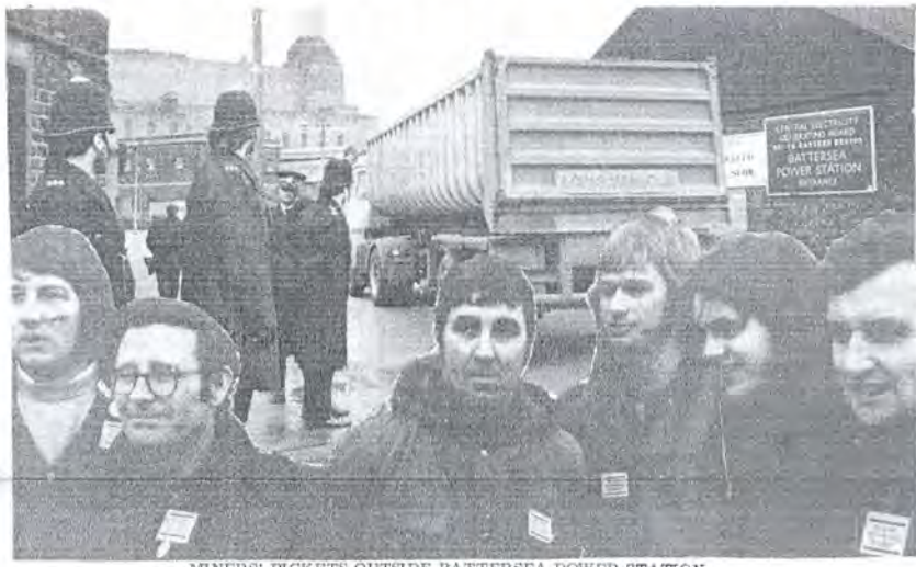
MINERS' PICKETS OUTSIDE BATTERSEA POWER STATION

This is not the only escape route the government could have used. There was the winding time and bathing time loophole. But Heath thought that his introduction of the three-day week would break the working class resistance to the freeze, would turn people against the miners, and so that loophole was closed by the ever-obedient Pay Board. But the miners stuck to their guns. They were not diverted by the election farce, They made it clear that they wanted their claim