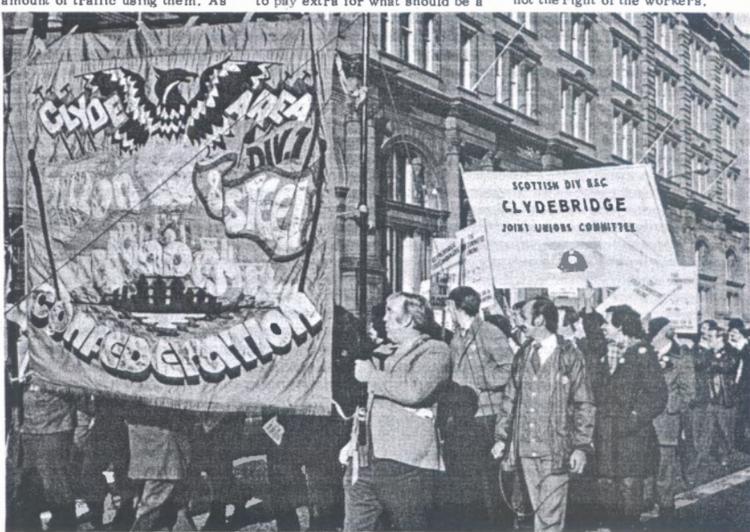
Workers from the Clydebridge steel works, under threat of closure, on the march organised by the miners, rail workers and steel workers which took place in October 1982.

Those who believe that London Transport should be subsidised by tolls on motorists entering the capital should beware: they are contributing to a climate of opinion which will bring us back to the 18th century, with money to pay at each stage of the journey, and travel the prerogative of the rich, not the right of the workers.