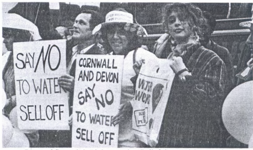
Four out of five people in Britain oppose the sell off of the water industry to private interests.

The tactics employed by NALGO throughout the dispute can only be described as exemplary. They adopted a strategy aimed at dividing the employer, increasing pressure through selective action, sparing the members of hardship and avoiding the trap of all-out indefinite strike