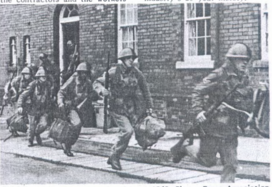
British troops enter Ireland - August 1969.

The safety aspect has been uppermost in these workers' minds especially workers' minds especially following the recent anniversary memorial to the dead of the Piper Alpha rig disaster. It has been a year of turbulence and struggle in the North Sea induct with 25 more history industry's