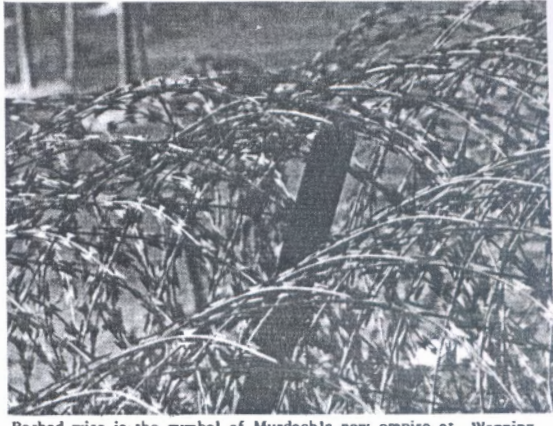
Barbed wire is the symbol of Murdoch's new empire at Wapping.

running neck and neck with the Sun, reversing years of decline by Maxwell's papers. Sales of the Sunday Mirror have also grown by 8.3%, and now top 3 million a week.