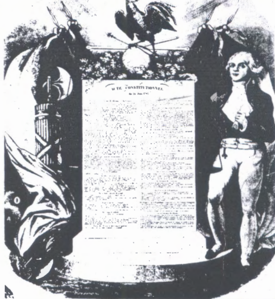
price controls, which infuriated the Gironde so concerned for its own class interests.

free men or die." Between March and September 1793, Britain signed treaties that organised belligerents against the revolutionary nation. The monarchies formed a general coalition against France. The King's execution had been only the pretext for Britain's involvement; in fact France and Britain were two nations fighting for political and economic mastery. Said Brissot to the Convention, "Now you have to fight, both on land and at ses, all the tyrants of Europe".