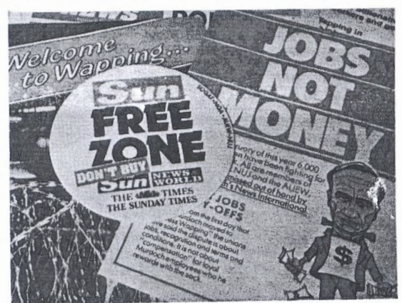
The public are urged to boycott the Sun.

compared with arch rival, the Daily Mirror. Coupled with sales of the Scottish Daily Record, Mirror sales are currently