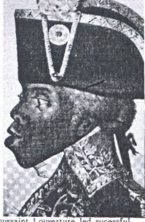
Toussaint Louverture led sucessful slave revolt in Haiti, inspired by 1789

Indeed Karl Marx would, decades later, regard The Terror as "a plebisn way of getting rid of the enemies of the bourgeois, absolutism and feudalism". The battle between the Gironde and Montagnards grew venomous inside the Convention and without. Centre forces around the Marais(the Marsh or Plain) accepted the wartime concessions to the masses and followed the lead of the Montagnards when they moved against the King.