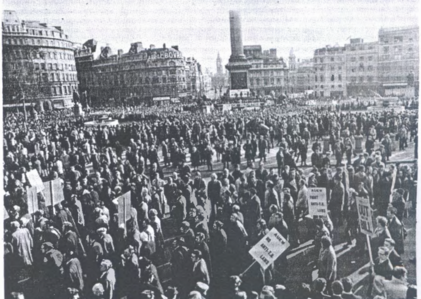
e rally in 1971 protesting at anti-trade union laws

There is no doubt that, just as the clarity of the unions on