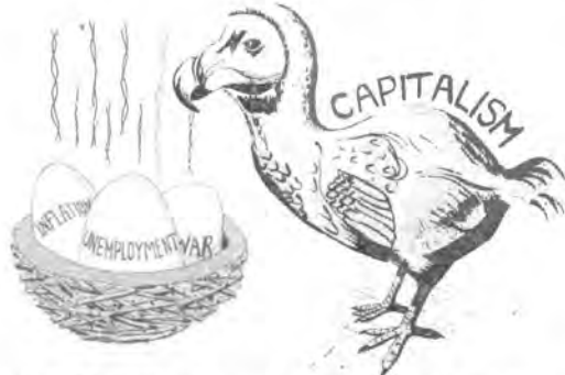
A BIRD THAT LAYS SUCH ROTTEH EGGS IS LONG OVERDUE FOR EXTINCTION

"The strike in June-July of this year at the no. 20 textile factory in Shahi, North Iran, which lasted some three weeks, was finally surrounded and attacked by 1200 armed soldiers brought in from a nearby town. The workers resisted, delying machine-gun fire. Sixteen workers were martyred and over seventy injured."