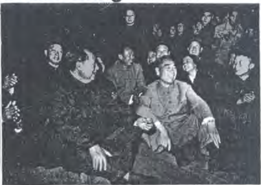
Comrades of the Long March, Mao Tsetung and Chou En-lat, elabrating a national occasion in Peking

The Secretariat of the Central Committee of the Communist Party of Britain (Marxist-Leninist) sends its warmest fraternal greetings to th Central Committee of the Communist Party of China on the occasion of the twentysixth anniversary of the founding of the Peoples Republic of