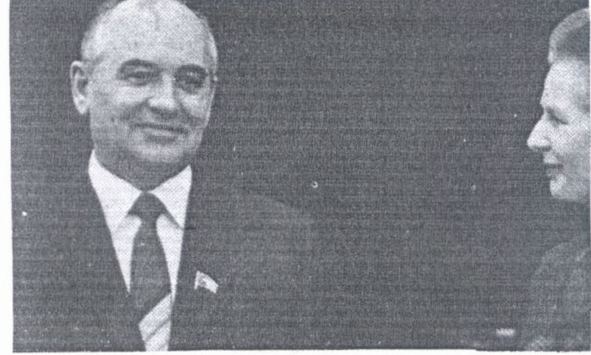
Marginalised: Gorbachev's visit showed up just what a nonentity Thatcher is

of higher interest won't go away; inflation continues; the CBI broke ranks and pleaded with Parkinson not to include the nuclear stations in the electricity sell-off; and the campaign against water privati-sation gathered steam in preparation for the mass lobby and rally in Westminster this