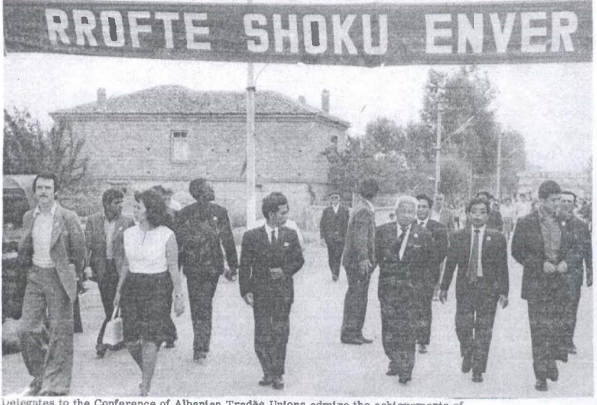
gates to the Conference of Albanian Trades Unions admire the achievements of socialism in Albania. The banner reads Long Live Comrade Enver.

"Europe, too, must and will pass through the proletarian revolution. Whoever loses sight of this perspective, whoever fails to make preparations towards this end, but advocates that the revolution has moved to Asia and Africa and that the European proletariat must join its own 'wise and good bourgeoisle' on the pretext of defending national independence, he is in an anti-Leninist position and and is for neither the defence of the homeland nor the freedom of the nation. Whoever 'forgets' that both the Warsaw treaty and NATO must be combatted, that both the Comecon and the Common Market must be rejected. takes their side and becomes their slave.