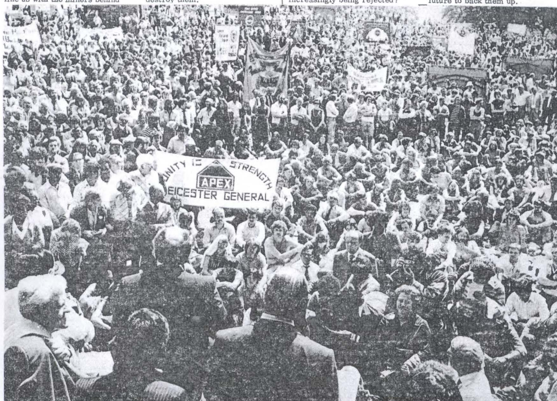
Part of the mass meeting at Roundwood Park, London, in support of the Grunwick strike.

The task now is to translate and elevate the mass support for the Grunwick strike into industrial action. So far the Post Office workers are bearing the brunt of such solidarity action. The Cricklewood postal workers are defying the law and the management lock-out by refusing to handle Grunwick mail. They have no illusion on where the law stands and to where their solidarity belongs. Their example has already been followed by other Postal workers.