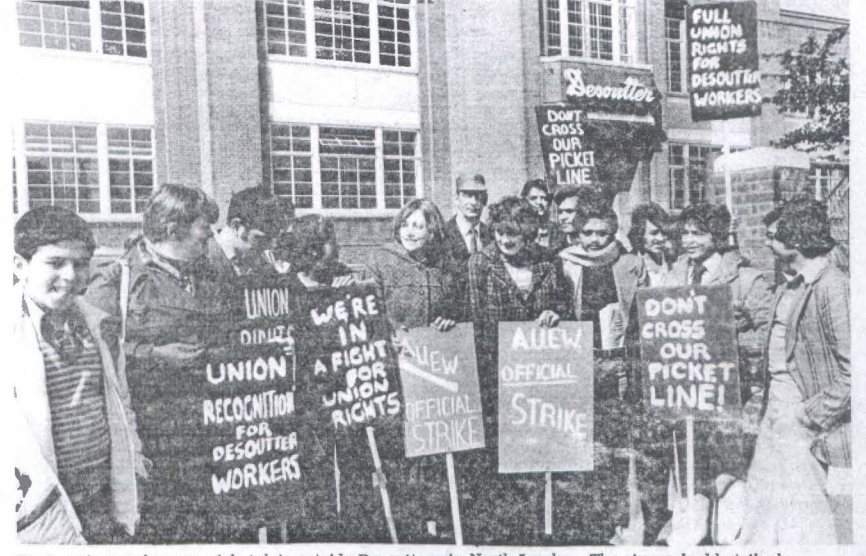
Engineering workers on picket duty outside Desoutters in North London. The six week old strike by toolmakers is for the recognition of the AUEW.

In the face of Government acceptance, the unions must take up the fight to protect this vital part of our industrial future. Our resistance must be based on opposition to Holland's premier assumption, that the young are a problem and that they are surplus to requirements. If the ruling class no longer offers a future to our children, we must no longer offer a future to the ruling class.