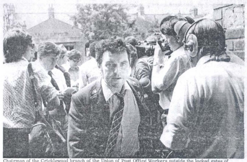
Chairman of the Cricklewood branch of the Union of Post Office Workers outside the locked gates of Cricklewood sorting office.

Our Programme of National Recovery: Cot Rid of Capitalism!