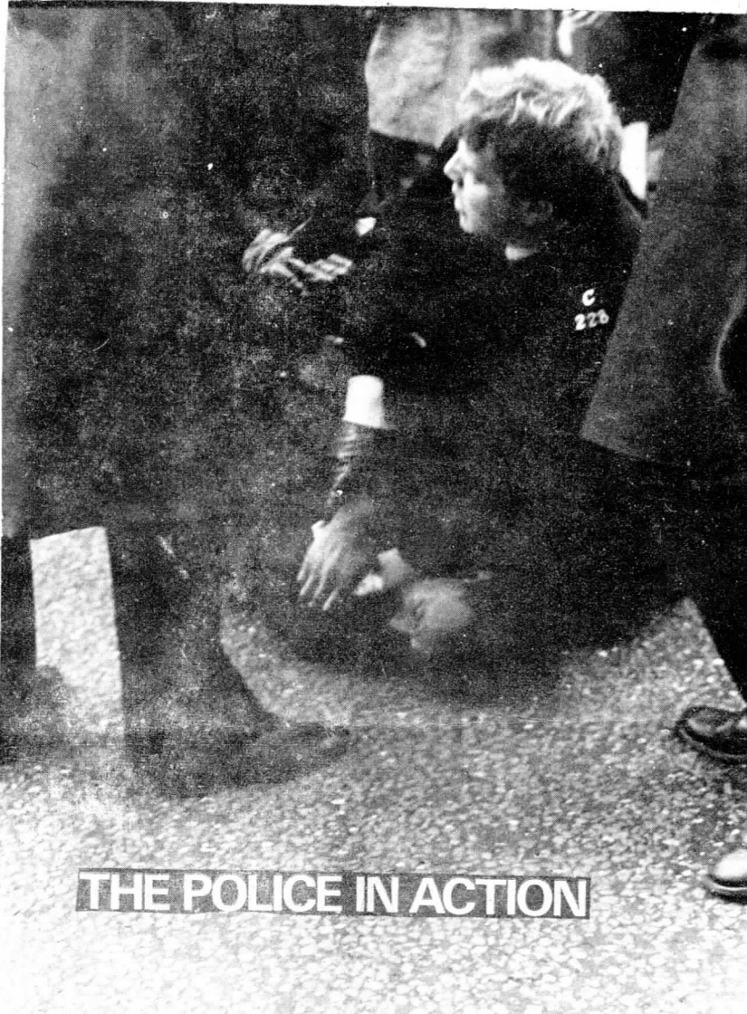
THE POLICE IN ACTION

These cover-ups just will not do. We demand a public enquiry into the racist and brutal behaviour of the police. Why don't they accept a public enquiry? What have they to hide ?