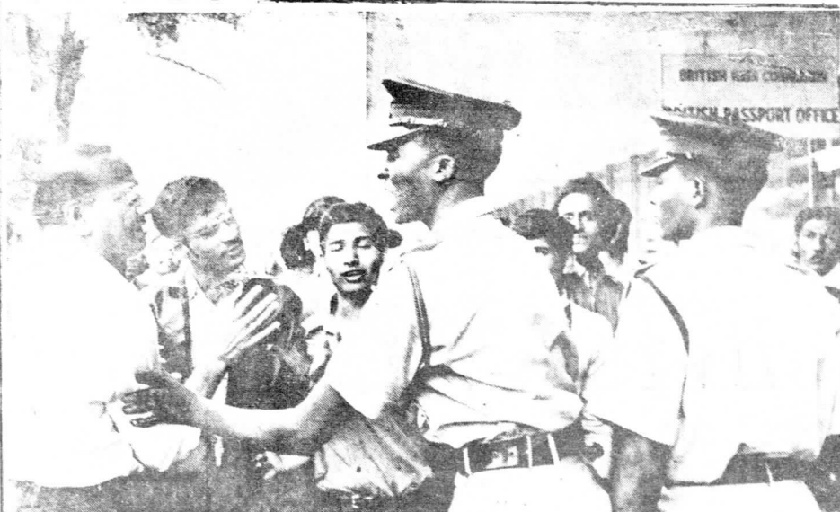
Asians holding British passports demonstrating outside the British High Commission in Nairobi. They were protesting against delay in issuing entry vouchers for the United Kingdom. Many of them have been in the queue for two years