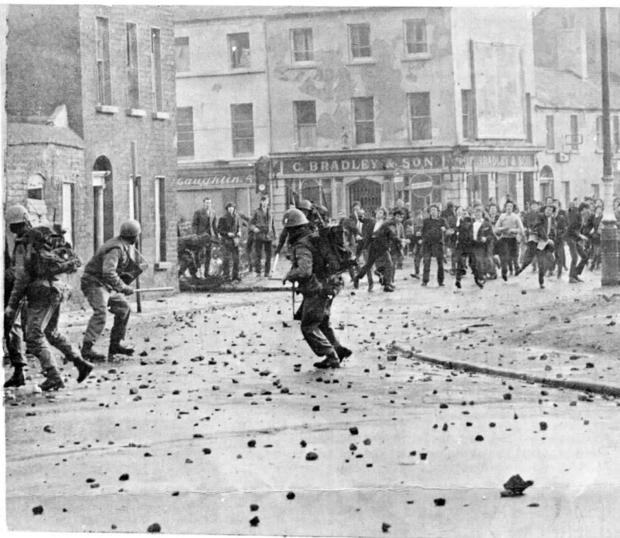
Three blind mice ... Three blind mice ... See how they run, There is no power on earth that is more powerful than the people !

British imperialism faces deep contradictions in Ireland. And, unable to extricate itself from its mess, it fosters religious bigotry in order to 'divide and rule' the Irish workers and direct their attention away from the enemy. British imperialism claim that the present war is a 'religious war' between Catholics and Protestants. But is it? From the 12th century till now, British colonialism and modern imperialism have been deceiving and lying to the world about its atrocities against the Irish people. Now it claims that the Irish liberation struggle is a war of different religious sects. But the Irish people since 1916 have been better able to see through these lies and tricks.