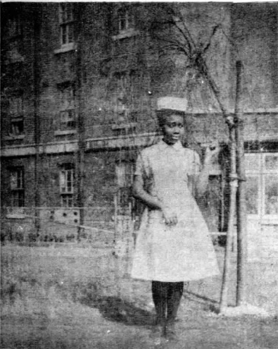
ATTITUDE OF PATIENTS AND THEIR RELATIVES.

Can monkeys care for the sick? Yes! The Black ones. Asked a white patient what he thought of Black people, he replied, "Tell you the truth, I don't too like coloured folks but you are alright, I like you." Words like these are said to Black nurses daily but they have such a mental block and are so addicted to flattery that they feel special when a white man tells them that the only reason why he speaks to them is because his life is partly in their hands. The number of Black nurses and midwives in British hospitals is estimated to be some 35-40 per cent at the end of 1969. Therefore, it is obvious that most white patients will have been cared for by Black nurses and midwives during their stay in and out of hospital.