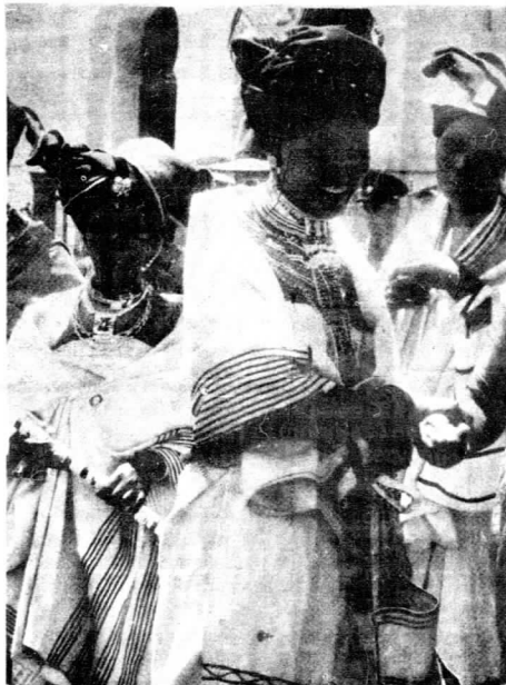
WINNIE MANDELA CENTRE OF PICTURE

Mrs. Winnie Mandela wife of Nelson Mandela, leader of the banned African National Congress, (A.N.C.) now serving life imprisonment on Robben Island, near Cape Town in the racist, fascist, police-state of South Africa, was charged with 21 others on October 28th, 1969, under the Suppression of Communism Act. The charges, arising out of the activities of the A.N.C. against the genocidal fascist regime of Voster, refers to Nelson Mandela, Oliver Tambo and others during the period of October, 1967 to June, 1969, in Johannesburg, Durban, Cradock, Port Elizabeth, Umtata and other places.