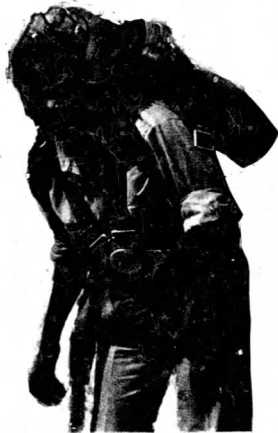
Congolese woman paratrooper.

***** "we and our children must not die natural deaths because we are slaves. we must die fighting for our freedom rather than produce another generation of slaves" *****