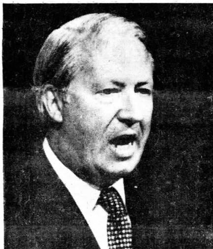
HEATH addressing the UN General Assembly

This lying imperialist lackey knows that the South African masses will revolt as certainly as night follows day. This is the real threat to Britain's £1,000 million invested in Southern Africa.