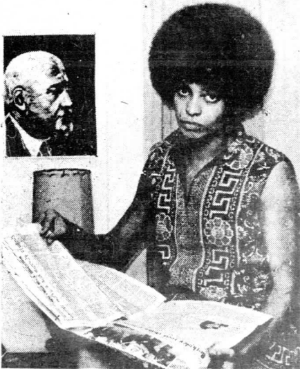
Angela Davis (right),

If even the guns belong to Angela Davis, the question we would ask is why did this black woman, in her position, had to buy guns for self-protection, for this we know that she was threatened several times and had to go out in the company of bodyguards, of which Jonathan Jackson was one.