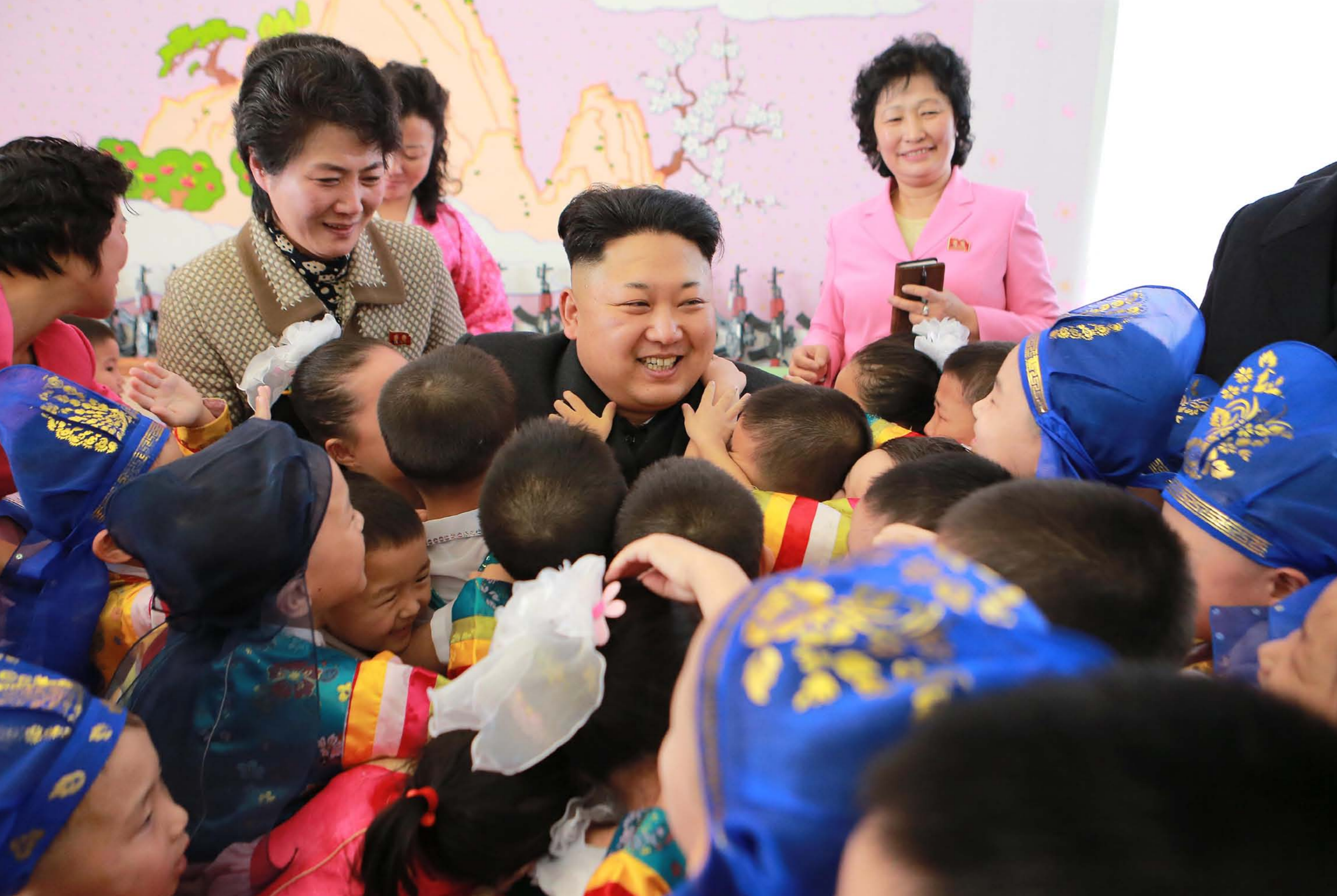
Kim Jong Un visiting the Pyongyang Baby Home and Pyongyang Orphanage to bless the orphans greeting the New Year in January Juche 104 (2015)