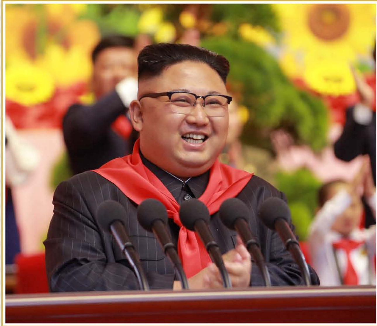
Kim Jong Un attending the Eighth Congress of the Korean Children's Union in June Juche 106 (2017)