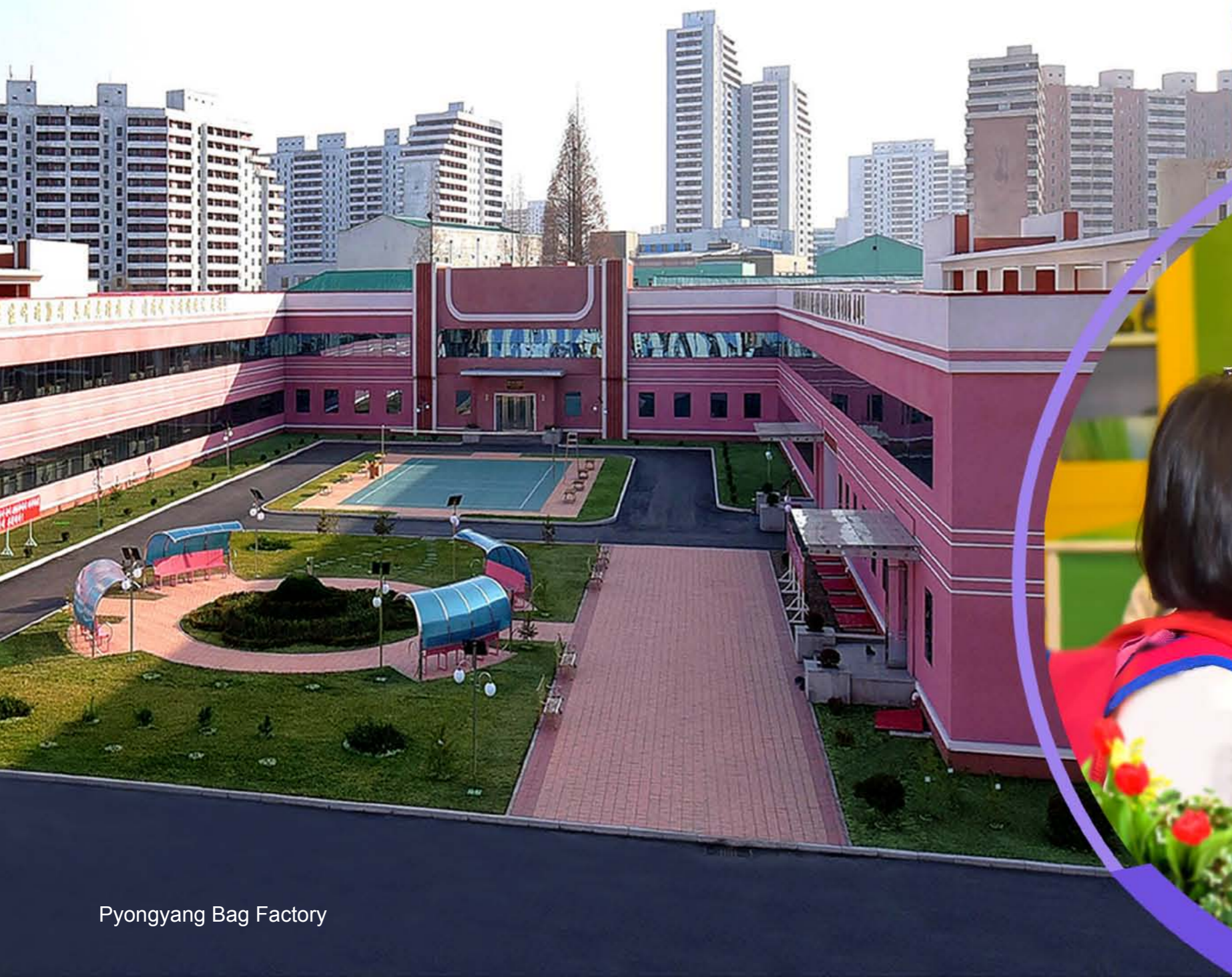
Pyongyang Bag Factory