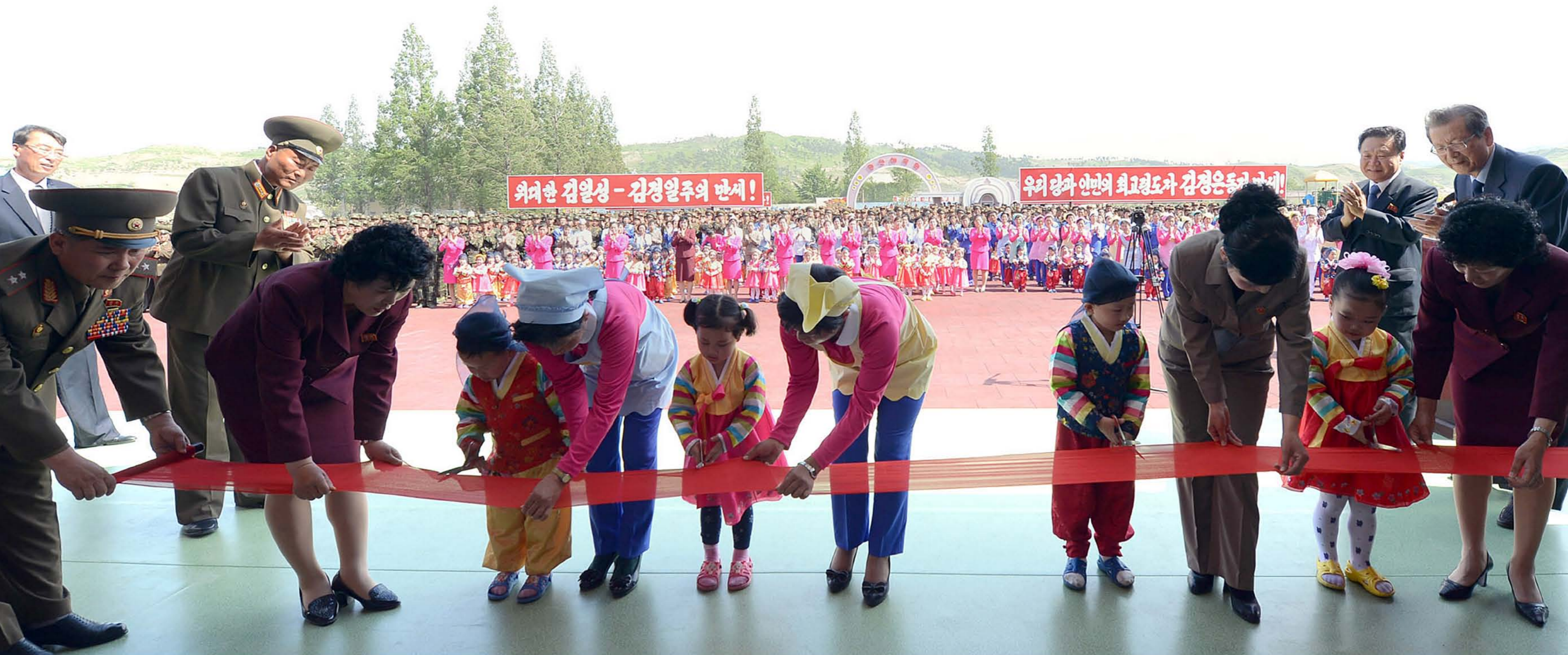
Orphans cutting the tape at the inauguration ceremony of the Wonsan Baby Home and Wonsan Orphanage in June Juche 104 (2015)