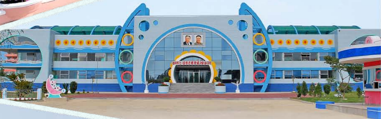
Phyongsong Baby Home