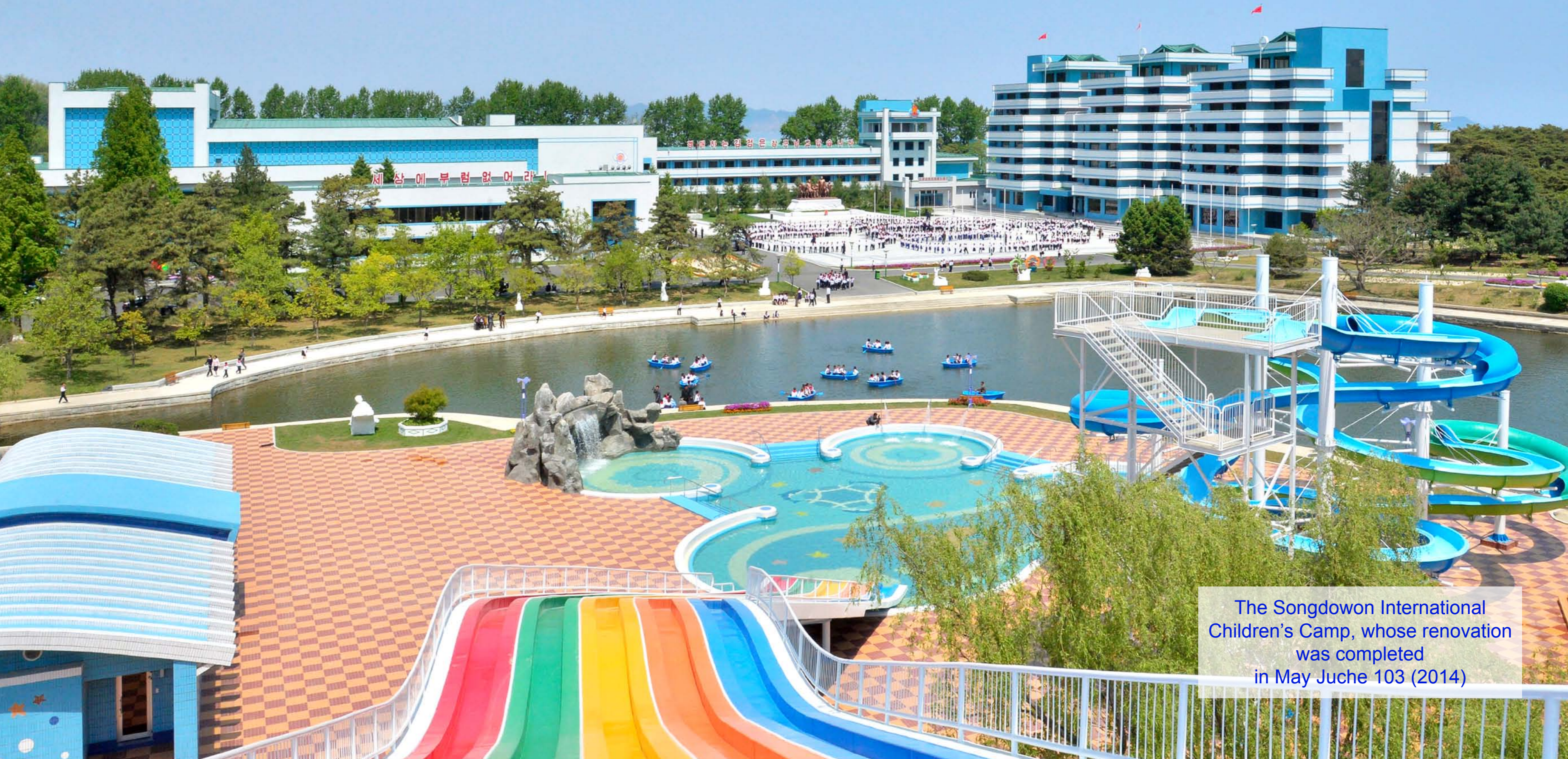
The Songdowon International Children's Camp, whose renovation was completed in May Juche 103 (2014)

To Provide Excellent Bases for Extracurricular Education