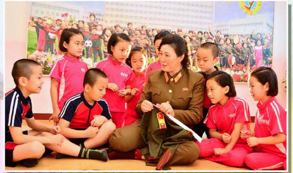
Students of Kang Pan Sok Revolutionary School