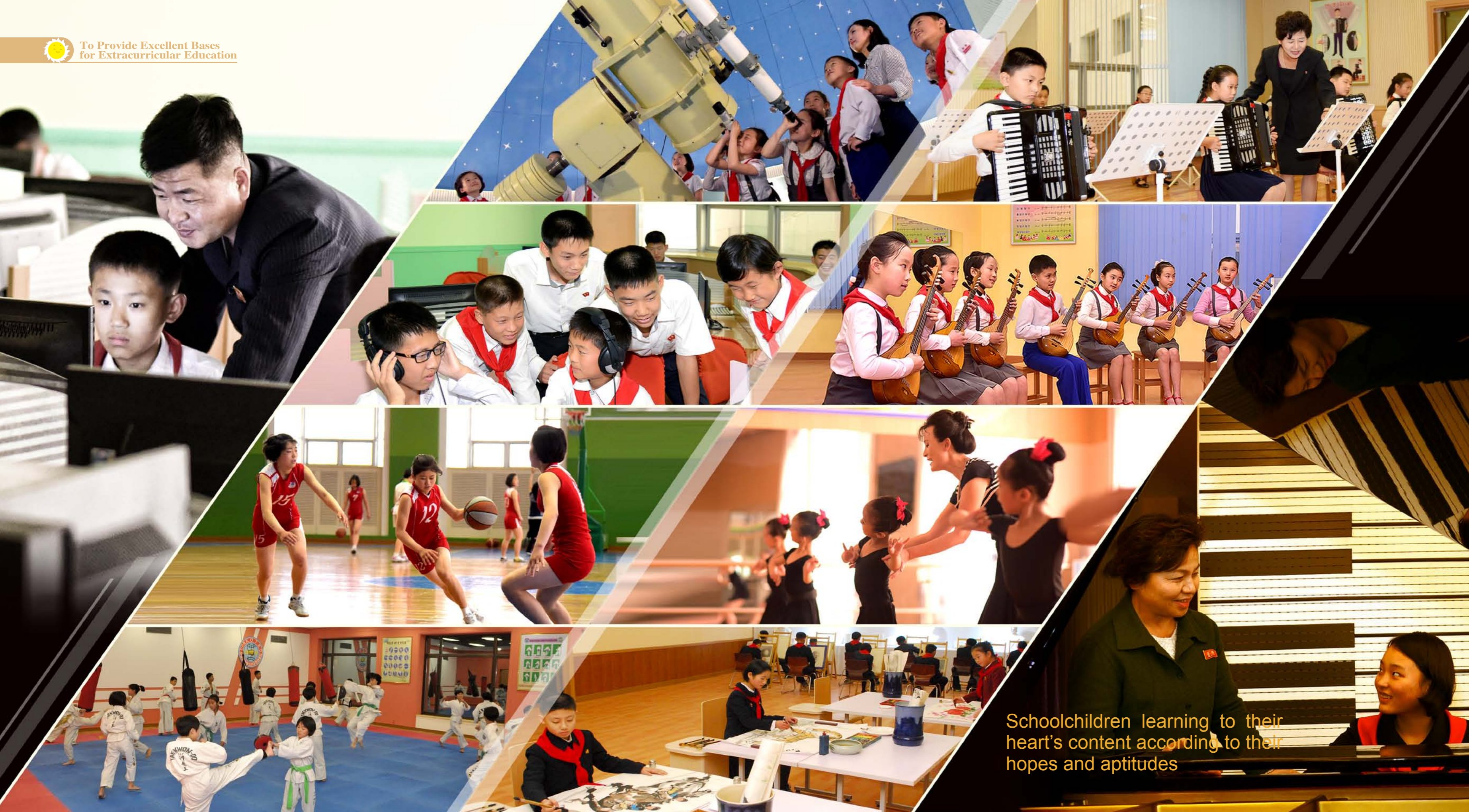
Schoolchildren learning to their heart's content according to their hopes and aptitudes