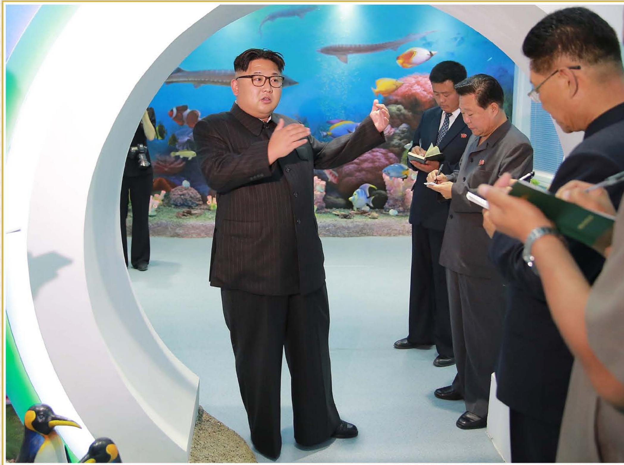
Kim Jong Un looking round the renovated Mangyongdae Children's Camp in June Juche 105 (2016)