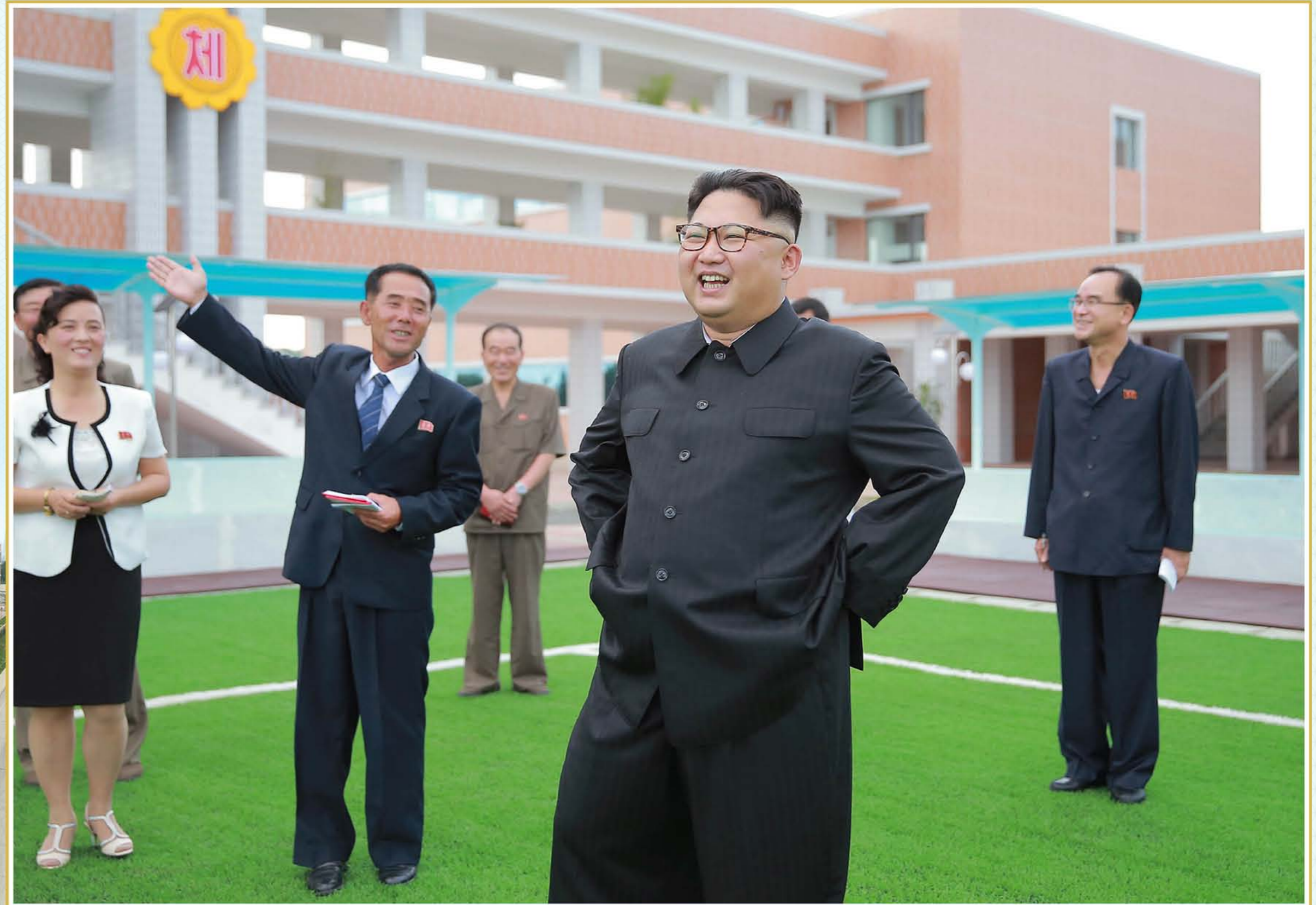
Kim Jong Un visiting the newly-built Pyongyang Middle School for Orphans in July Juche 105 (2016)