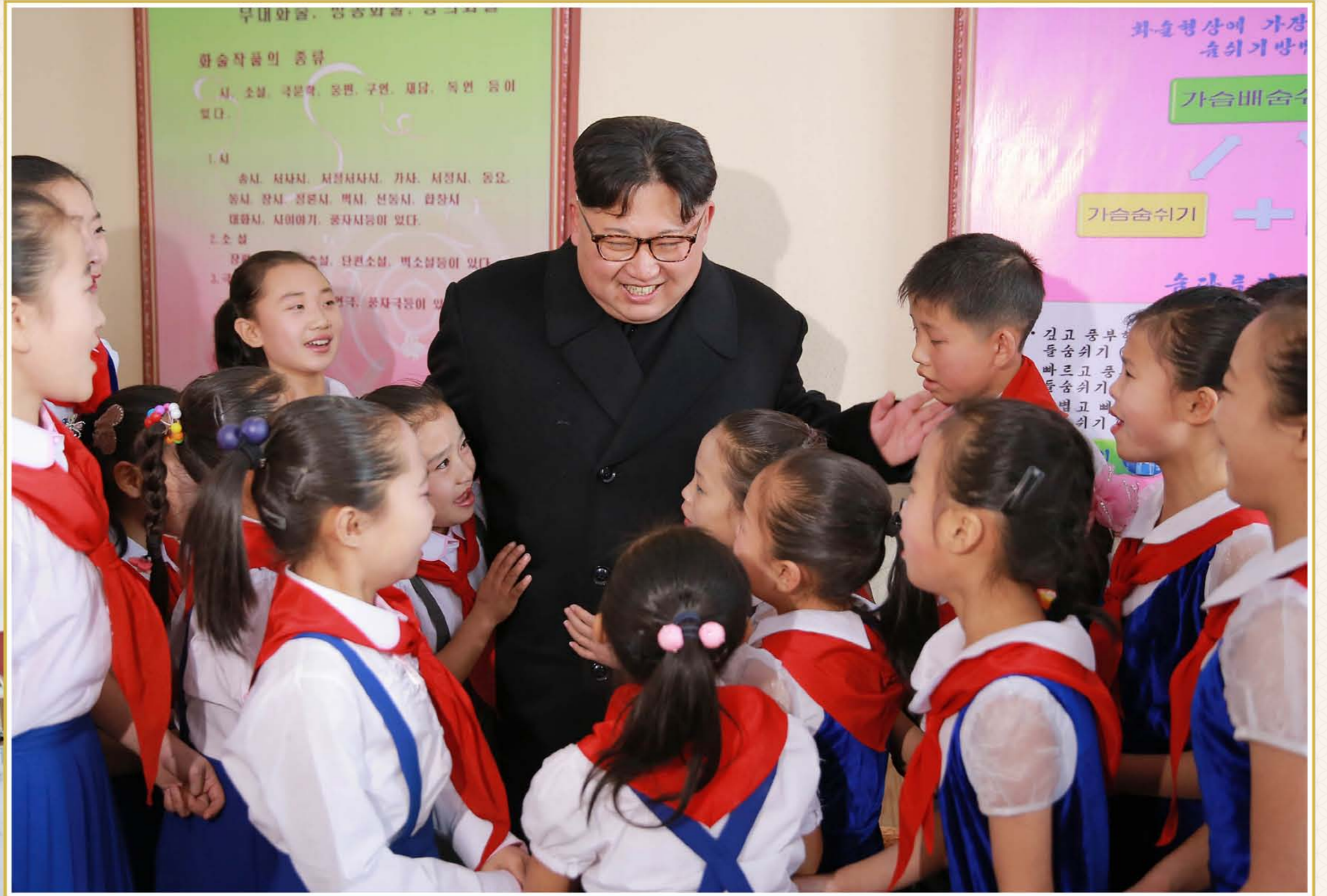
Kim Jong Un visiting the Samjiyon Schoolchildren's Palace in November Juche 105 (2016)