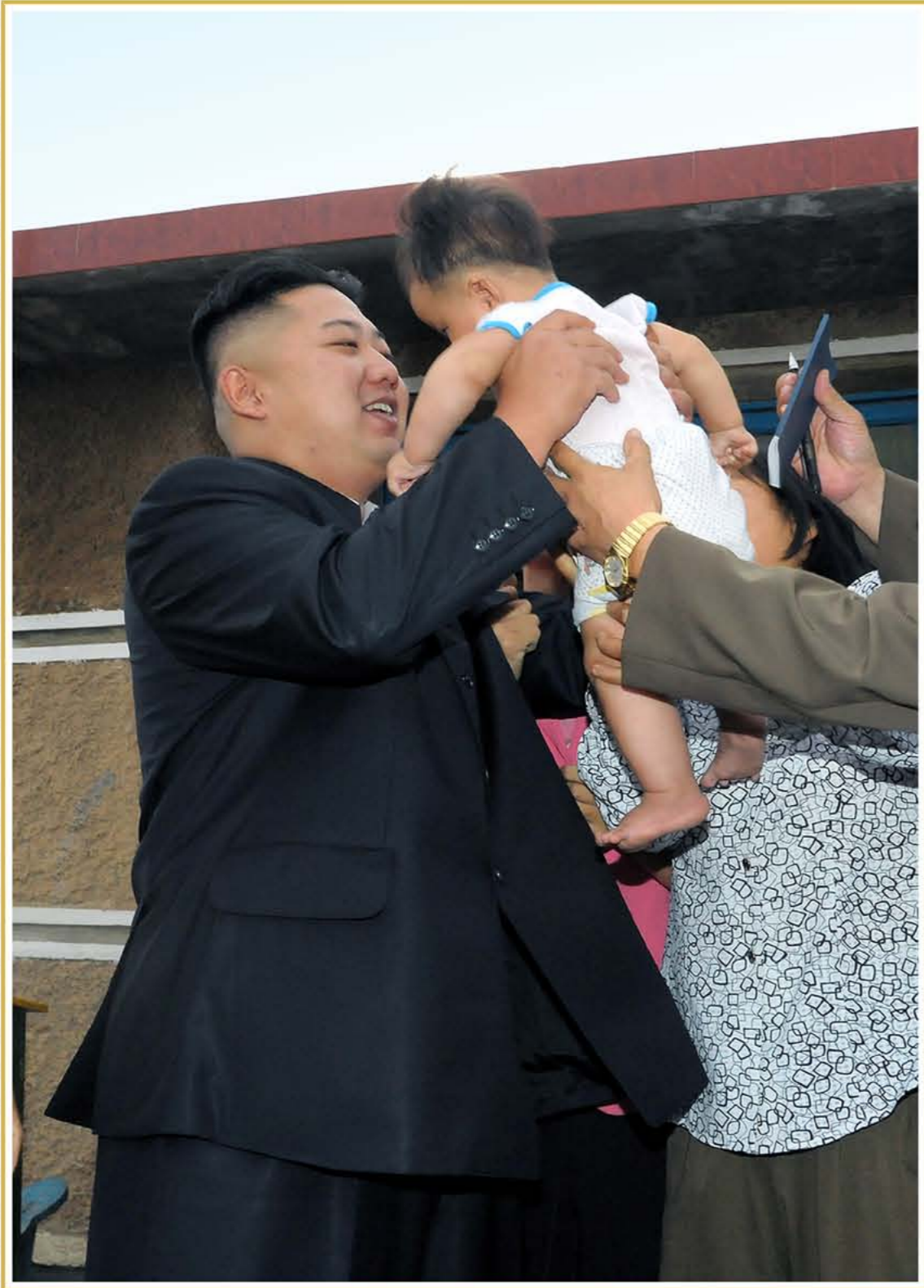
Kim Jong Un holding in his arms the son of a military officer during his inspection of an island-defending unit in August Juche 101 (2012)