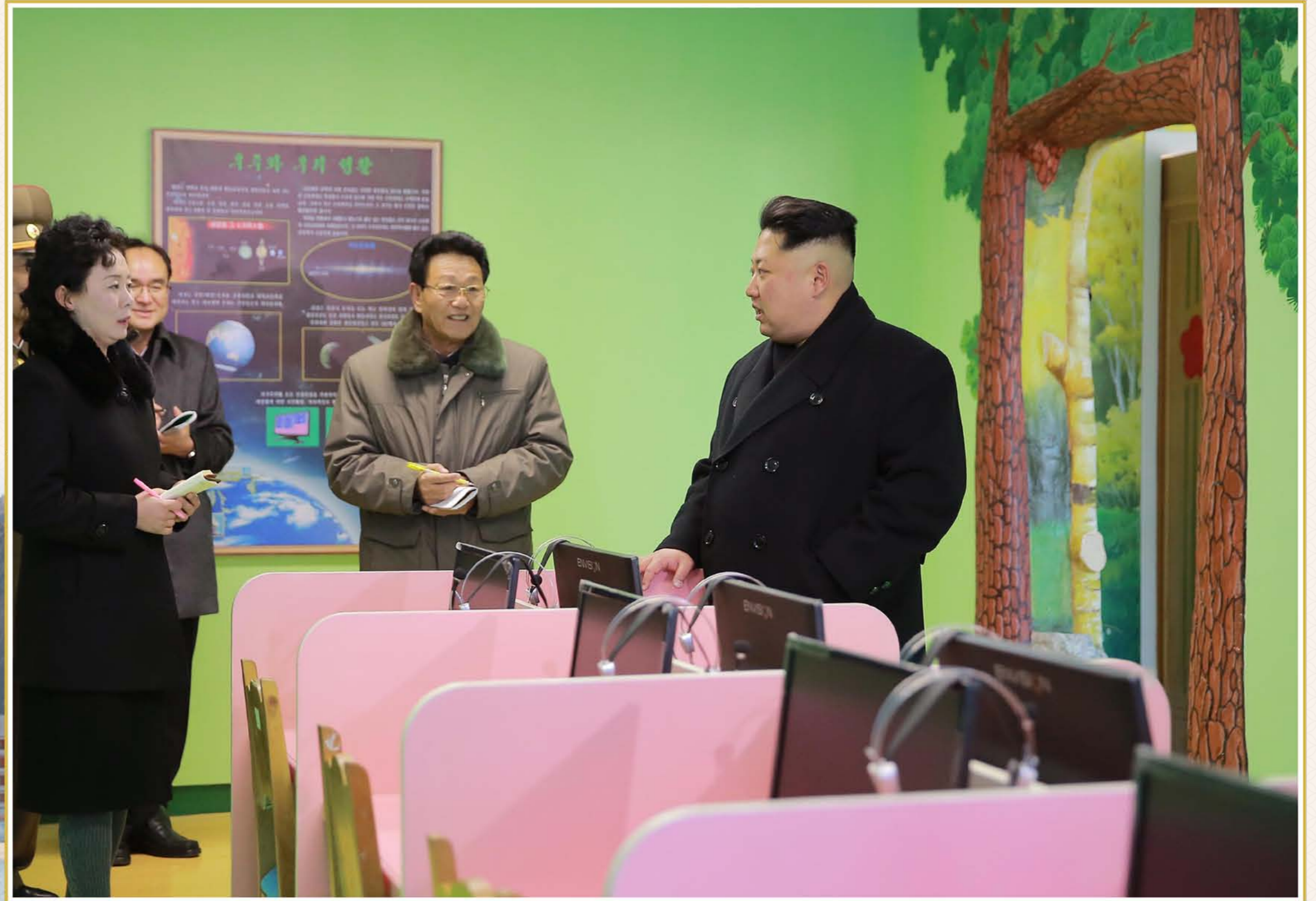
Kim Jong Un looking round the renovated December 6 Children's Camp in Kangwon Province in December Juche 105 (2016)

Having given guidance to its renovation plan and resolved all the problems arising in the project, Kim Jong Un visited the renovated camp, and told the officials that, always mindful of the fact that the whole country becomes bright when the children laugh brightly, they should perform their missions properly.