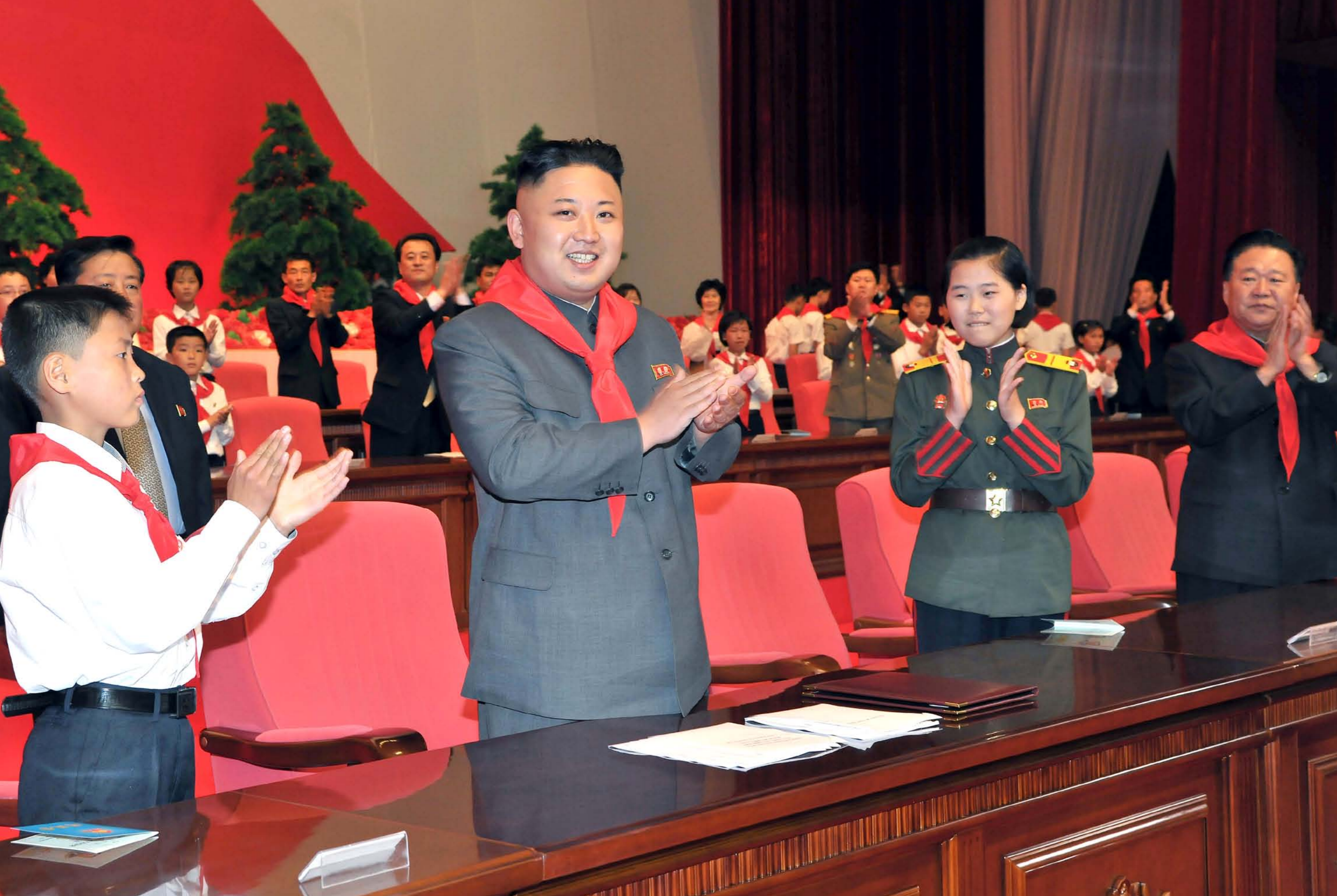
Kim Jong Un attending the Seventh Congress of the Korean Children's Union in June Juche 102 (2013)