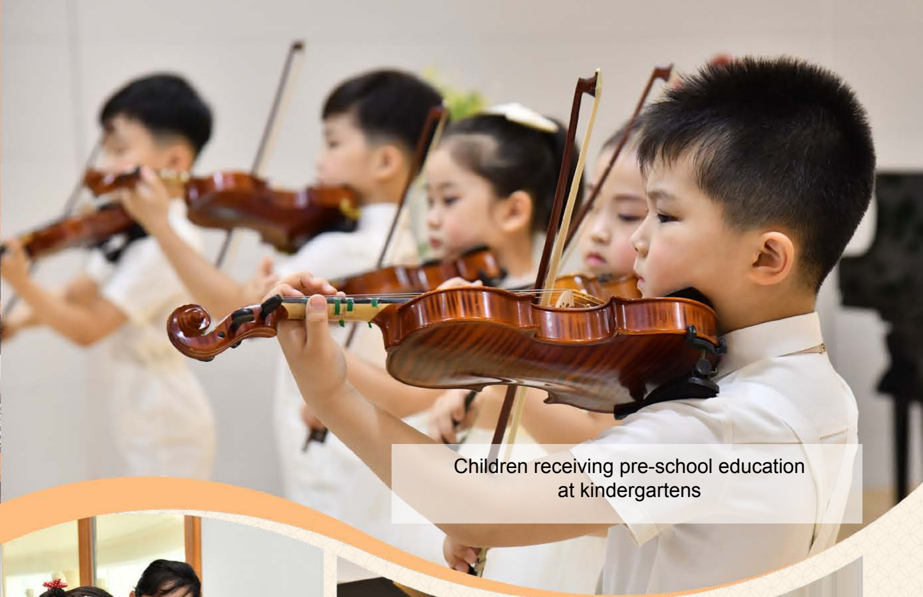
Children receiving pre-school education at kindergartens