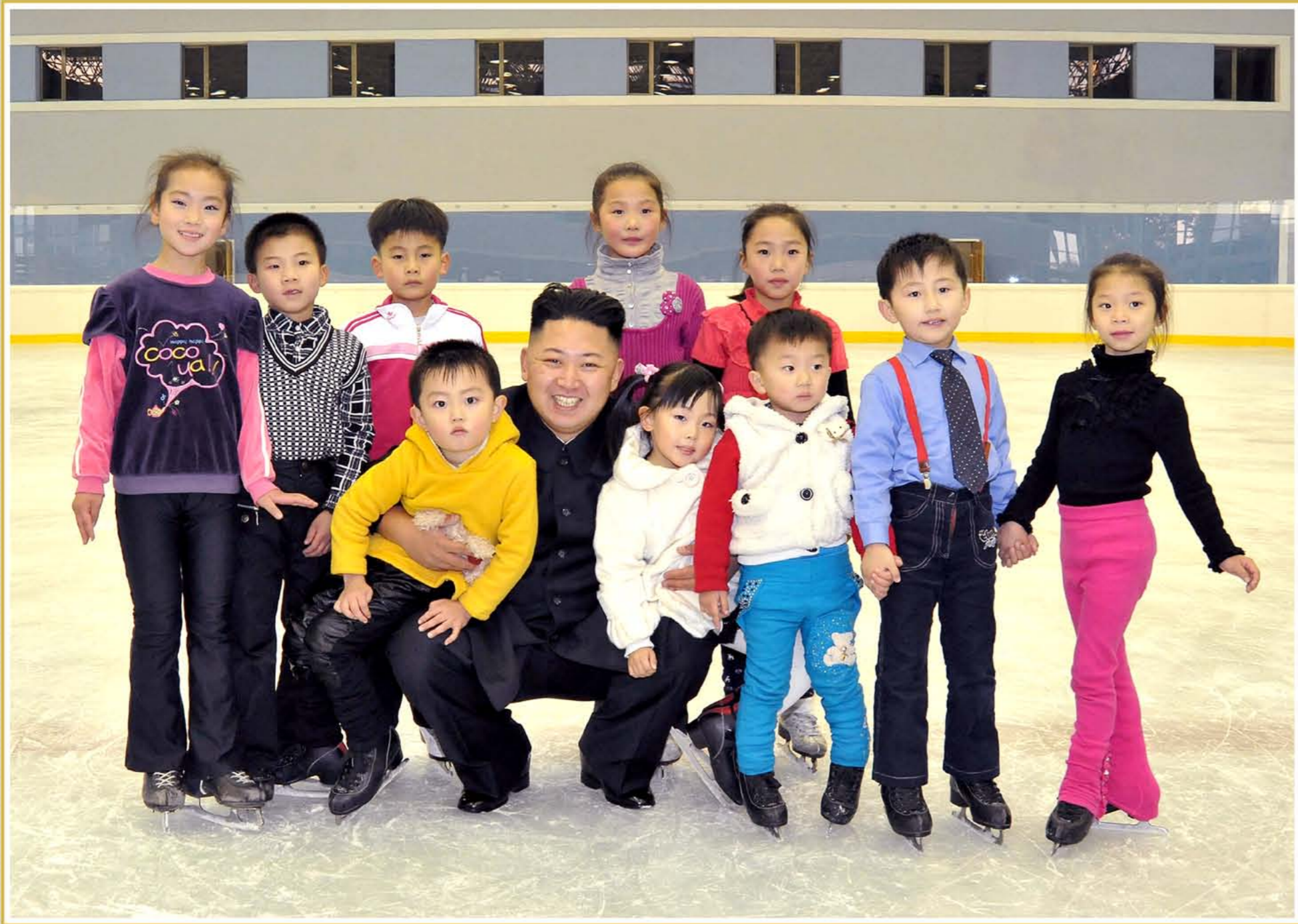
Kim Jong Un among children in November Juche 101 (2012)