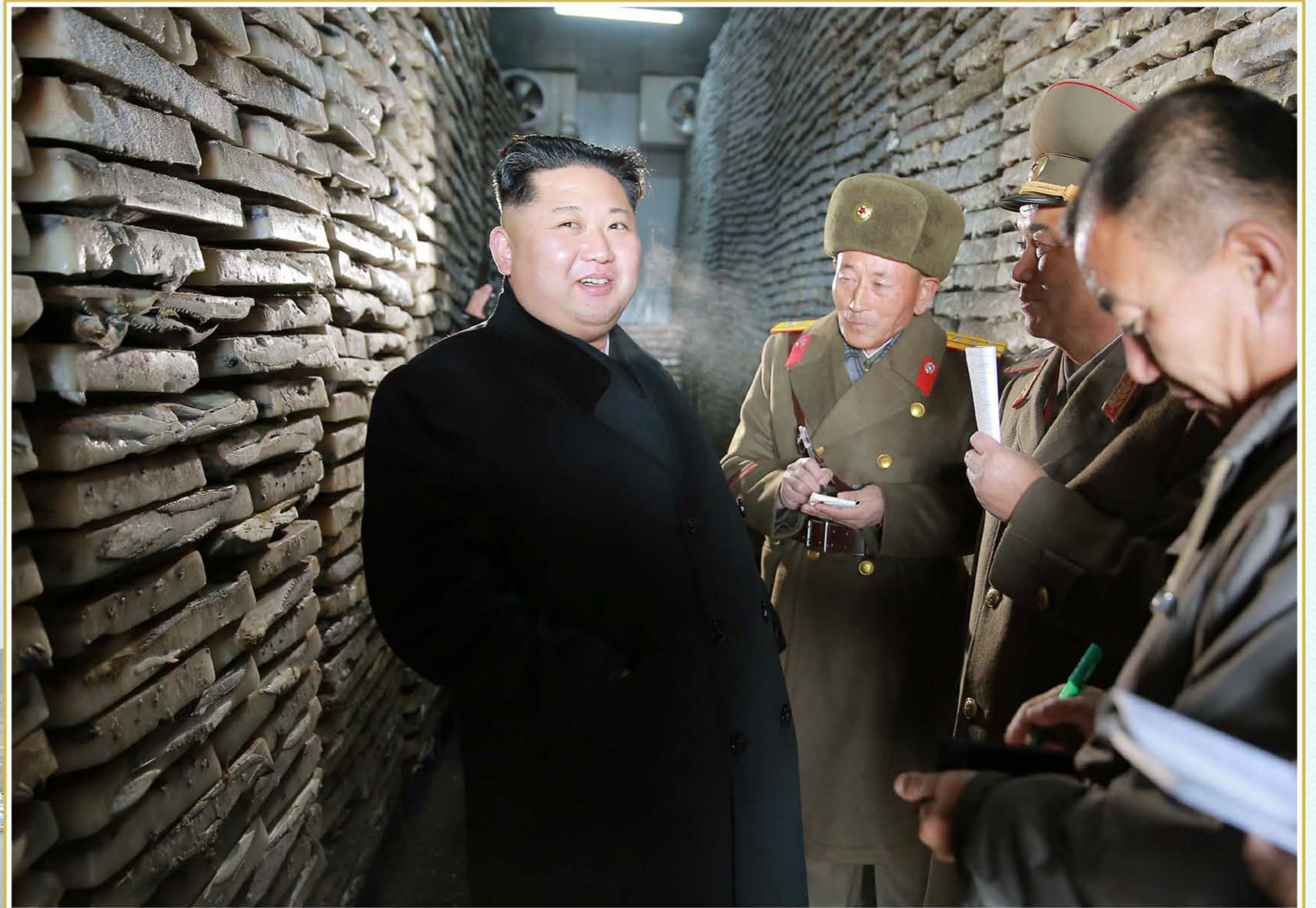
Kim Jong Un visiting the January 8 Fishery Station in November Juche 105 (2016)