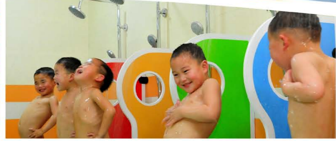
Orphanages in Pyongyang and provinces take good care of triplets as well as parentless children at state expense.