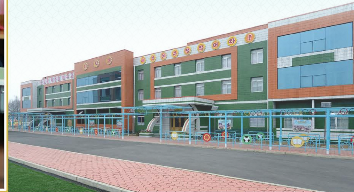
Kim Jong Un visiting the newly-built Pyongyang Primary School for Orphans in February Juche 106 (2017)