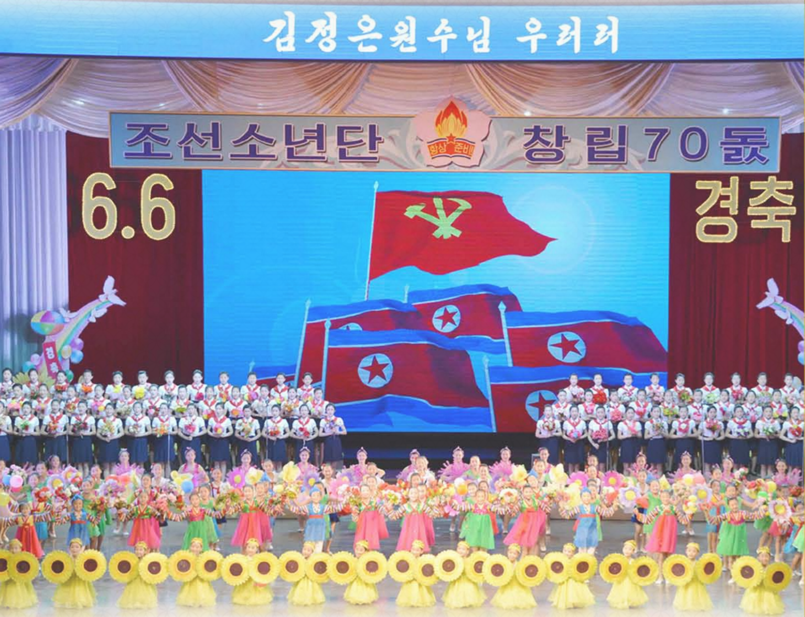
Kim Jong Un enjoying an artistic performance with delegates to the celebrations of the 70 th founding anniversary of the Korean Children's Union in June Juche 105 (2016)