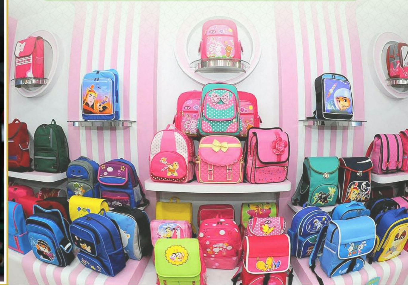
Kim Jong Un giving field guidance at the Pyongyang Bag Factory in January Juche 106 (2017)

In January Juche 106 (2017) he visited the factory. Looking round it, he advised the producers to make quality bags of various colours and shapes suited to the tastes and aesthetic sense of students and children. Visualizing children who would be happy to have new knapsacks, he pleasantly said he was reluctant to leave the factory.