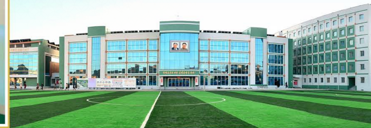
Kim Jong Un visiting renovated Pyongyang Teachers Training College in January Juche 107 (2018)

Kim Jong Un ensured that Pyongyang Teachers Training College, a “pedigree farm” for training teachers, was renovated. Visiting the renovated college, he said that pillars that could reliably shoulder the future of the country are produced from among the students taught by highly qualified teachers, stressing that the teaching staff of the college should devote pure conscience to their work.