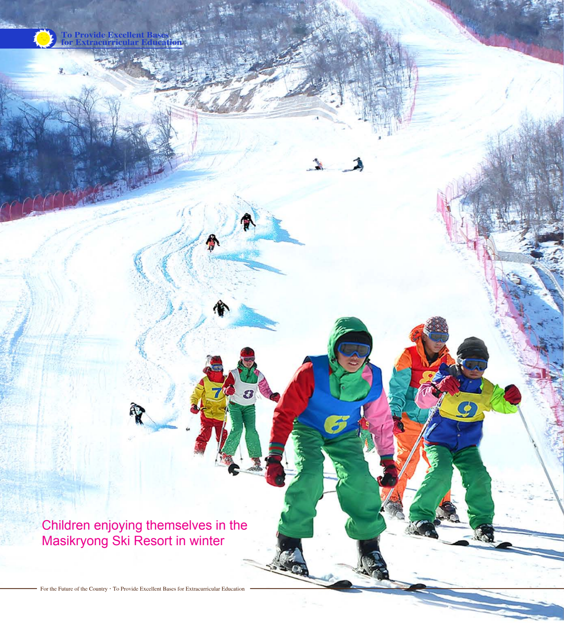
Children enjoying themselves in the Masikryong Ski Resort in winter