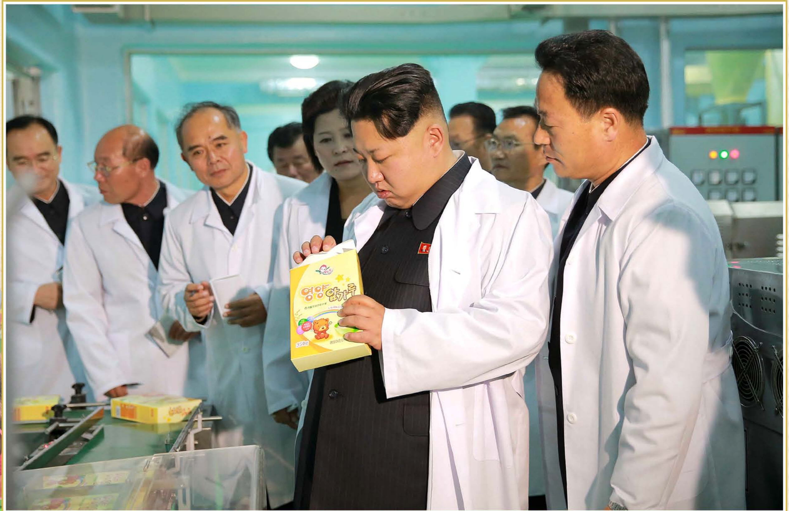
Kim Jong Un giving on-site guidance at the Pyongyang Children's Foodstuff Factory in November Juche 104 (2015)