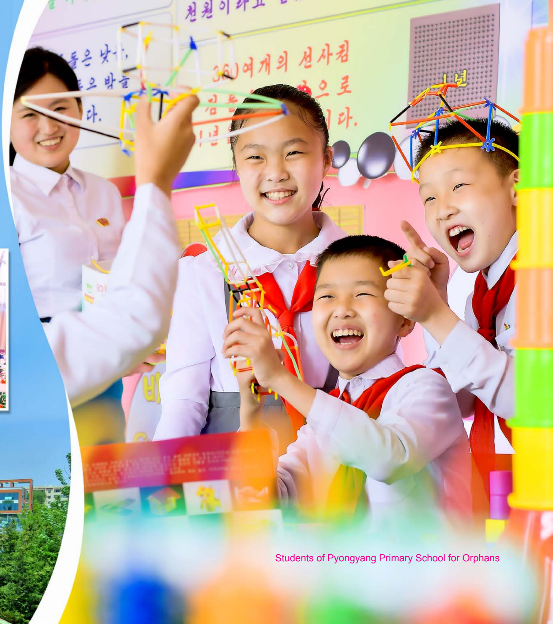
Students of Pyongyang Primary School for Orphans