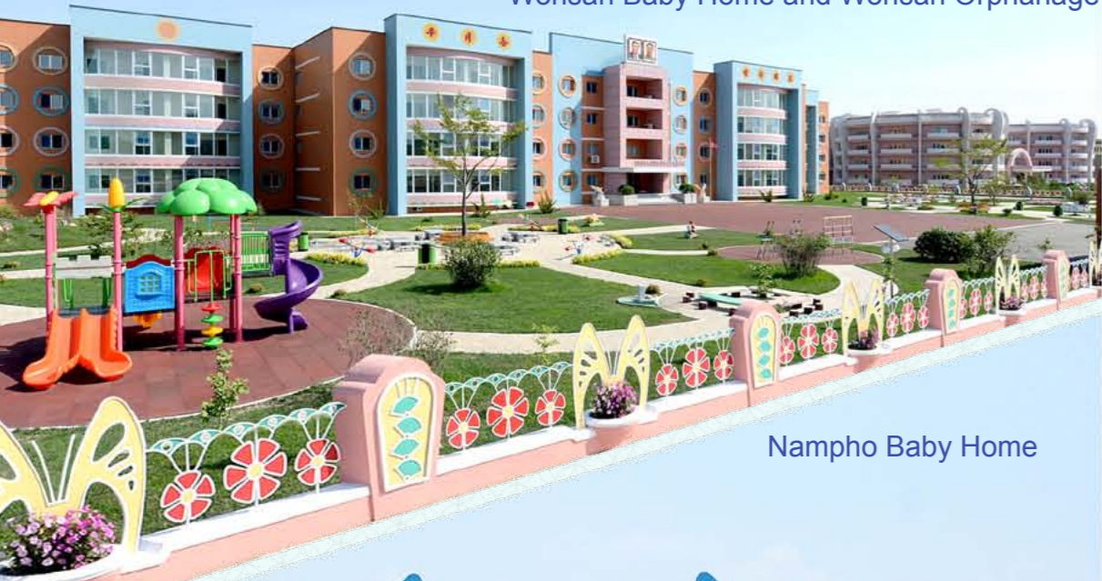
Nampho Baby Home