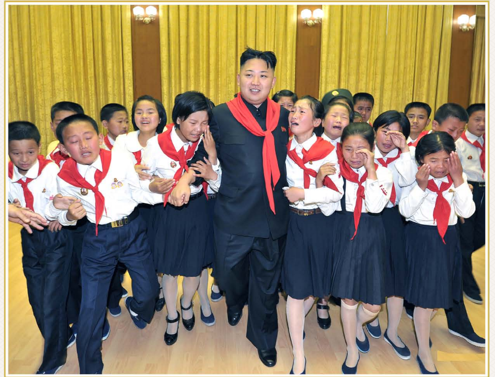
Kim Jong Un meeting delegates to the celebrations of the 66 th founding anniversary of the Korean Children's Union and blessing their future in June Juche 101 (2012)