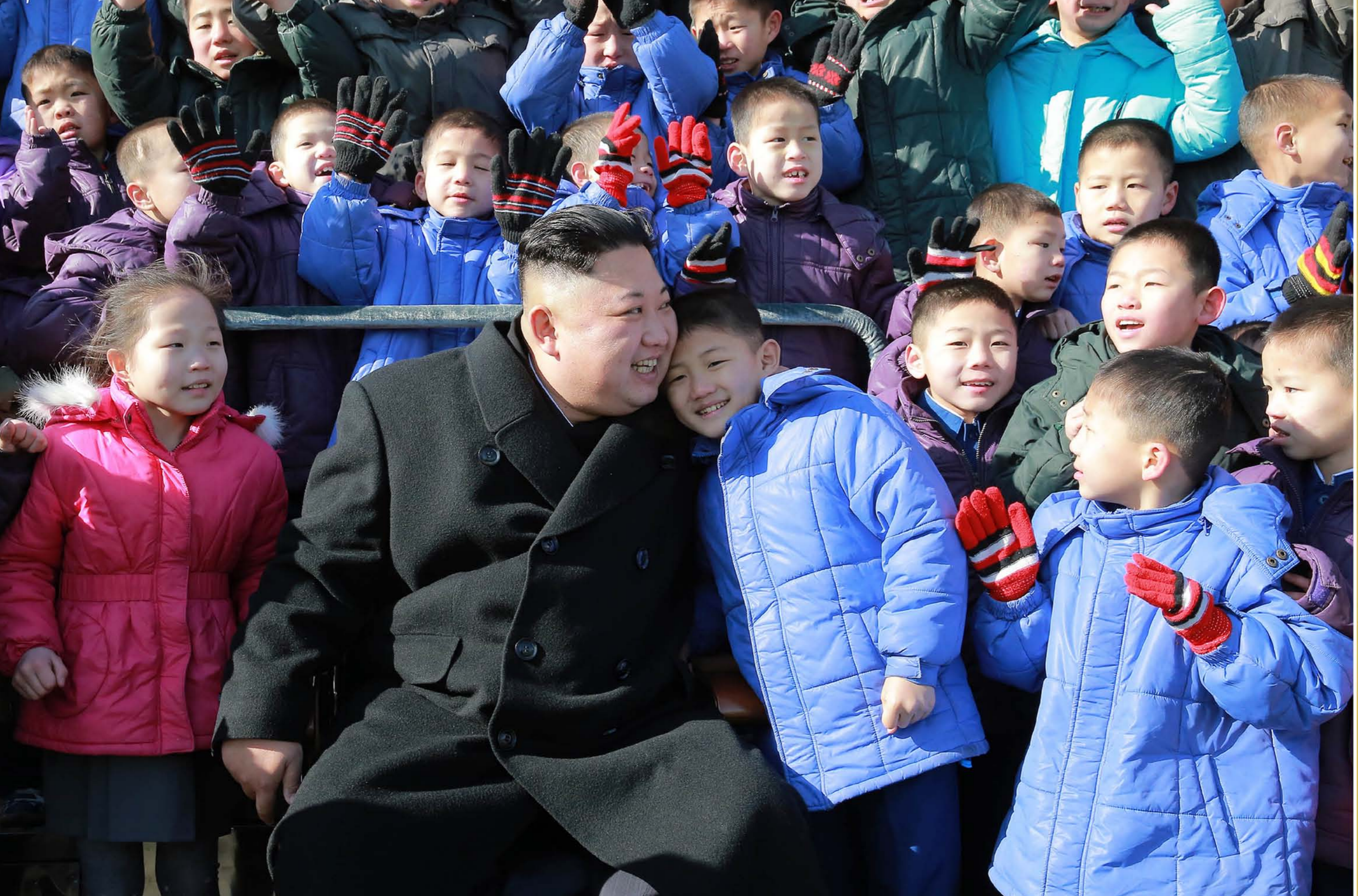
Kim Jong Un with the students of Pyongyang Primary School for Orphans in February Juche 106 (2017)