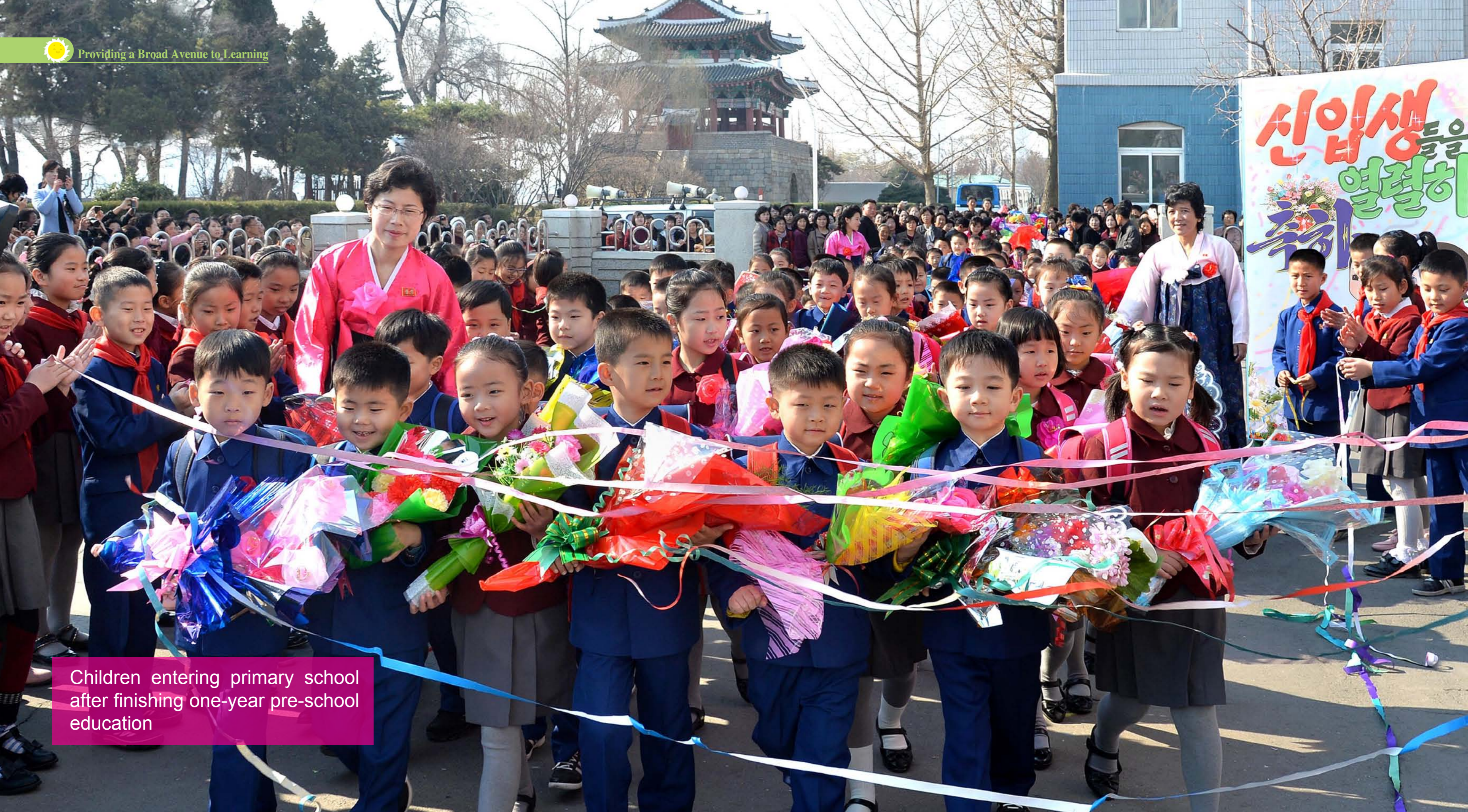
Children entering primary school after finishing one-year pre-school education