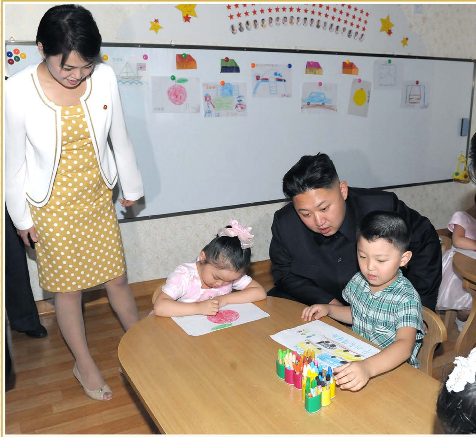
Kim Jong Un visiting Kyongsang Kindergarten in July Juche 101 (2012)