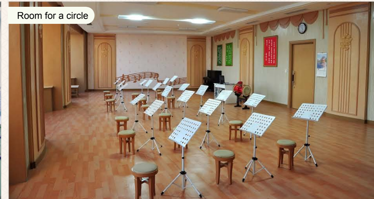
Room for a circle