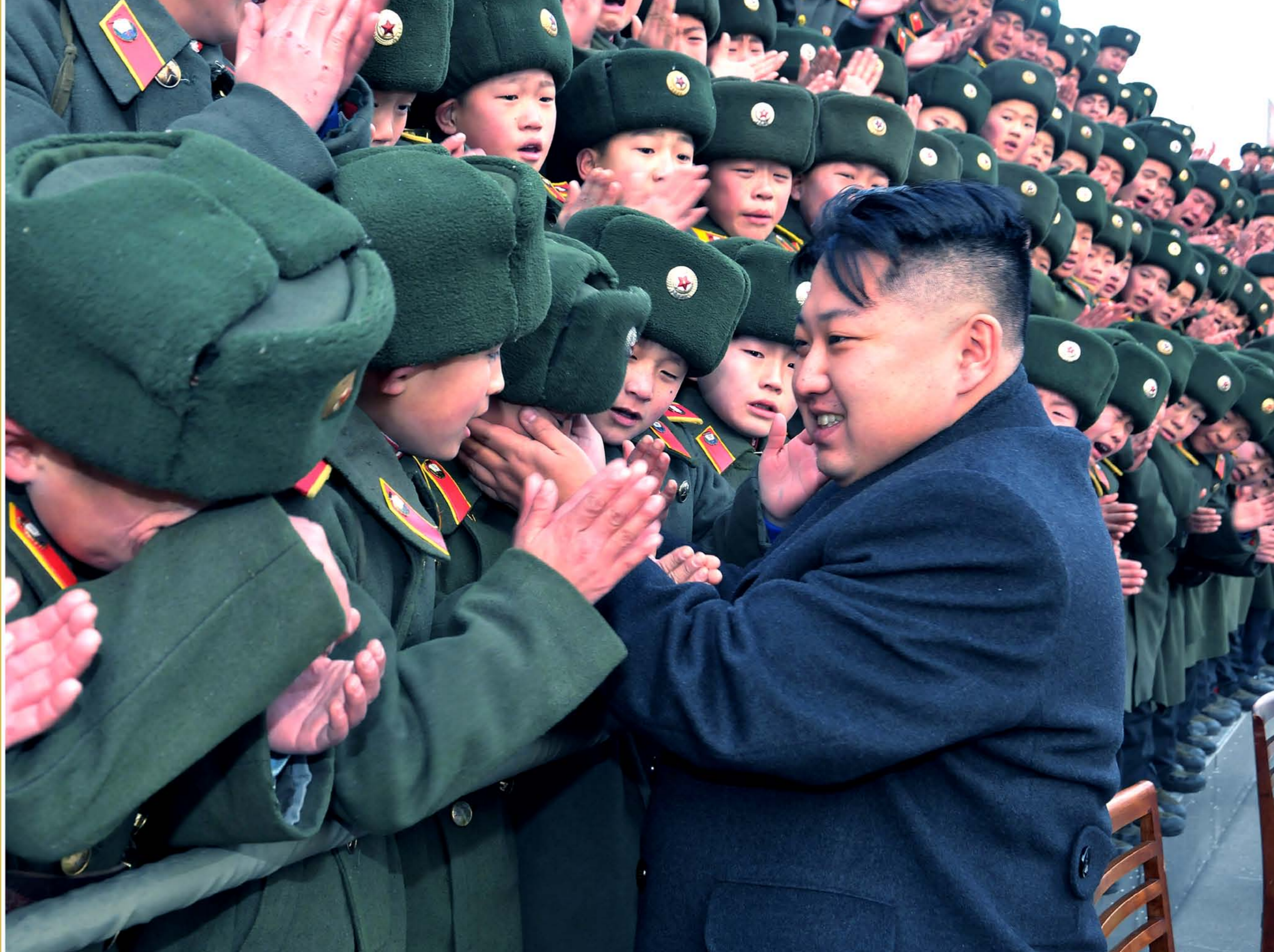
Kim Jong Un visiting Mangyongdae Revolutionary School to congratulate the students on the lunar New Year's Day in January Juche 101 (2012)

Under his care, the students of the school grow up as reliable heirs to the revolution.