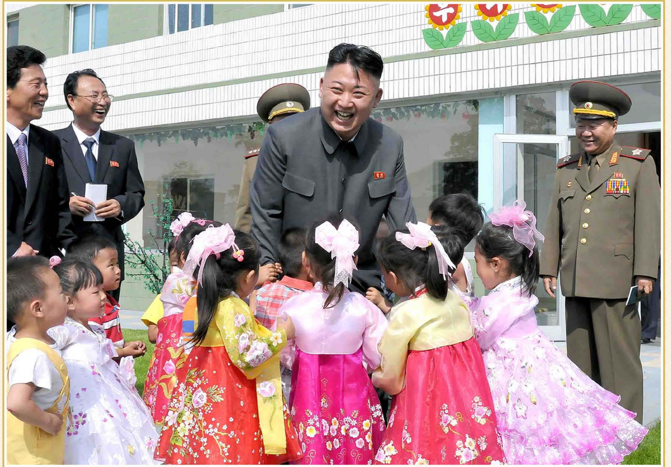
Kim Jong Un visiting the nursery of the Pyongyang Condiment Factory in June Juche 102 (2013)