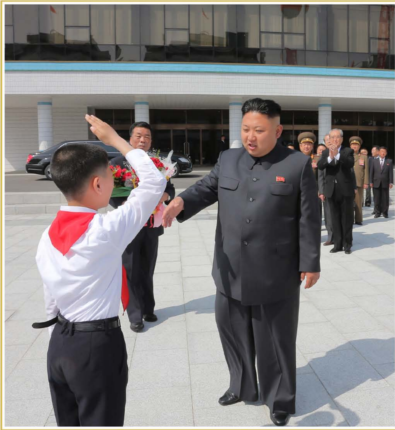
Kim Jong Un at the inauguration ceremony of the renovated Songdown International Children's Camp in May Juche 103 (2014)