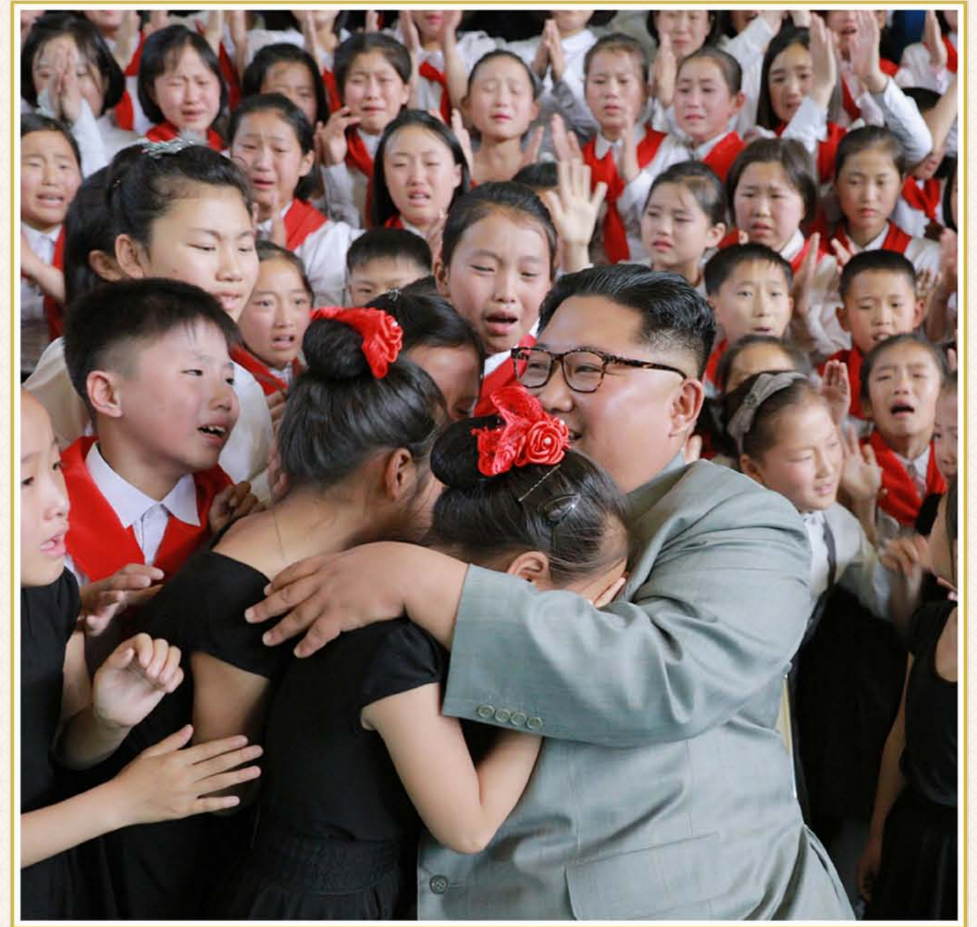
Kim Jong Un visiting the 1 000-ri Journey for Learning Schoolchildren's Palace in May Juche 108 (2019)