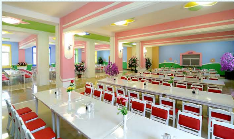
Pyongyang Primary School for Orphans