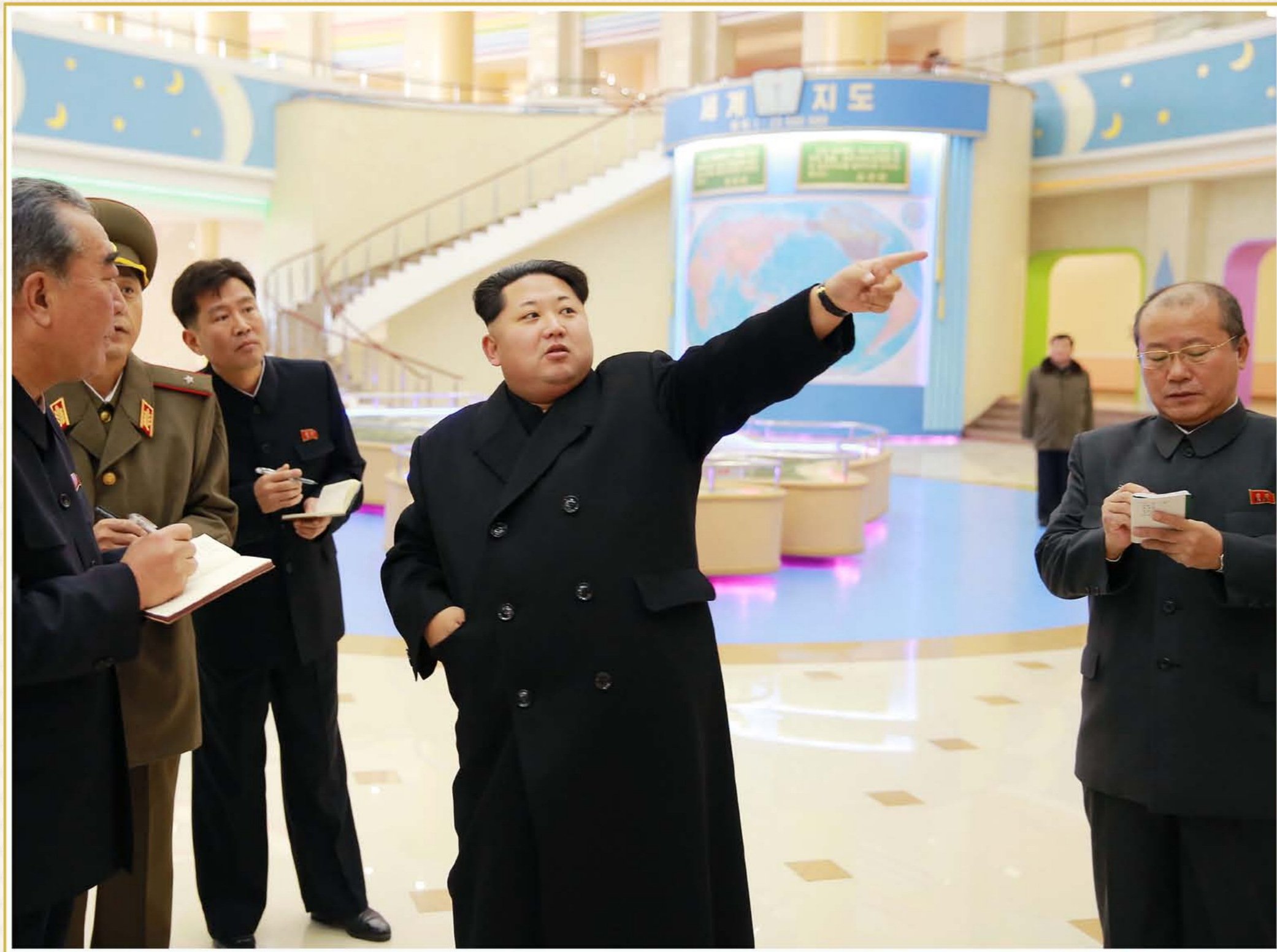
Kim Jong Un looking round the renovated Mangyongdae Schoolchildren's Palace in November Juche 104 (2015)