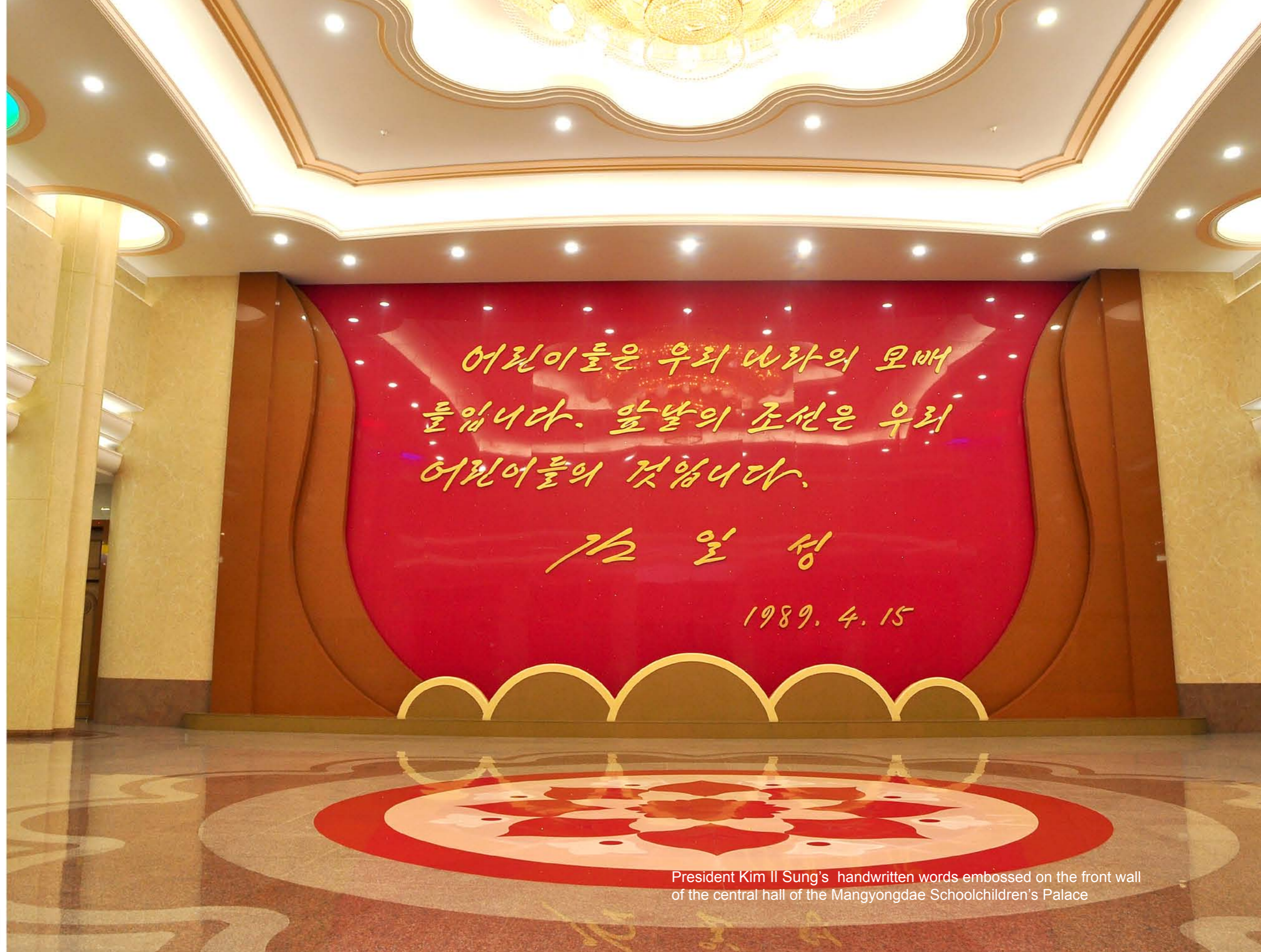
President Kim Il Sung's handwritten words embossed on the front wall of the central hall of the Mangyongdae Schoolchildren's Palace