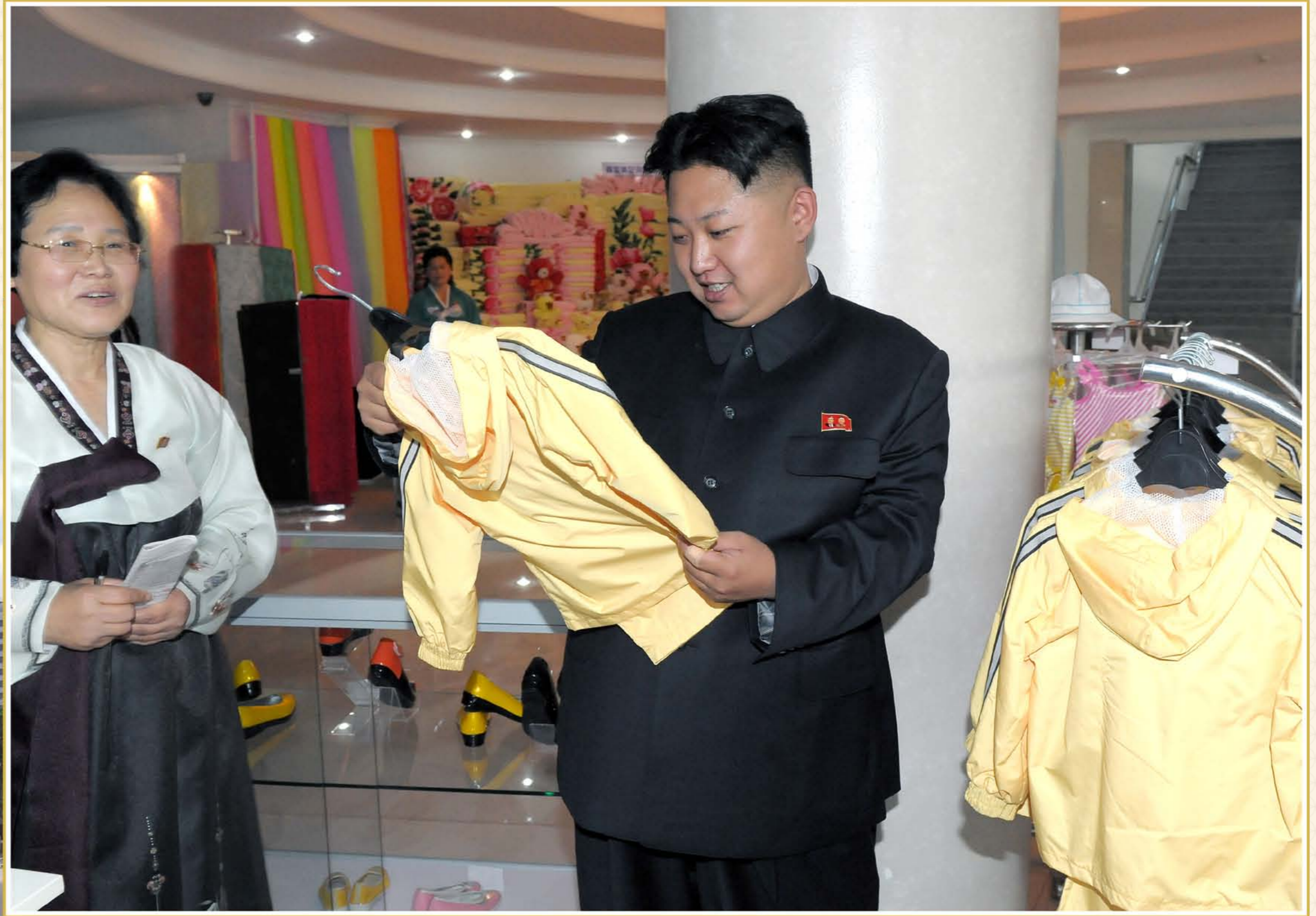
Kim Jong Un giving on-site guidance at the Pyongyang Children's Department Store in July Juche 101 (2012)