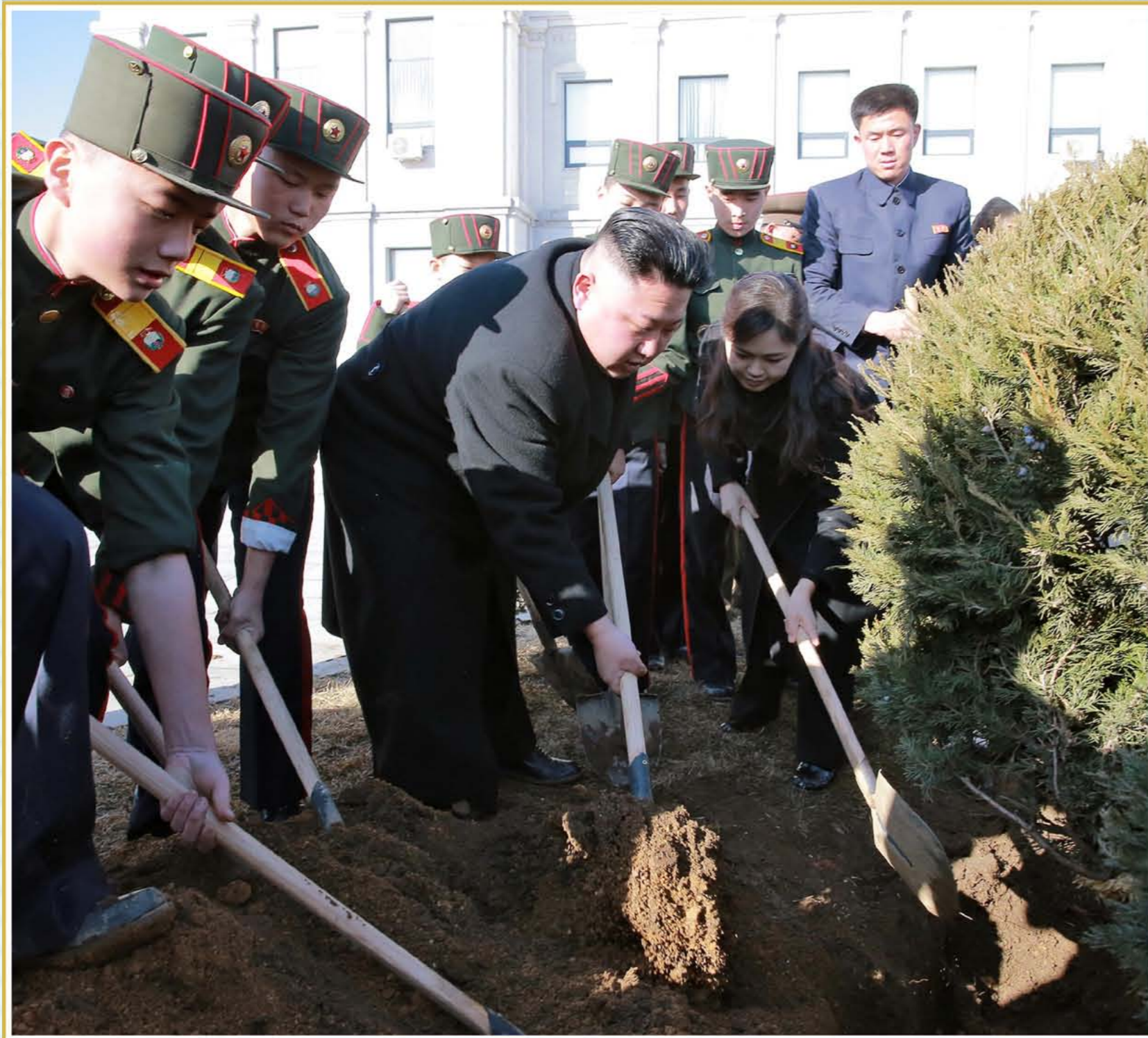
Kim Jong Un planting a tree with the students of Mangyongdae Revolutionary School in March Juche 106 (2017)