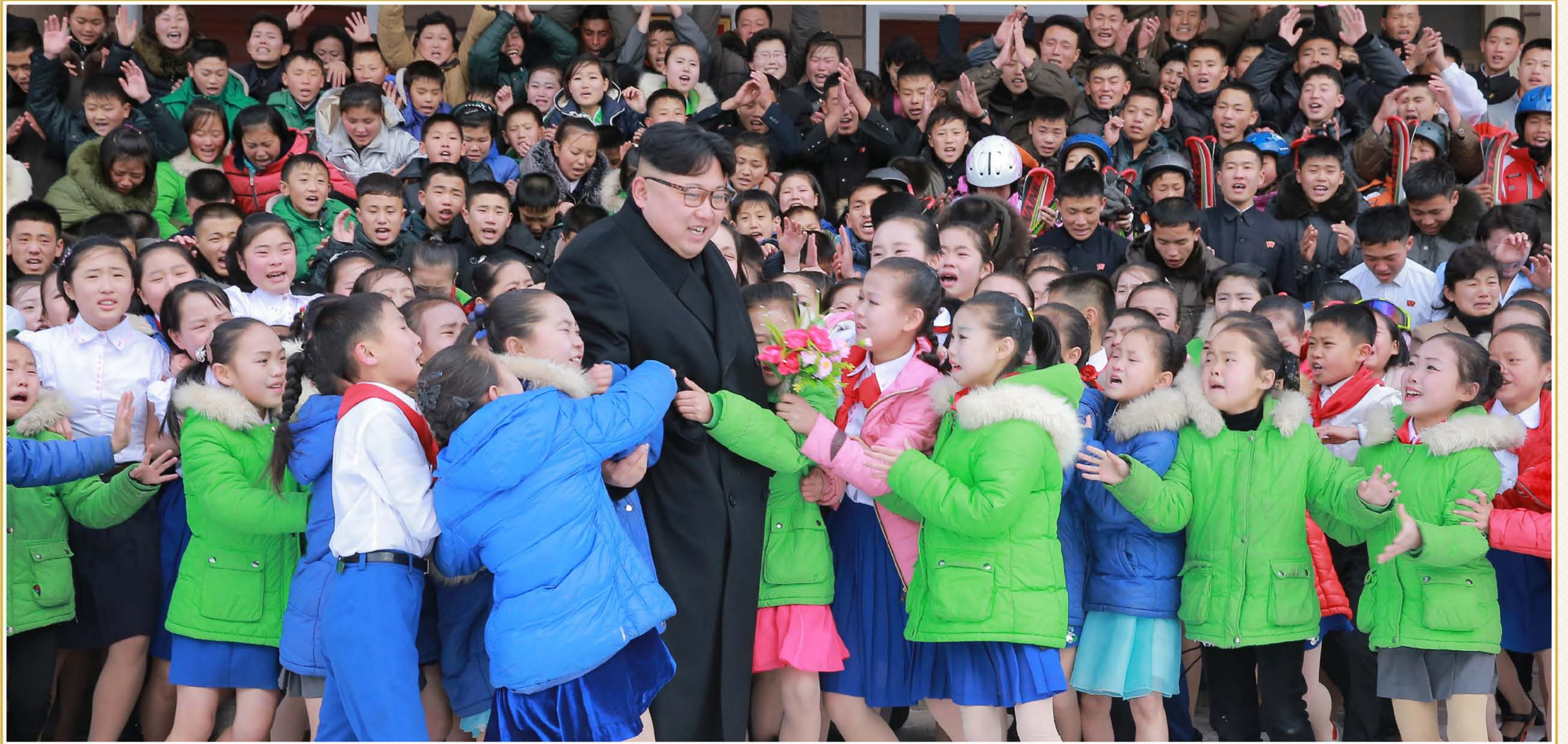
Kim Jong Un with the circle members of the Samjiyon Schoolchildren's Palace in November Juche 105 (2016)