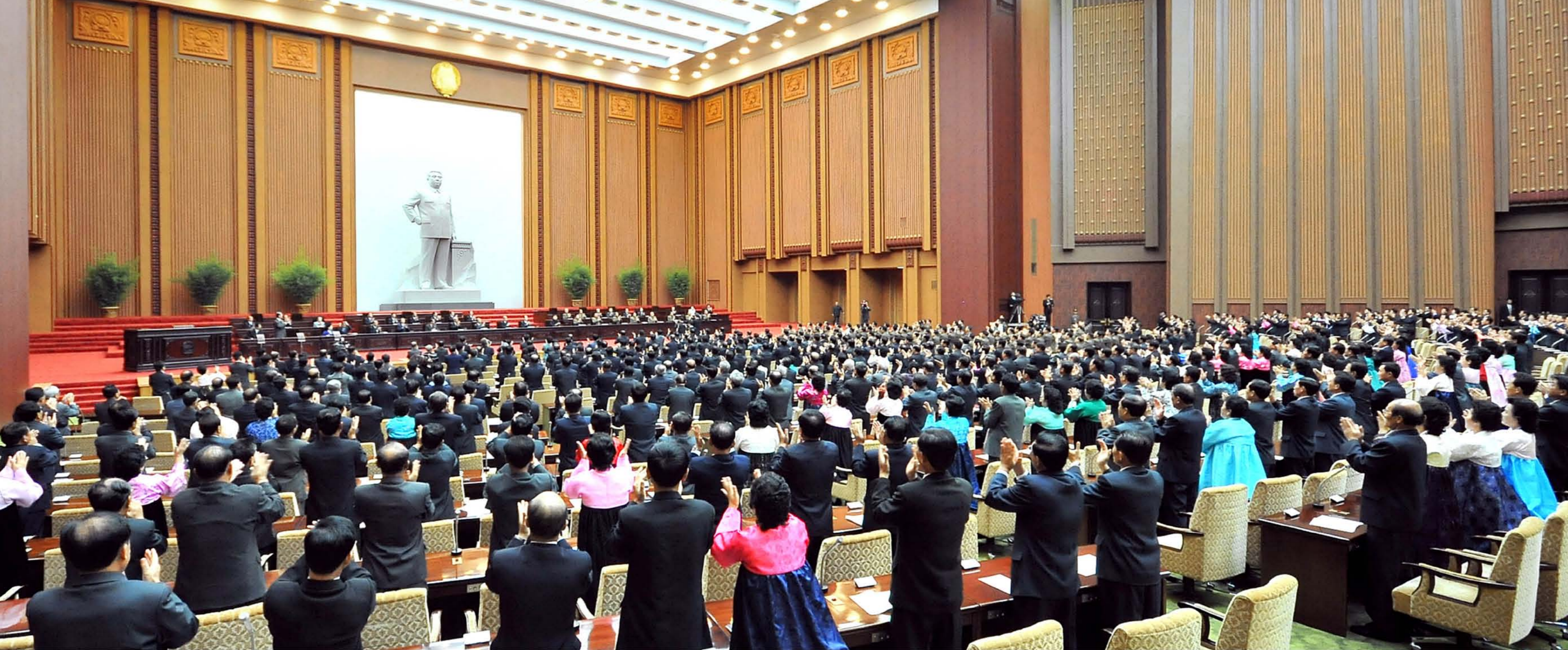
The Sixth Session of the Twelfth Supreme People's Assembly of the DPRK held on September 25, Juche 101 (2012) promulgating the law on enforcing universal 12-year compulsory education