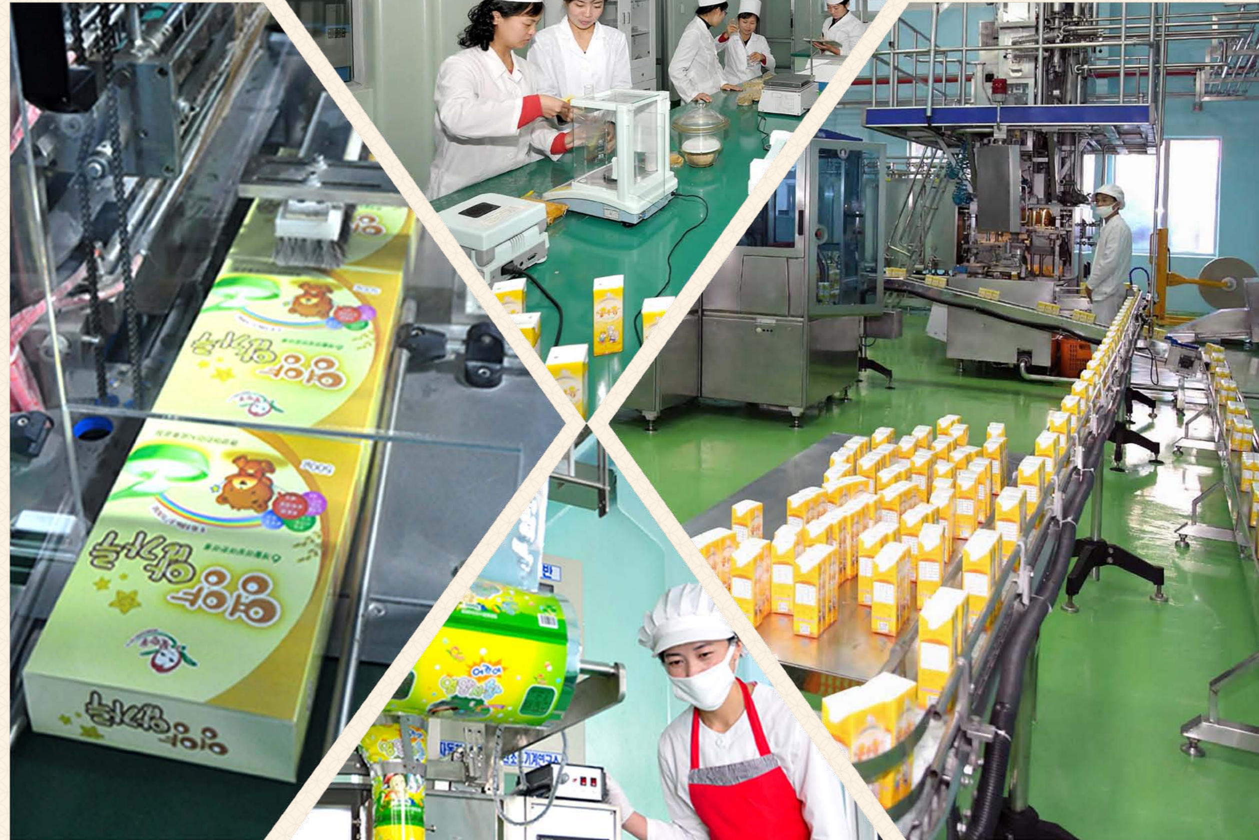
Pyongyang Children's Foodstuff Factory