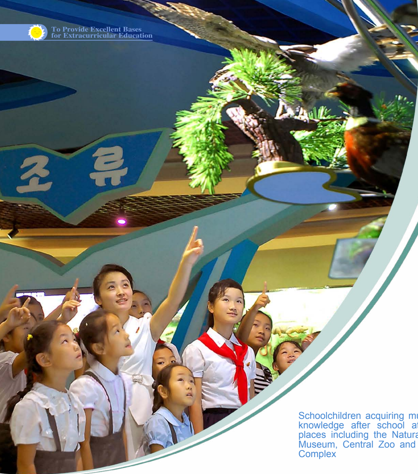
Schoolchildren acquiring multifarious knowledge after school at various places including the Natural History Museum, Central Zoo and Sci-Tech Complex