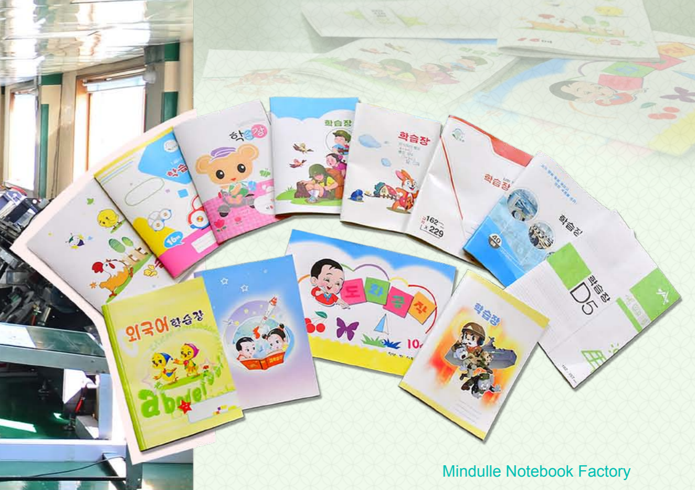
Mindulle Notebook Factory