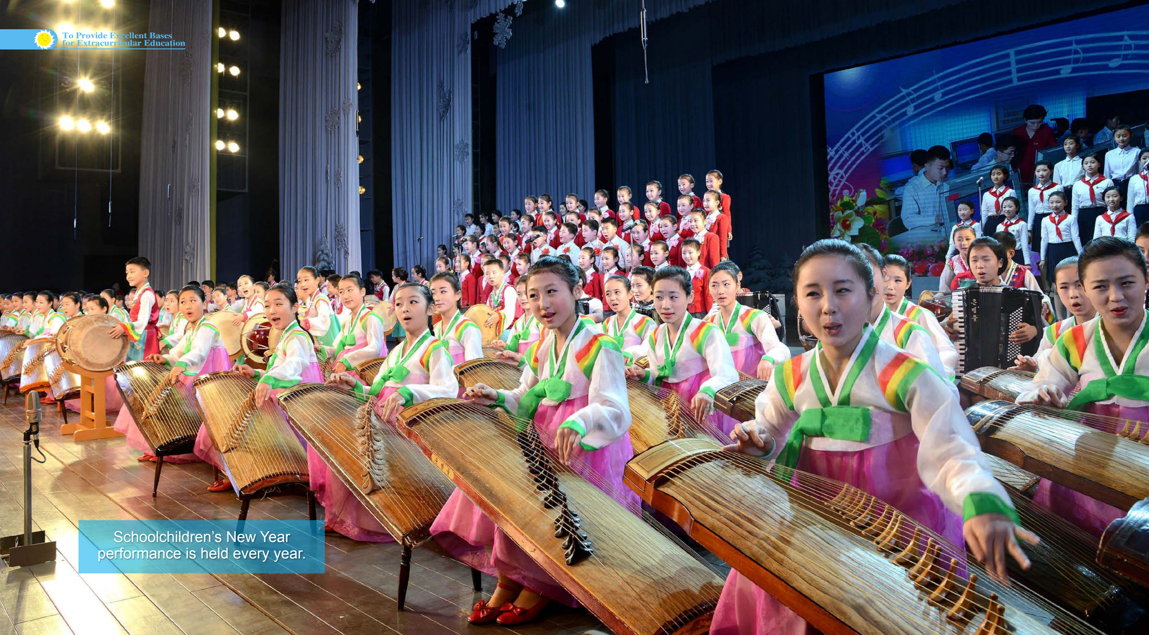
Schoolchildren's New Year performance is held every year.