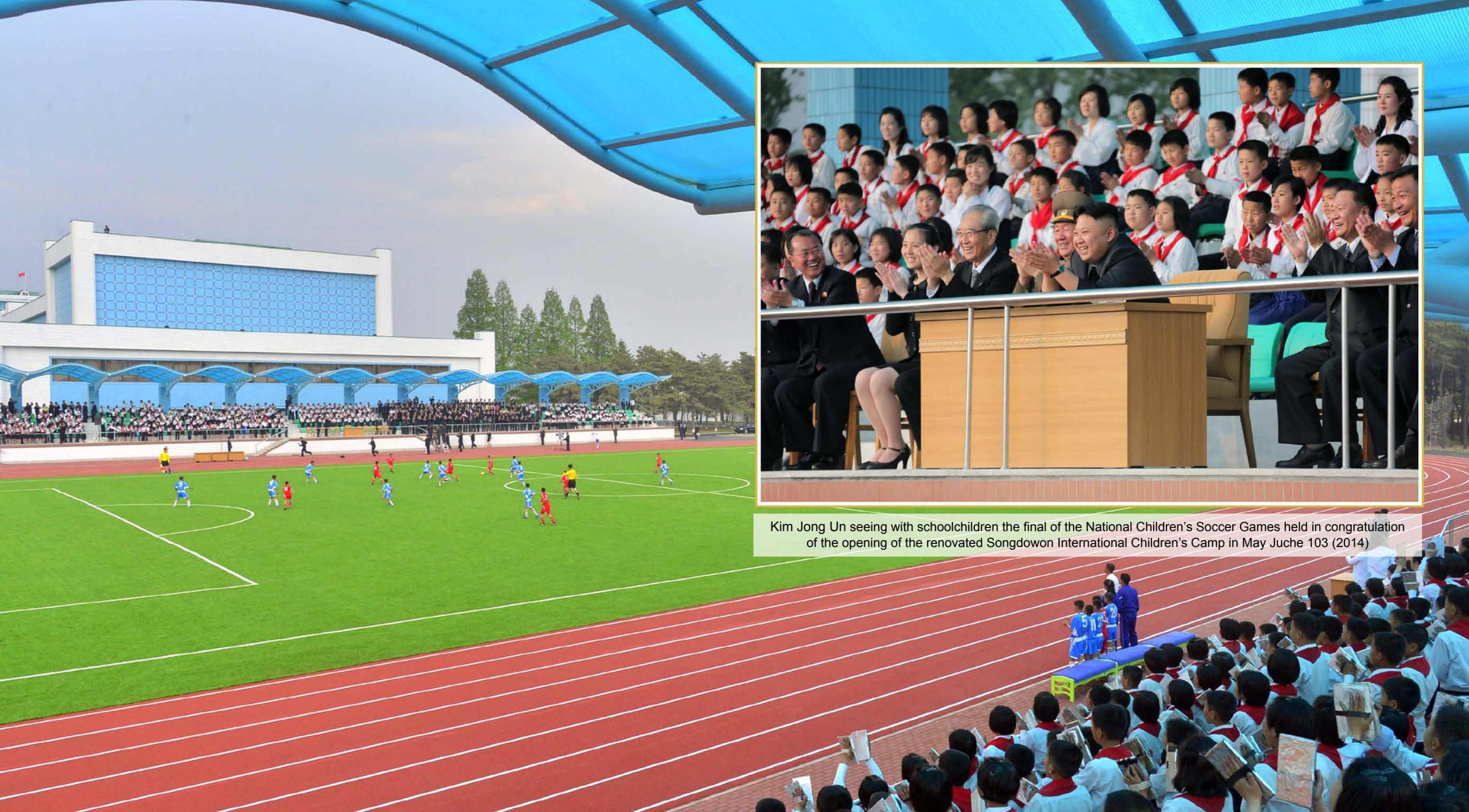
Kim Jong Un seeing with schoolchildren the final of the National Children's Soccer Games held in congratulation of the opening of the renovated Songdownon International Children's Camp in May Juche 103 (2014)