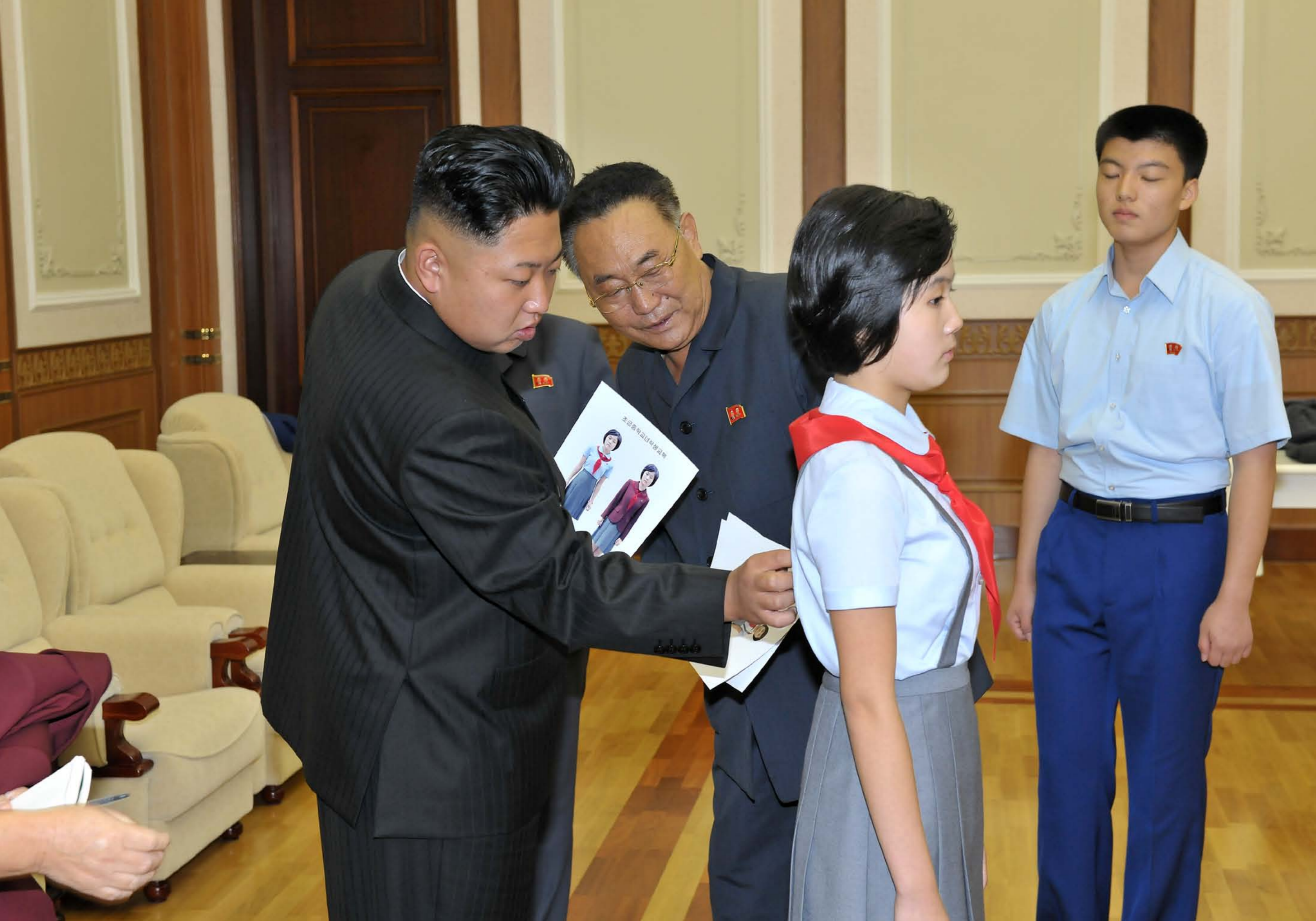
Kim Jong Un seeing sample school uniforms in September Juche 102 (2013)