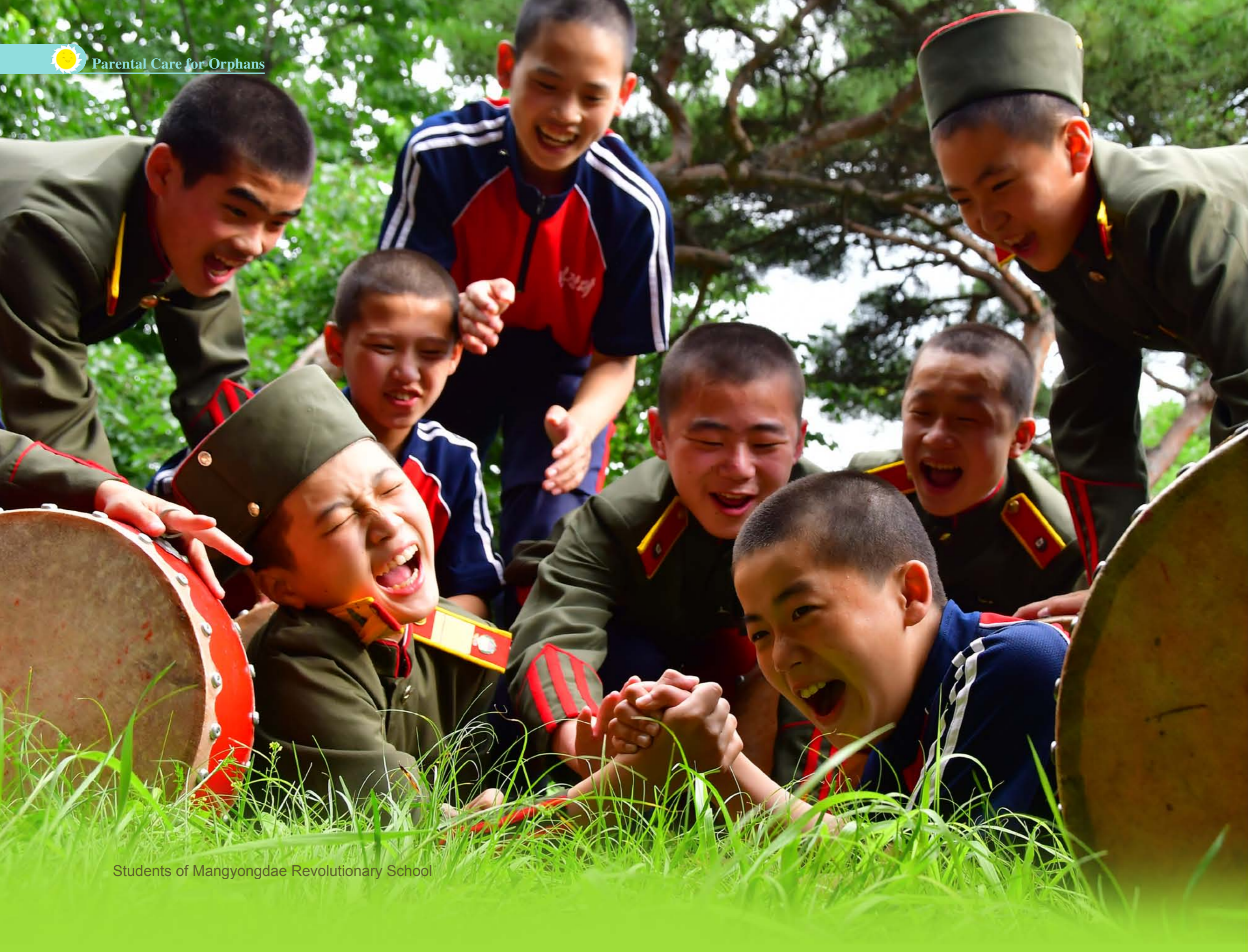
Students of Mangyongdae Revolutionary School