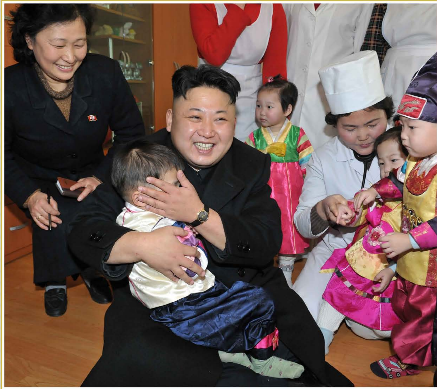
Kim Jong Un with the children at the Pyongyang Baby Home in February Juche 103 (2014)