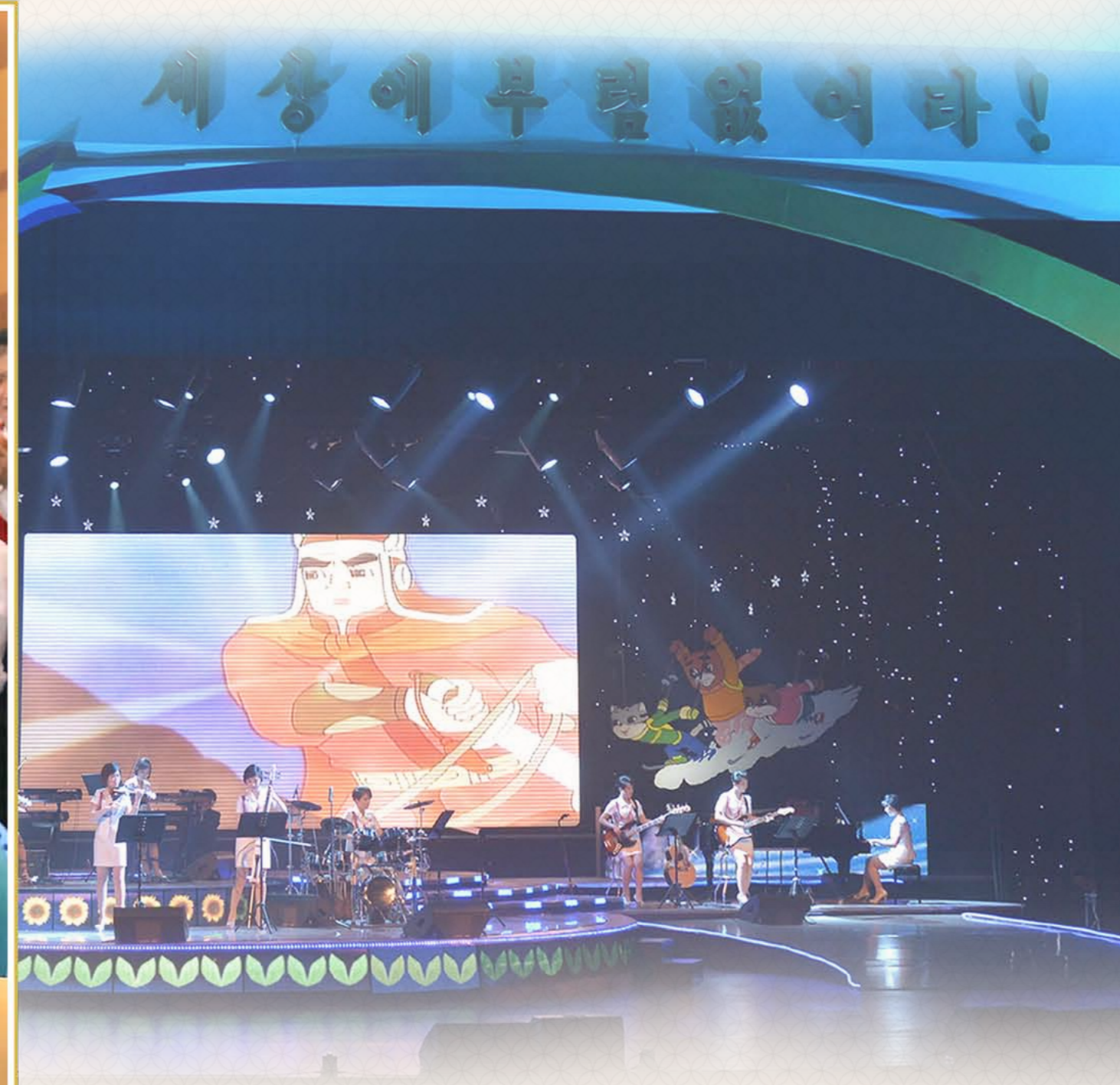
Kim Jong Un enjoying with schoolchildren an artistic performance held by the Moranbong Band in congratulation of the opening of the renovated Songdowon International Children's Camp in May Juche 103 (2014)