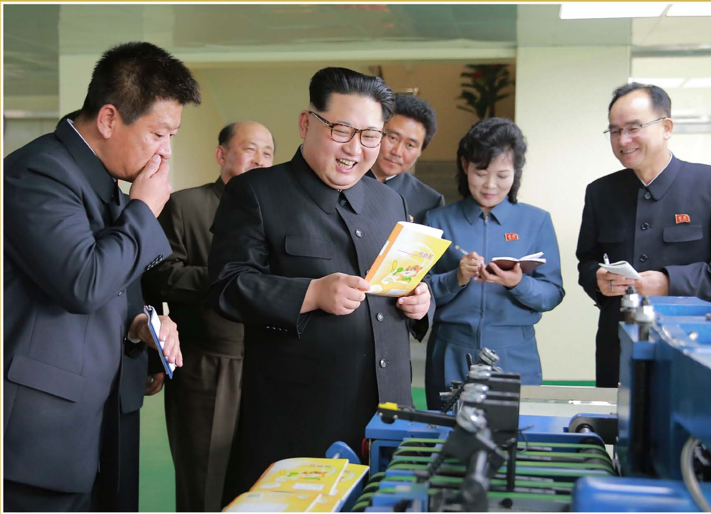
Kim Jong Un giving field guidance at the Mindulle Notebook Factory in April Juche 105 (2016)