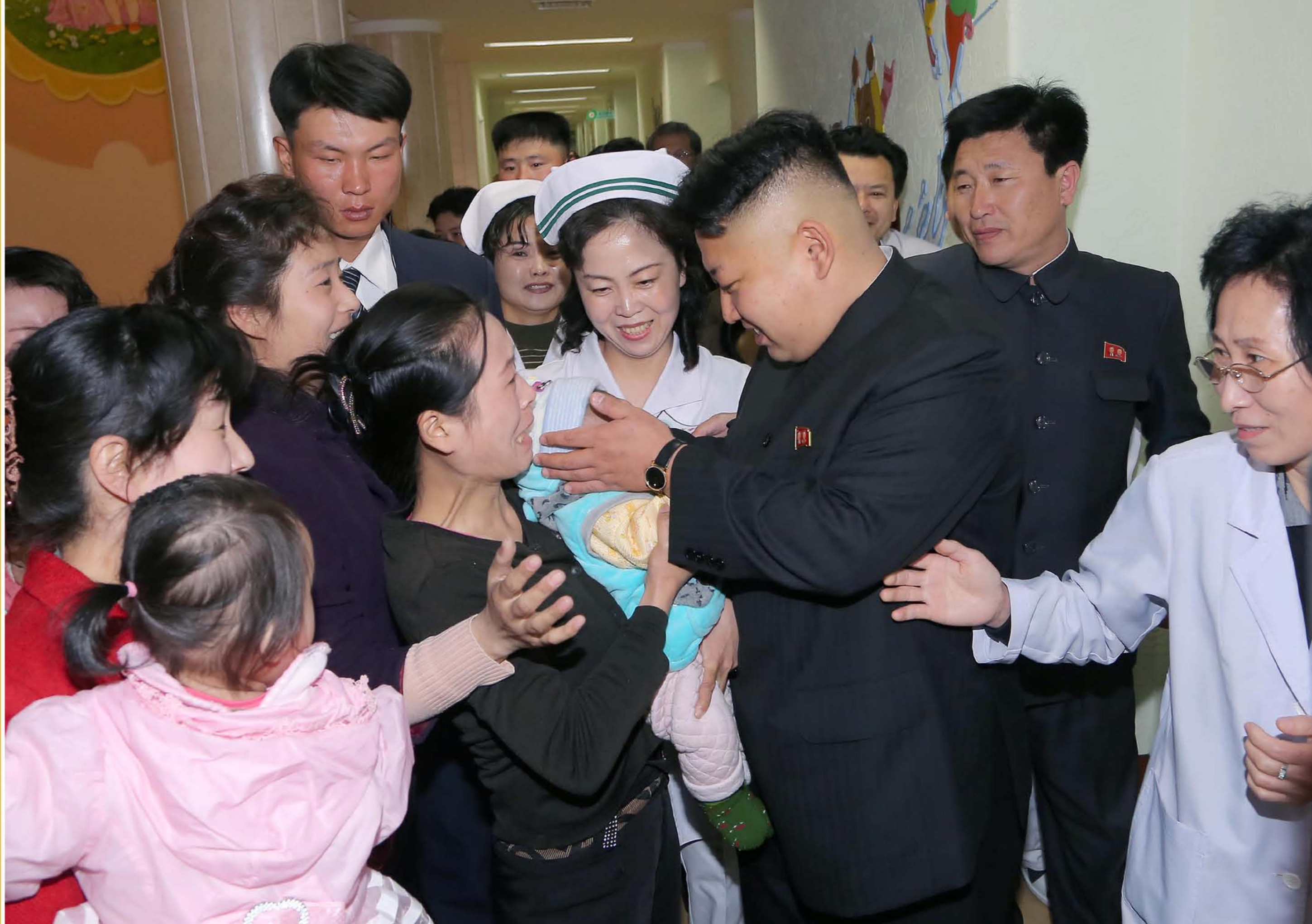
Kim Jong Un visiting the Okryu Children's Hospital in March Juche 103 (2014)