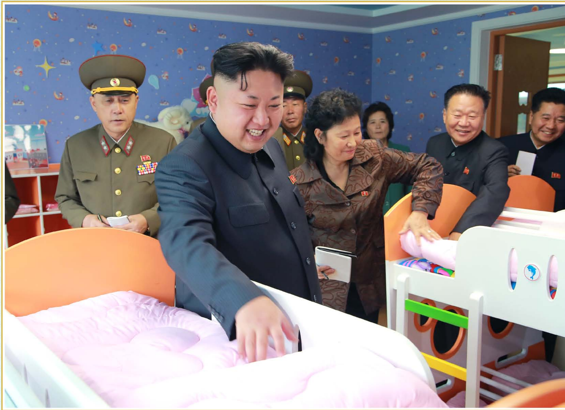
Kim Jong Un giving field guidance at the completed Pyongyang Baby Home and Orphanage in October Juche 103 (2014)