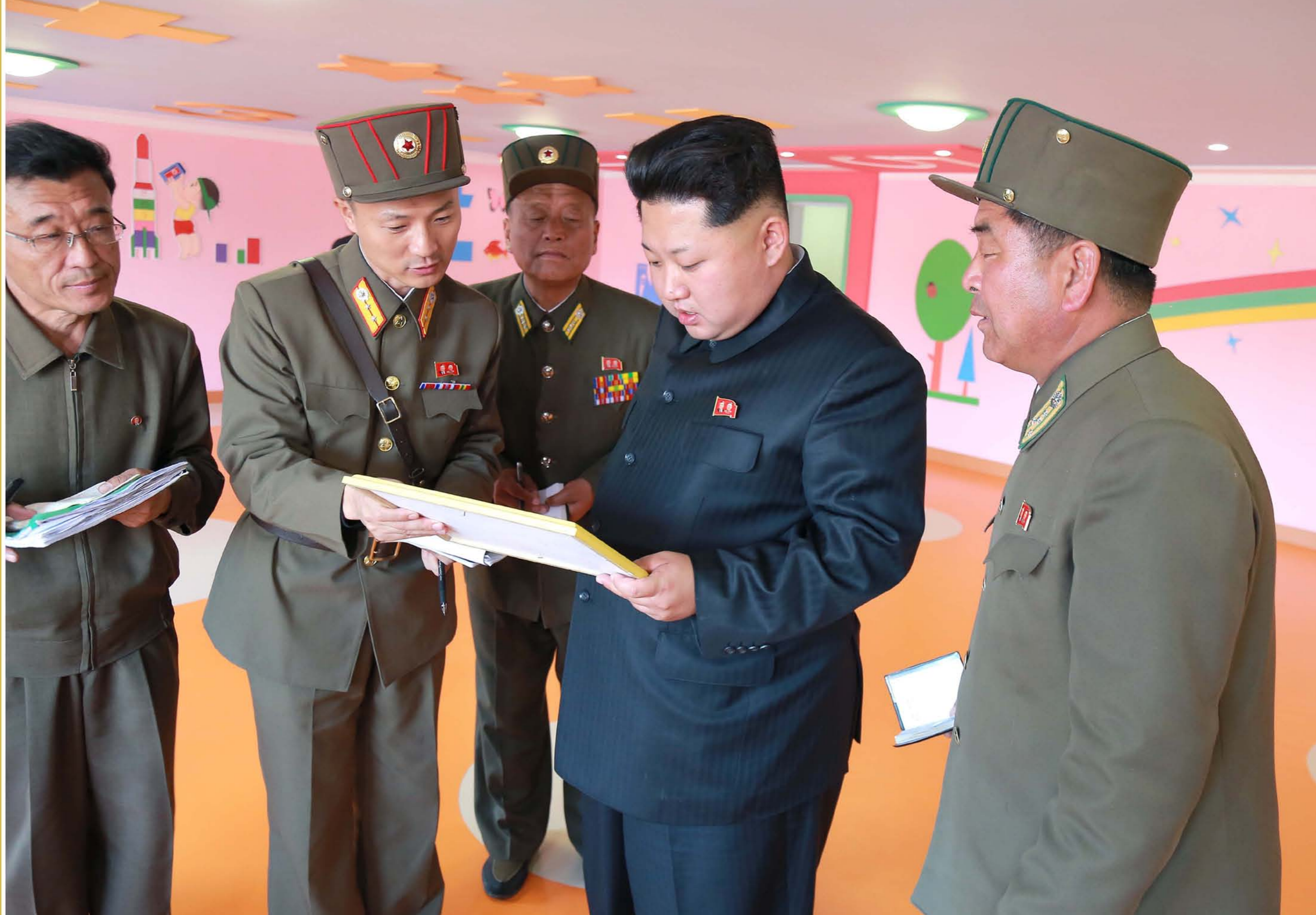
Kim Jong Un giving field guidance at the Wonsan Baby Home and Orphanage nearing completion in April Juche 104 (2015)