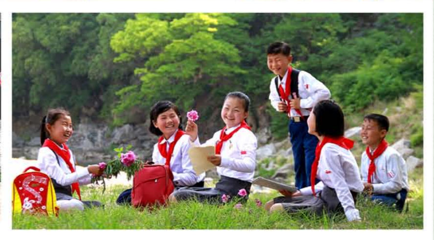
Schoolchildren are provided with new uniforms according to season and school things.