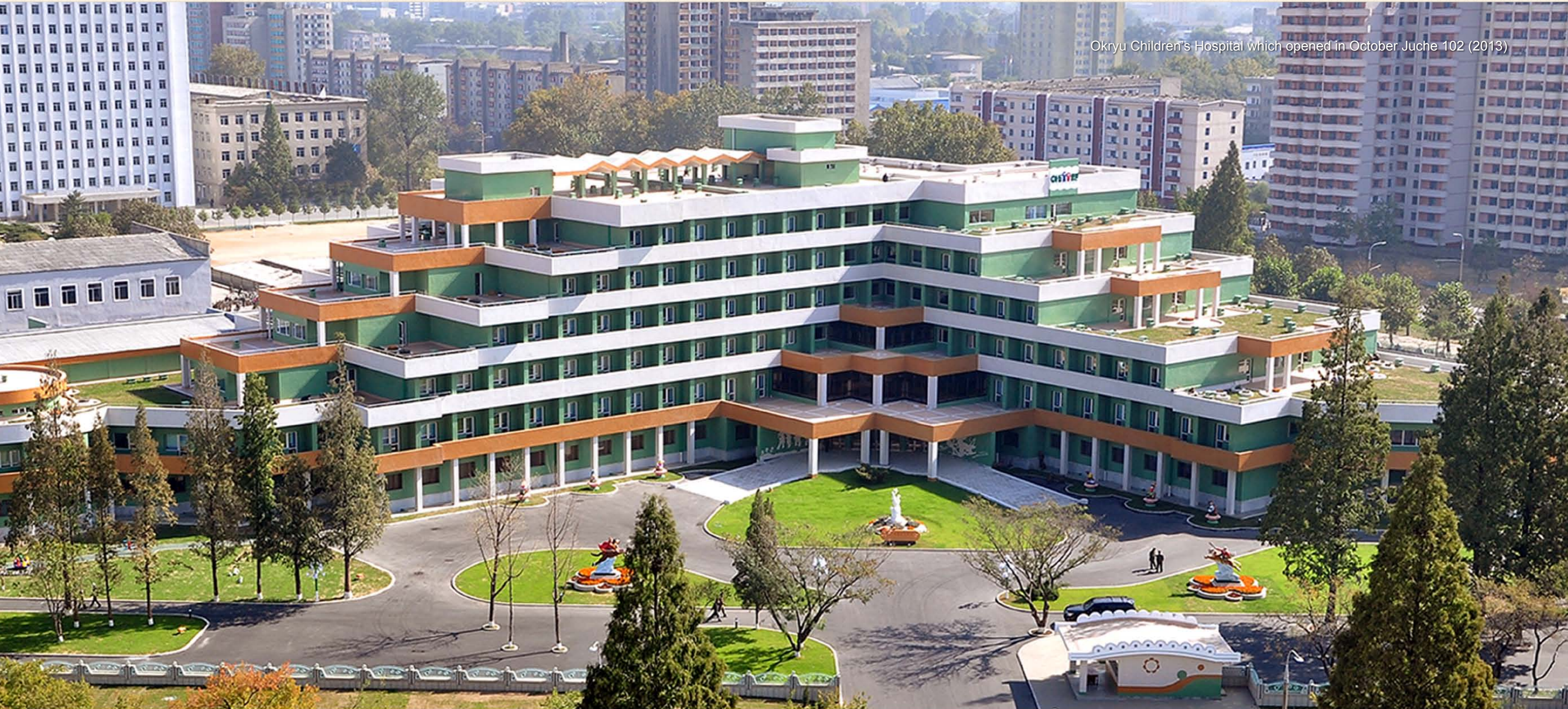
Okryu Children's Hospital which opened in October Juche 102 (2013)