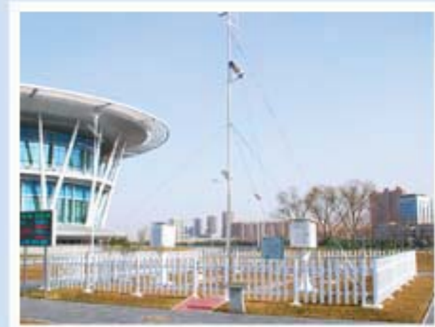
Weather observing tower