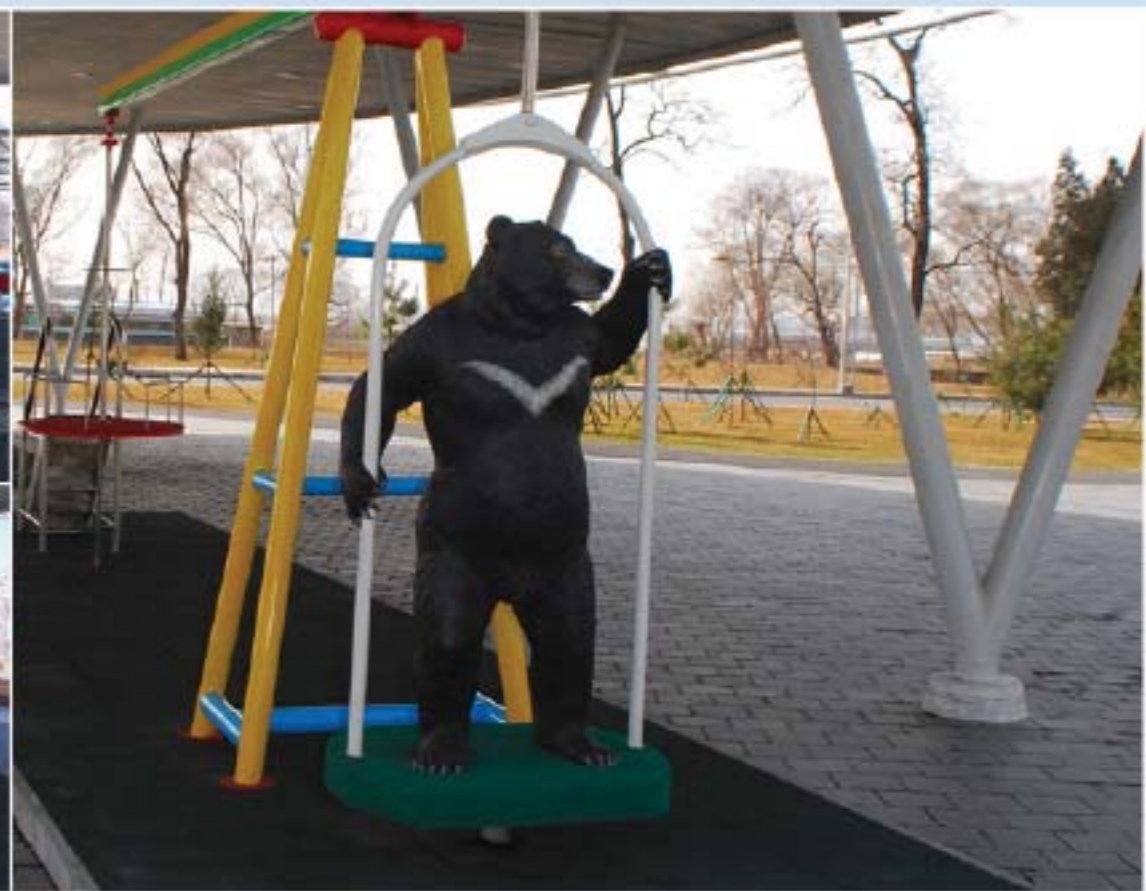
Scientific amusement section