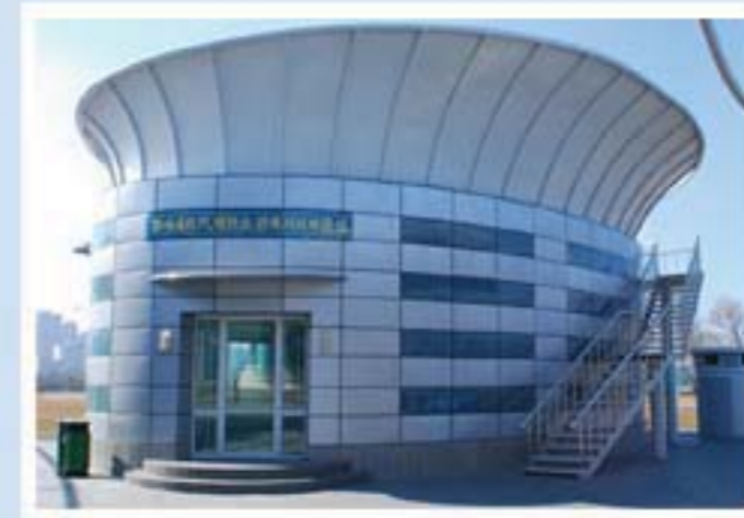
Building for introducing zero-energy and zero-carbon architectural techniques