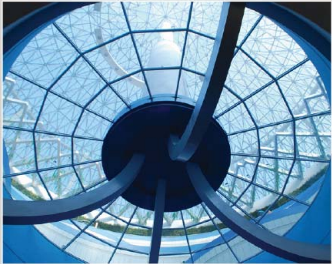
Tiered lounge hall