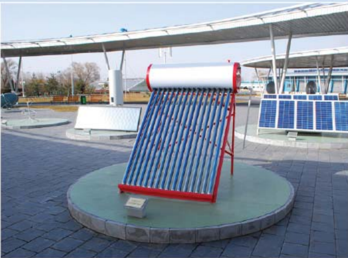
Future energy section