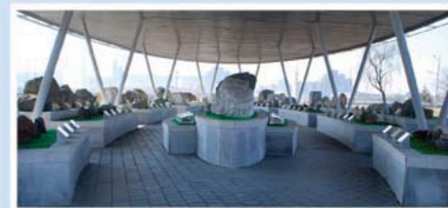
Underground resources section