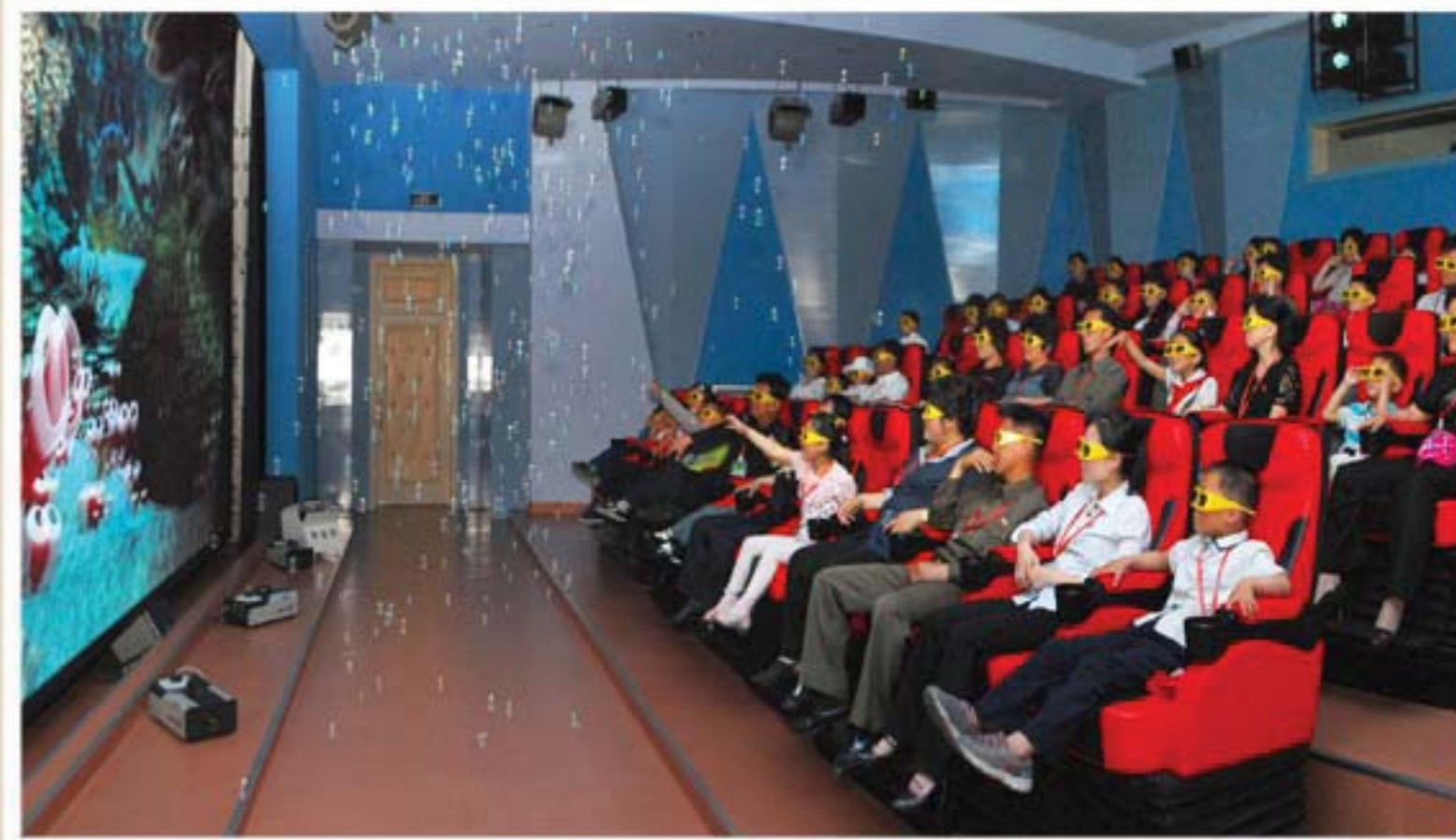
4D simulation cinema