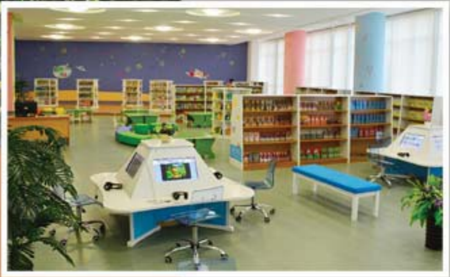
Children's reading area

The hall helps children to improve intellectual faculty and have a clear understanding of nature in the process of finding out by themselves scientific principles by operating and examining diverse forms of exhibits. There they also nurture their dreams of becoming future scientists and technicians.