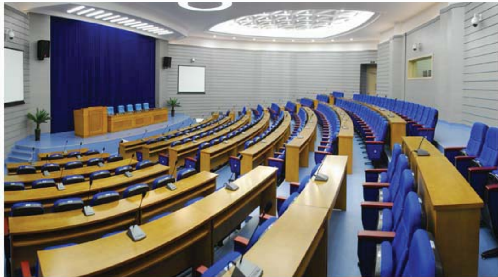
Academic seminar hall