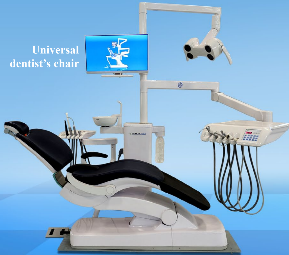
Universal dentist's chair