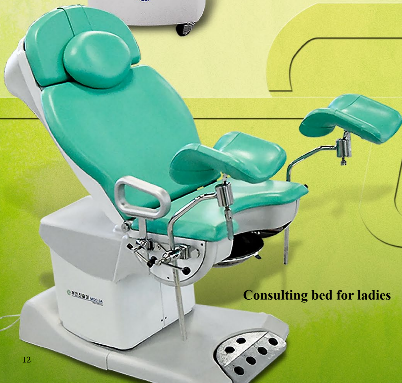
Consulting bed for ladies