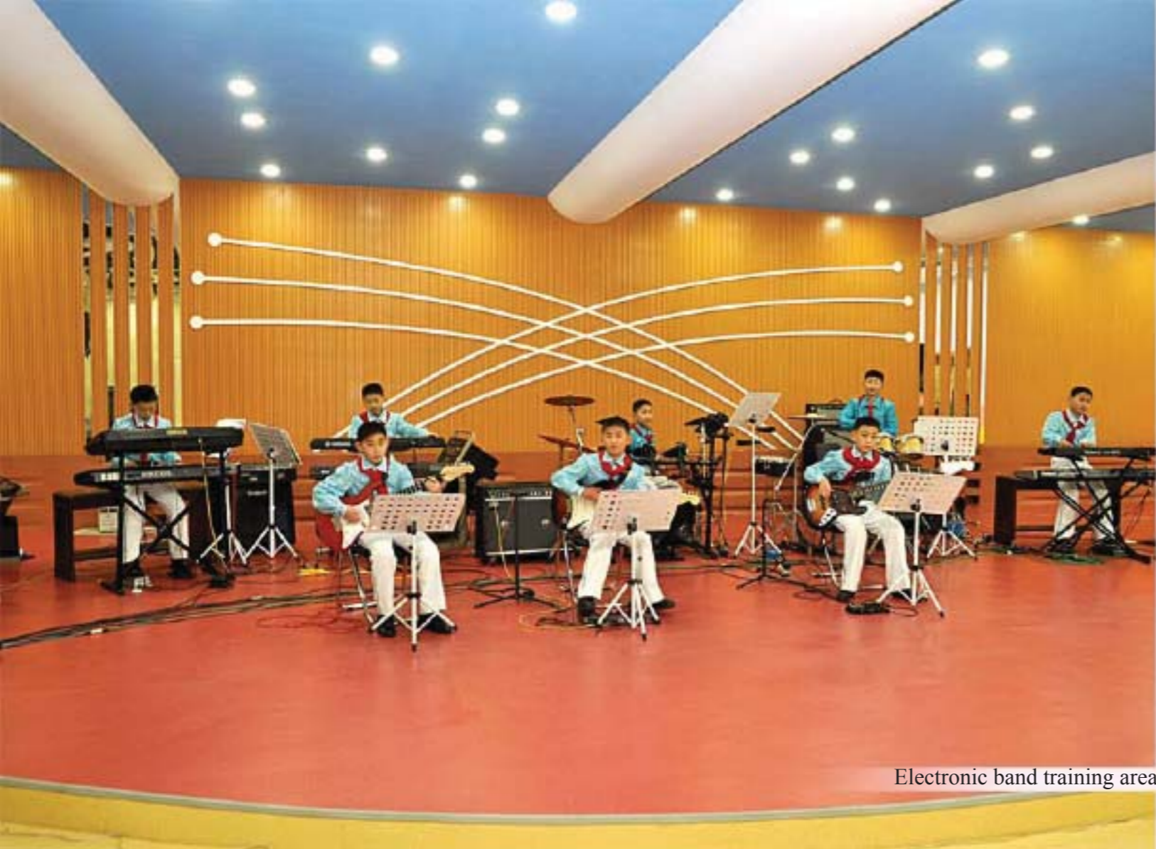
Electronic band training area