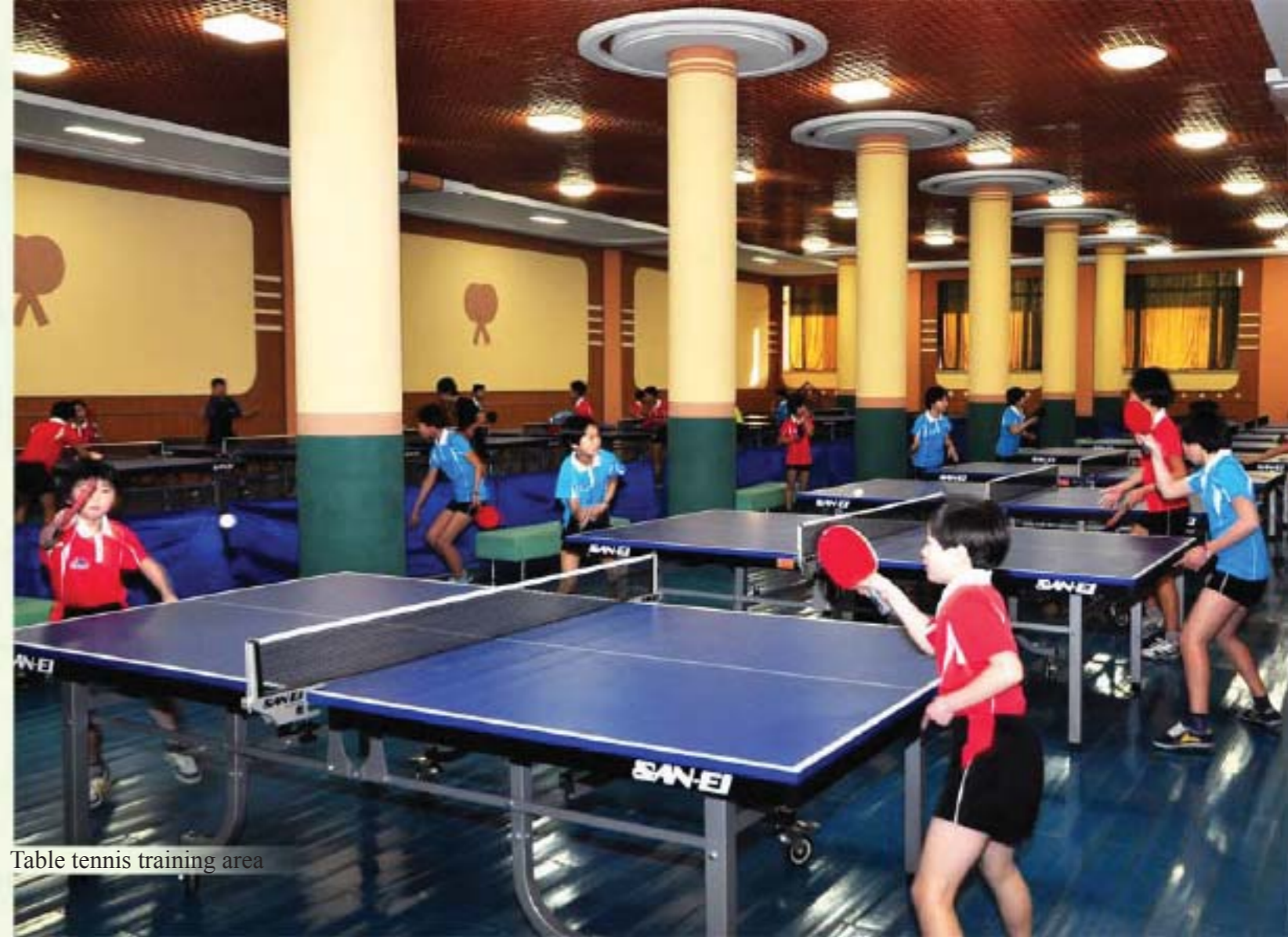
Table tennis training area