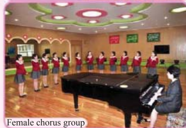
Female chorus group