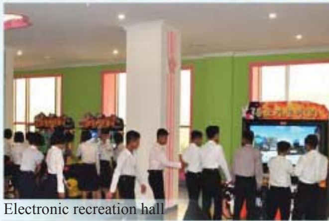
Electronic recreation hall