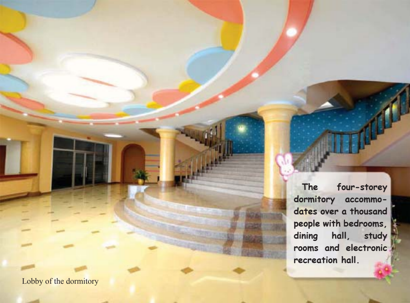
Lobby of the dormitory

The four-storey dormitory accommodates over a thousand people with bedrooms, dining hall, study rooms and electronic recreation hall.