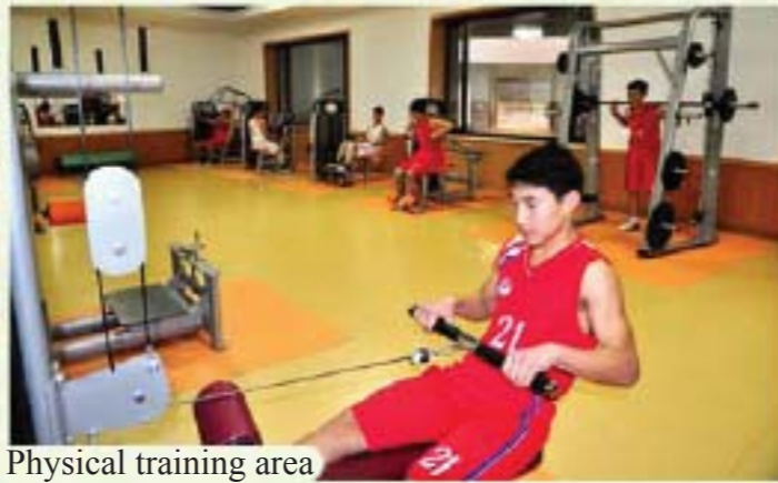
Physical training area