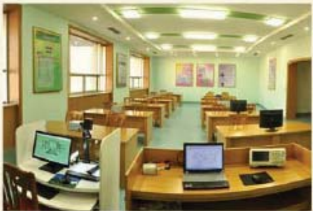
Electronic devices group