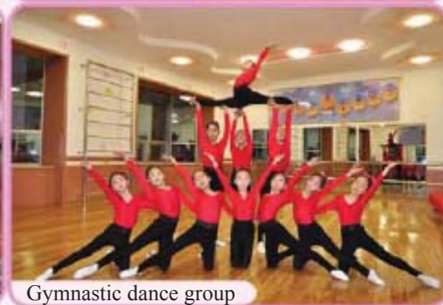
Gymnastic dance group