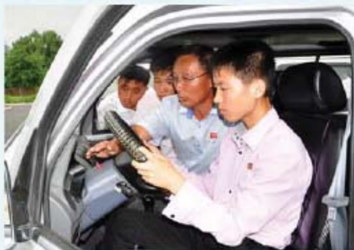
Driver training lot