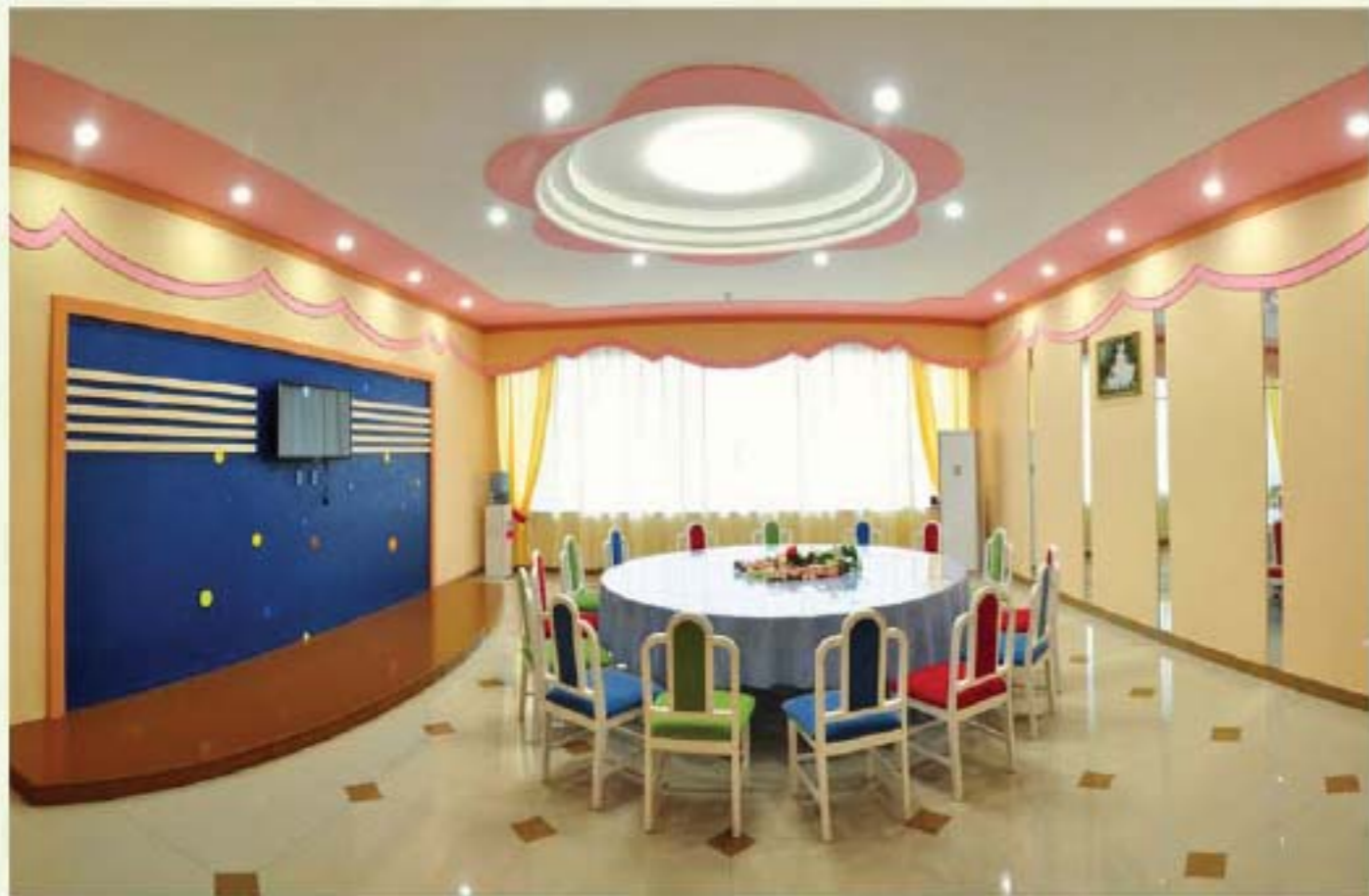
Room for birthday party