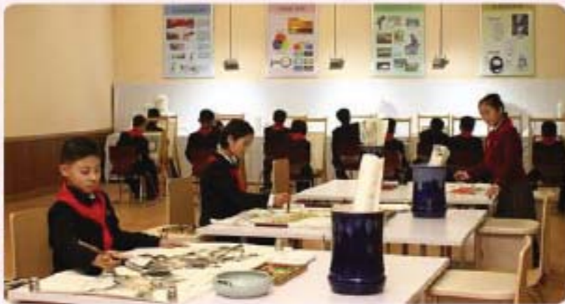
Fine art group