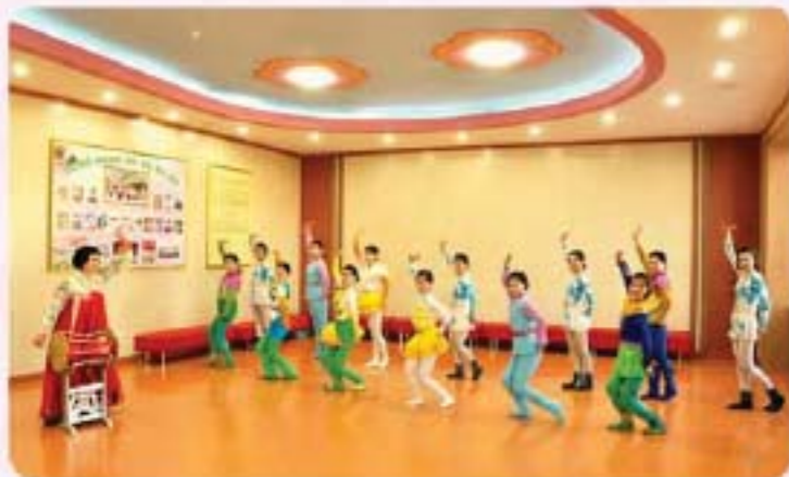
Public activities group