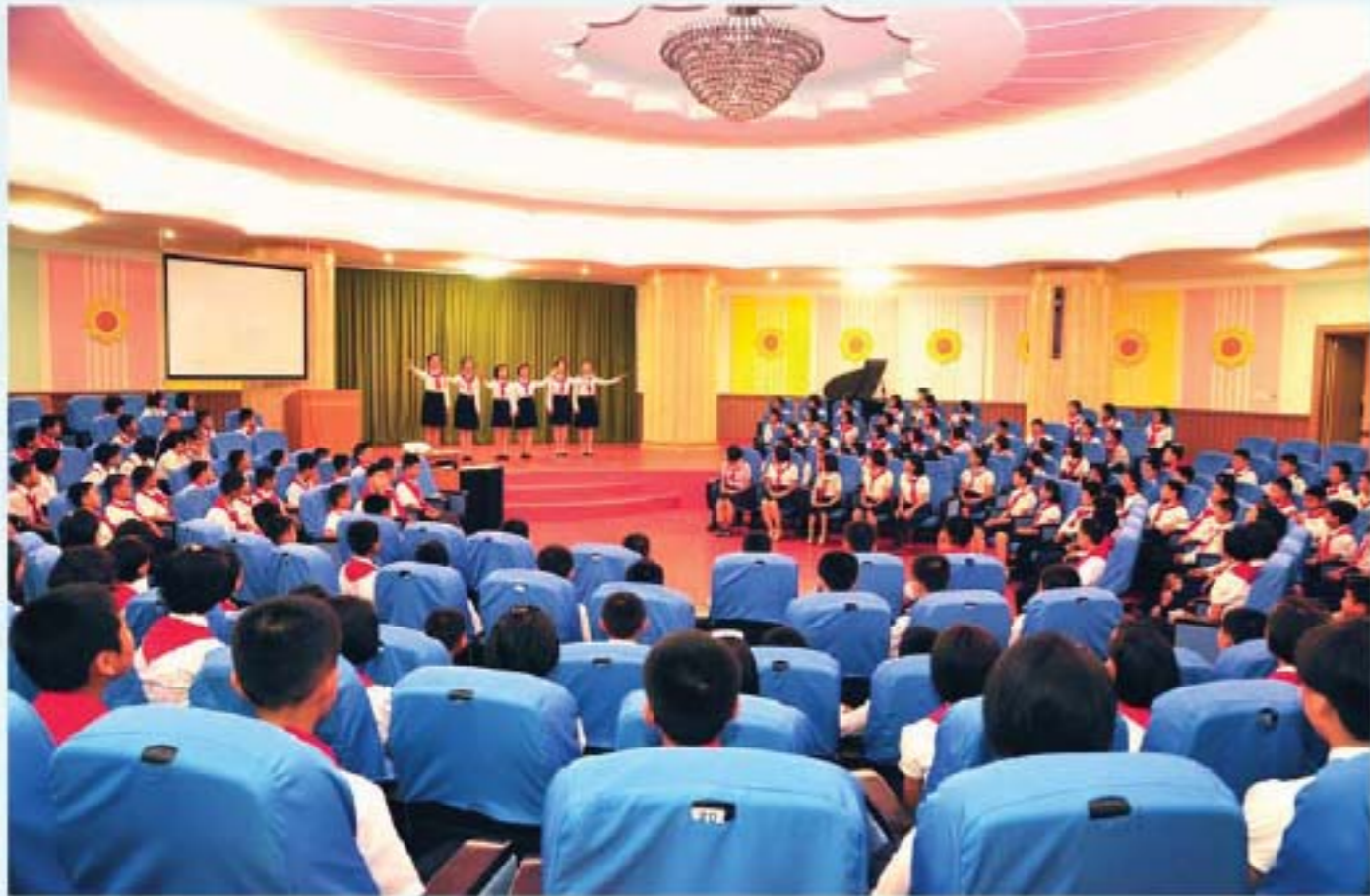
Public activities room