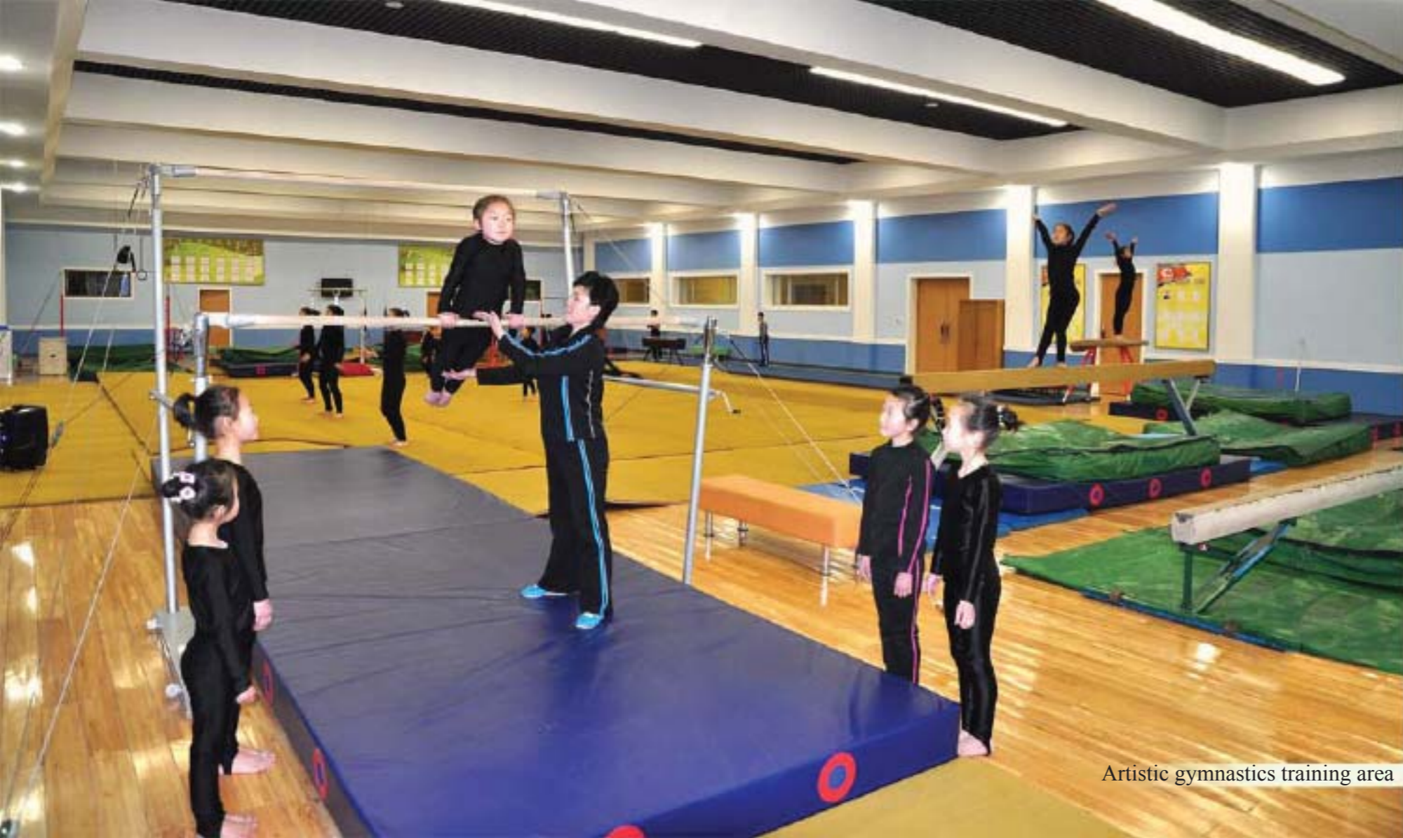
Artistic gymnastics training area