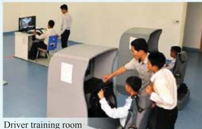
Driver training room