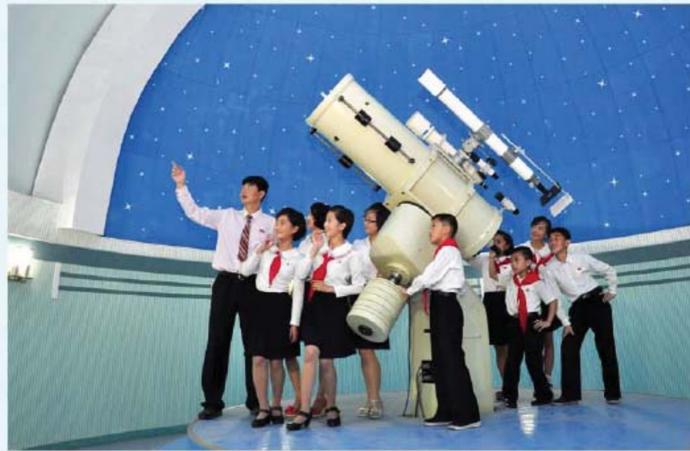
Astronomical telescope room