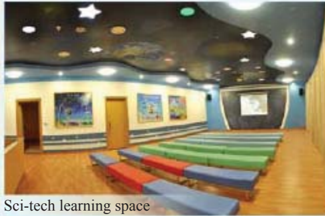
Sci-tech learning space