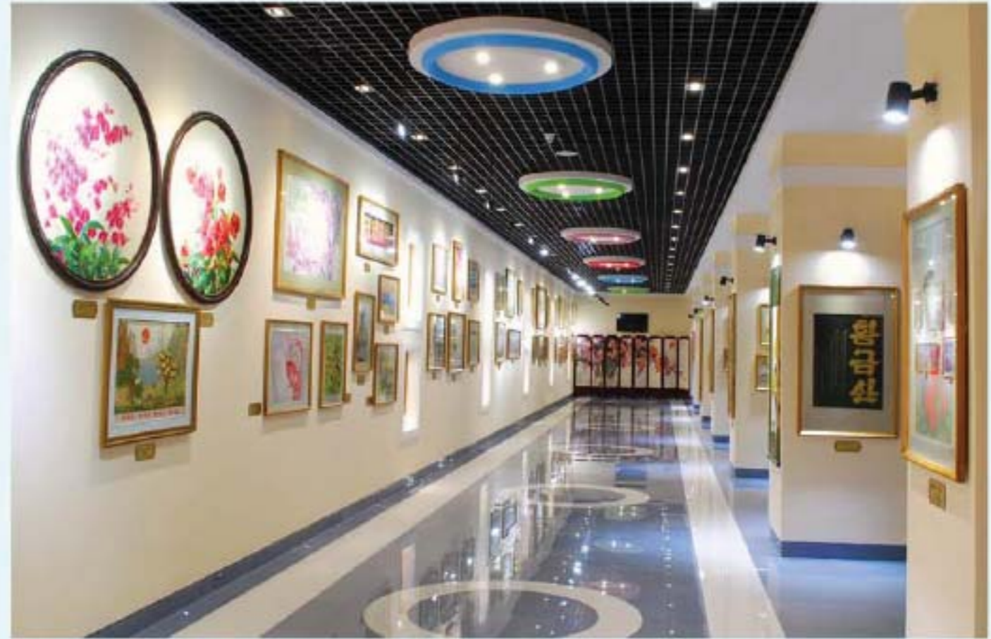
Hall for art works exhibition