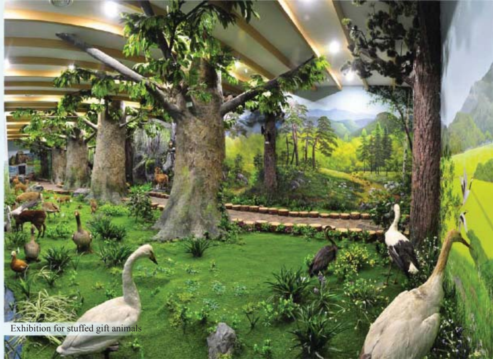
Exhibition for stuffed gift animals