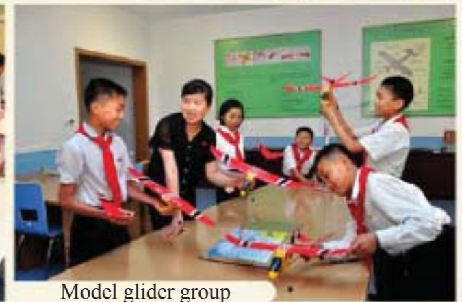
Model glider group