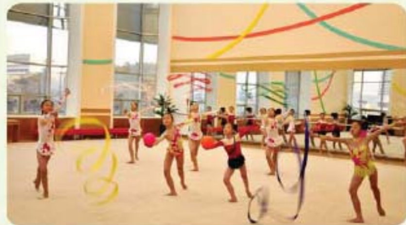
Rhythmic gymnastics training area