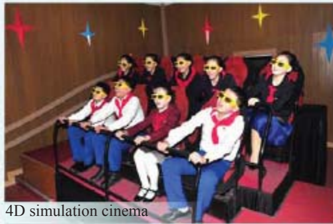
4D simulation cinema