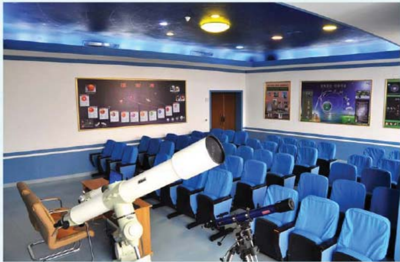
Astronomical knowledge room