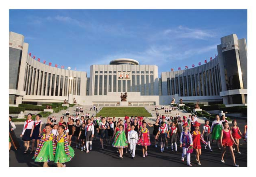
Children develop their talent to their heart's content at the Mangyongdae Schoolchildren's Palace.