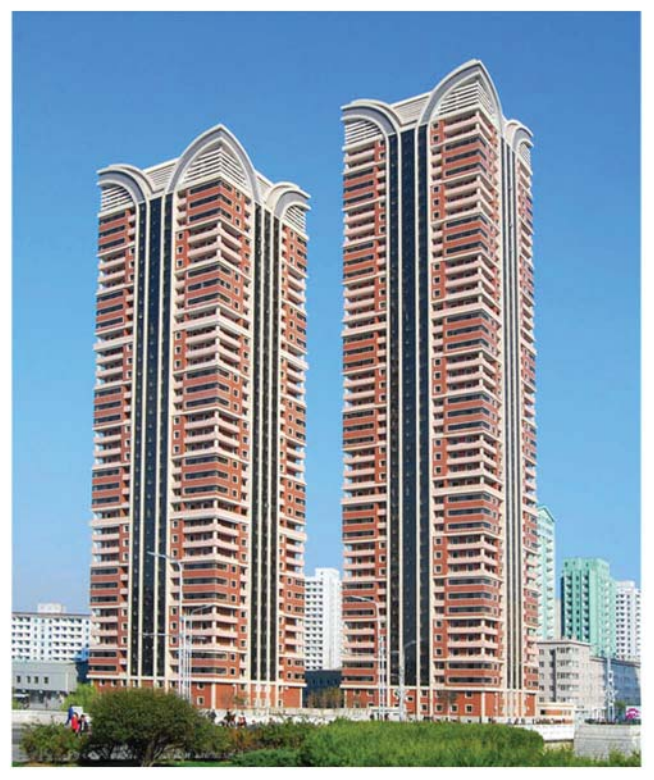
Apartment Buildings for Teachers of Kim II Sung University.

At the construction site he asked how many flats the first and second apartment buildings had respectively, and, looking up at the soaring buildings, exclaimed in a