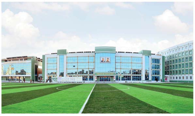
Pyongyang Teachers Training College.

Earlier in February Juche 106 (2017) he instructed that the college should be developed into a model institution with high accomplishments in terms of scientific, IT and modern qualities so that it would be emulated all across the country. This decision of his came from a profound idea: Education during the childhood which is an important stage in human intellectual development determines a person's opinion and attitude towards