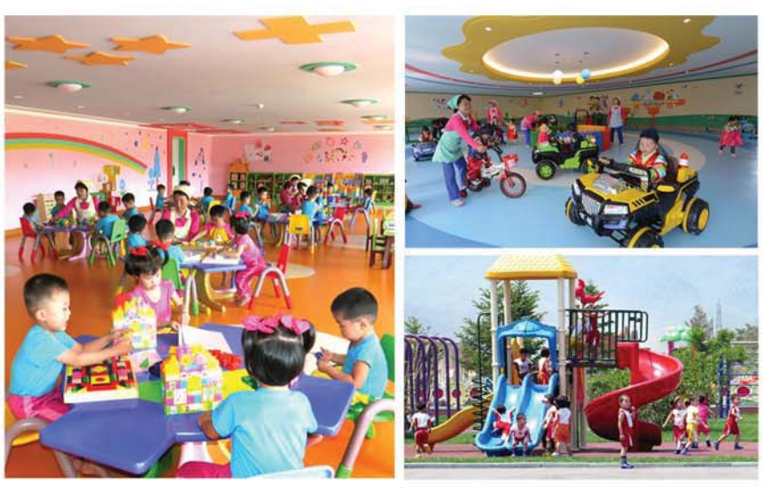
Children of the Wonsan Baby Home and Wonsan Orphanage.