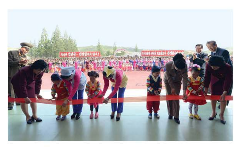
Children of the Wonsan Baby Home and Wonsan Orphanage cut the tape of inauguration of their home.