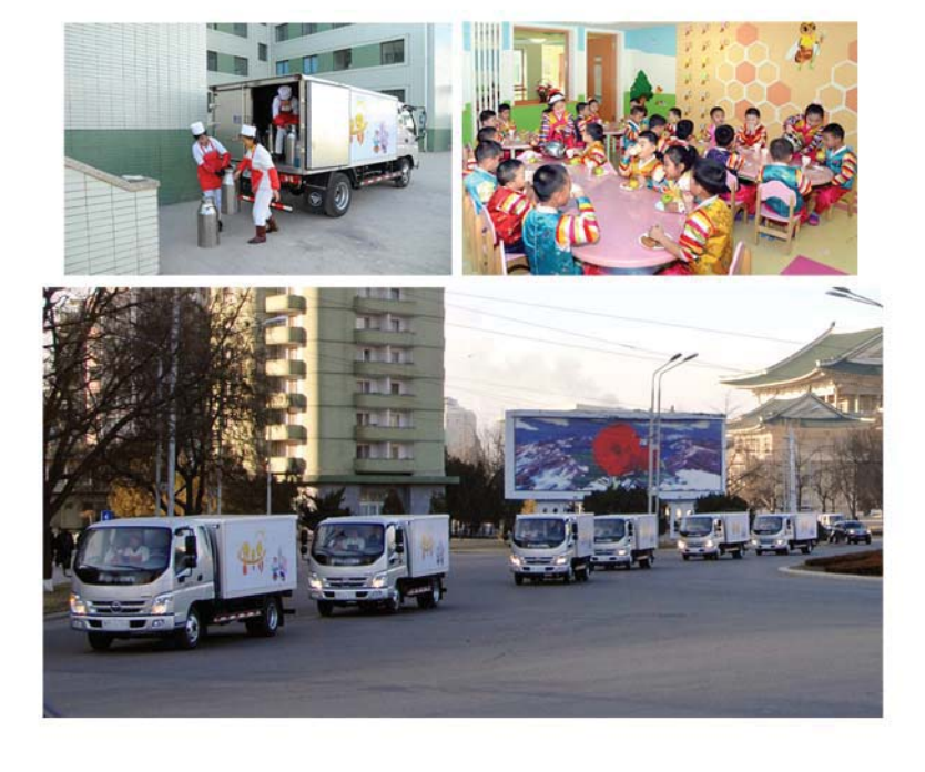
Soya milk is supplied to children on a regular basis.

"The Pyongyang Children's Foodstuff Factory should make big efforts to keep production on a