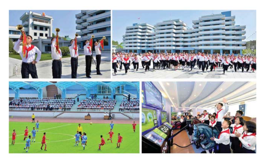
Schoolchildren enjoy themselves at the Songdowon International Children's Camp.