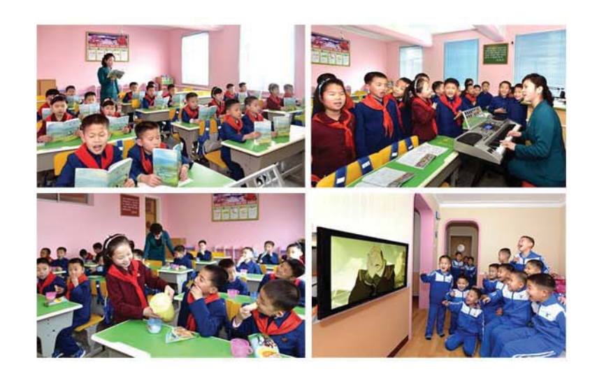
Children of the Pyongyang Primary School for Orphans.