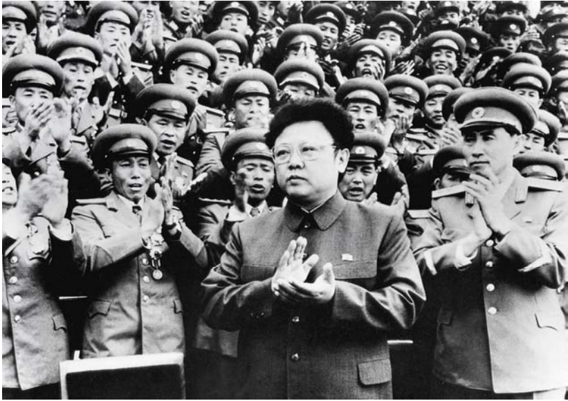
Kim Jong Il with People's Army soldiers