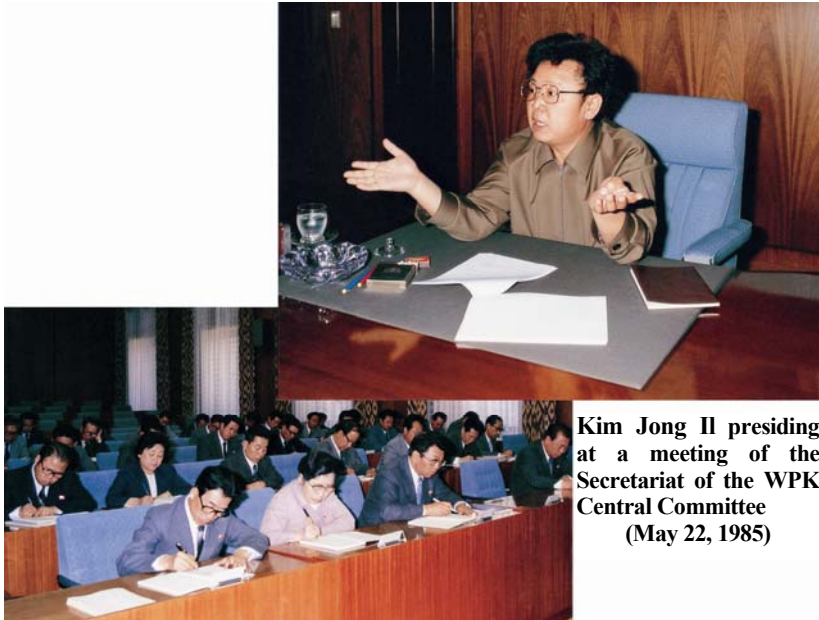
Kim Jong Il presiding at a meeting of the Secretariat of the WPK Central Committee (May 22, 1985)