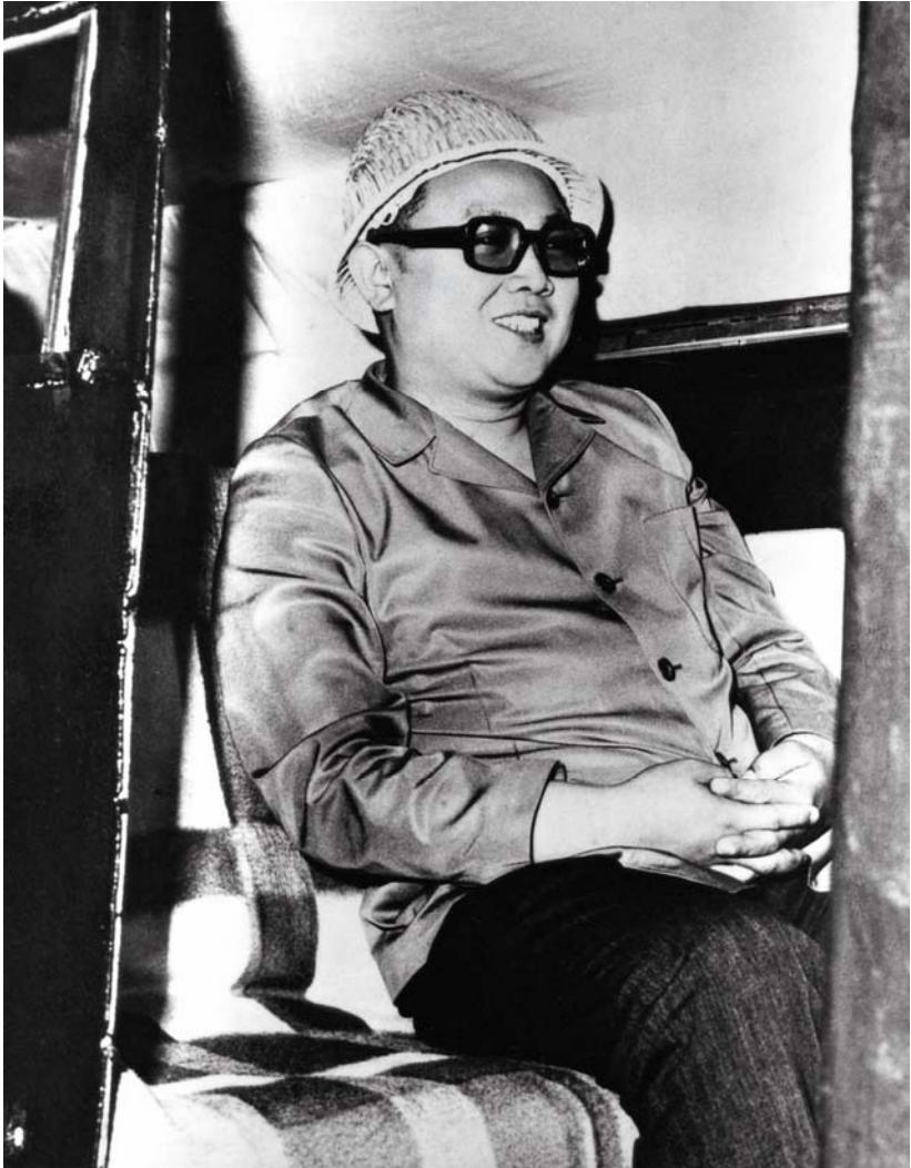
Kim Jong Il giving on-the-spot guidance at the Komdok Mine (July 1, 1975)