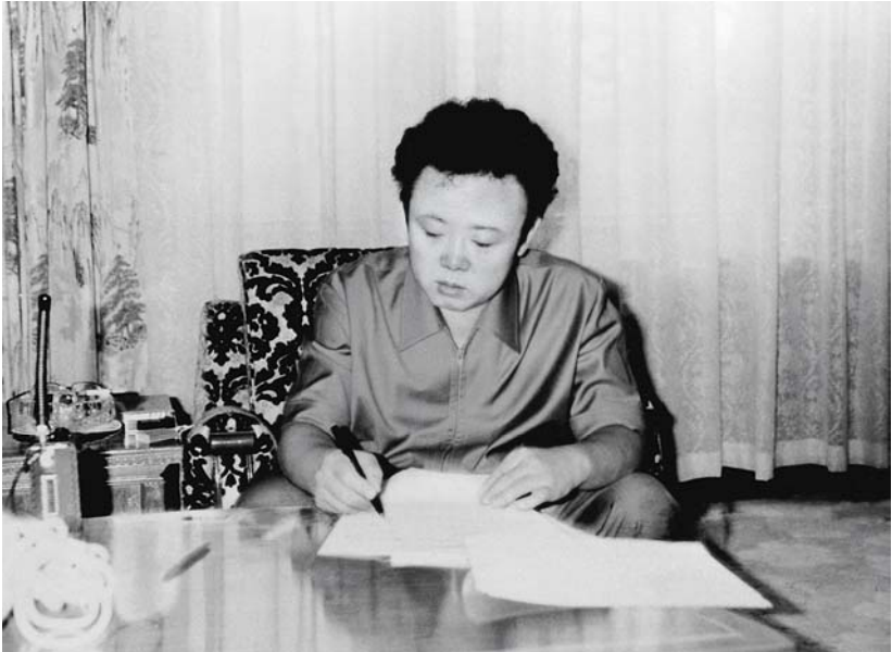
Kim Jong Il writing a treatise