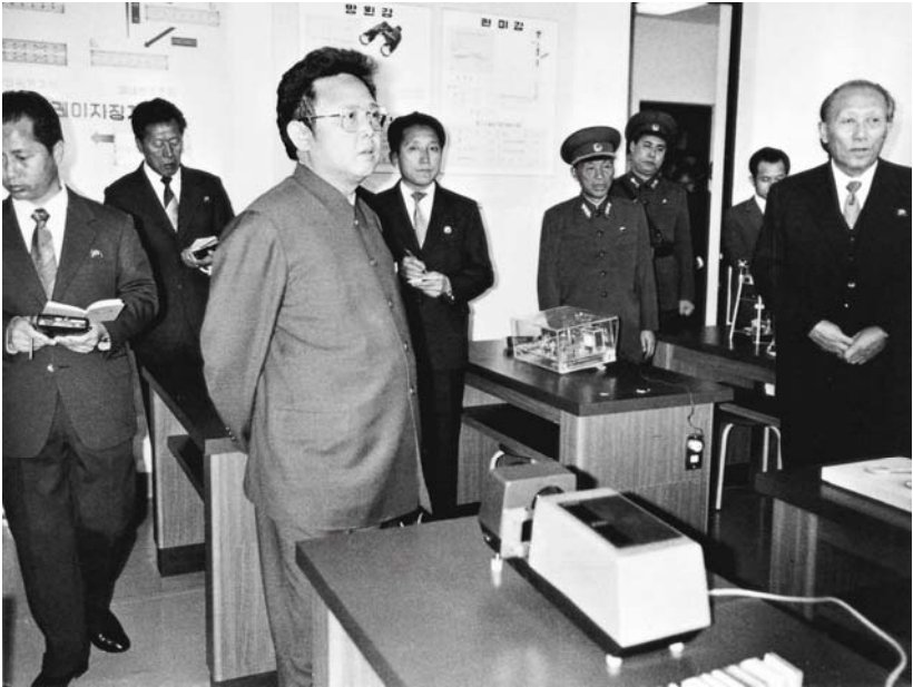
Kim Jong Il looking round the Pyongyang Senior Middle School No. 1 (February 26, 1985)