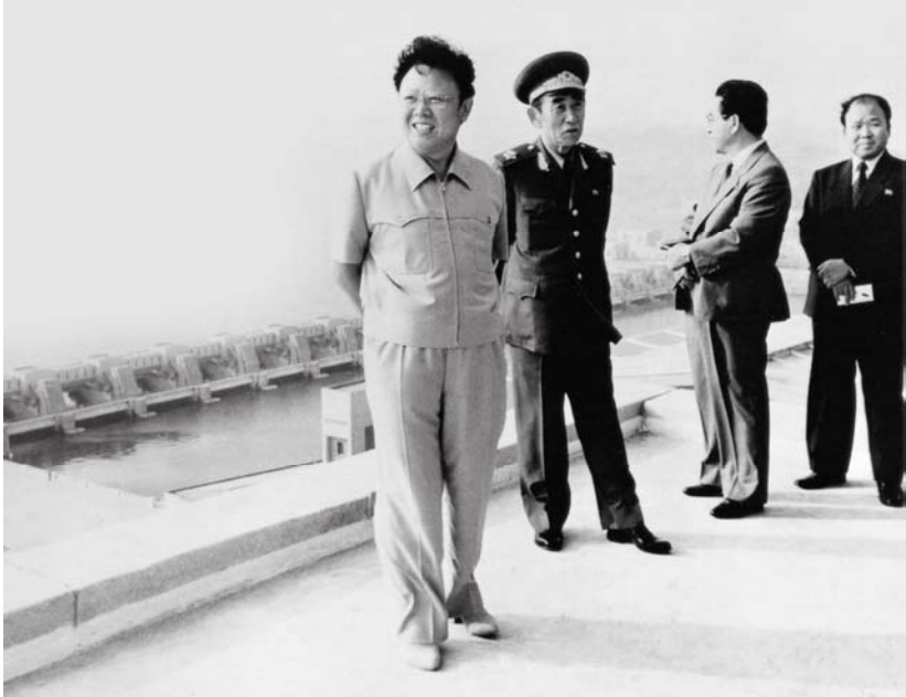
Kim Jong Il inspecting the West Sea Barrage (June 23, 1986)