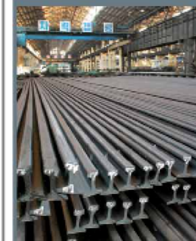
Hwanghae Iron and Steel Complex

QUARTERLY JOURNAL Juche 106 (2017) No. 3 (444)