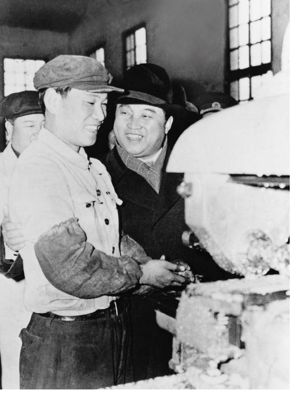
Kim Il Sung inspiring the workers at the Ryongsong Machine Factory to labour feats (March 1959)