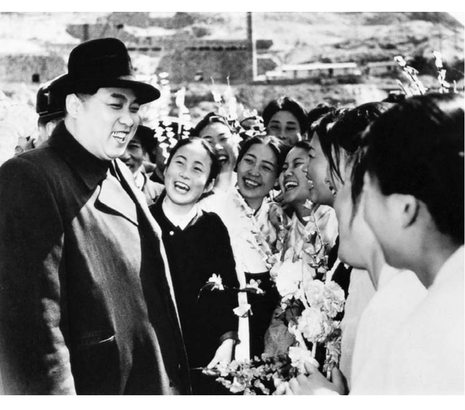
Kim Il Sung among the workers (April 1961)