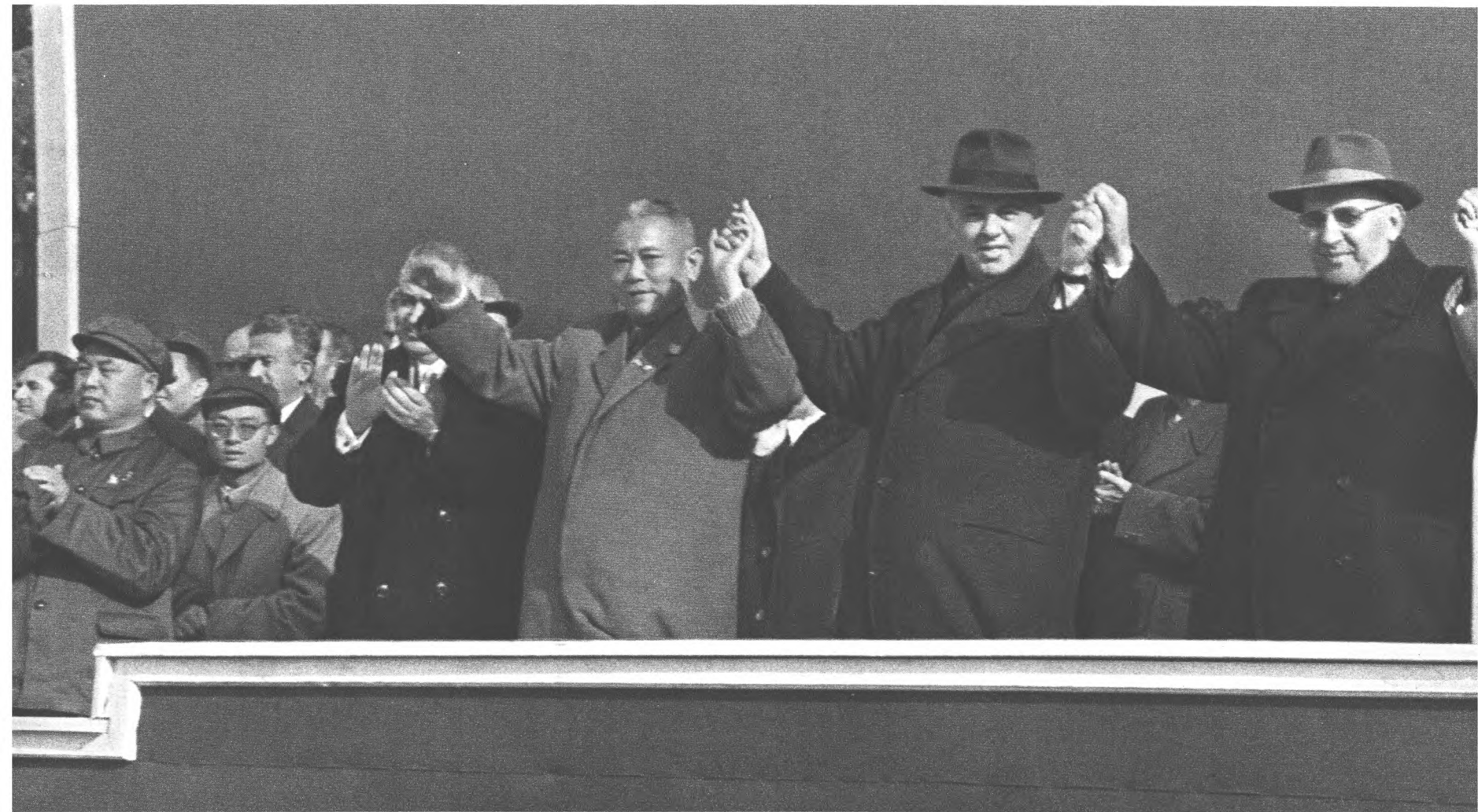
Comrade Hoxha, Comrade Lleshi and Comrade Shehu together with Comrade Li Hsien-nien and Comrade Li Teh-sheng, head and deputy head of the Chinese Party and Government Delegation, on the reviewing stand. A grand military review and mass parade was held in Tirana, capital of Albania, on November 29, 1969 to celebrate the 25th anniversary of the liberation of Albania and the victory of the people's revolution.