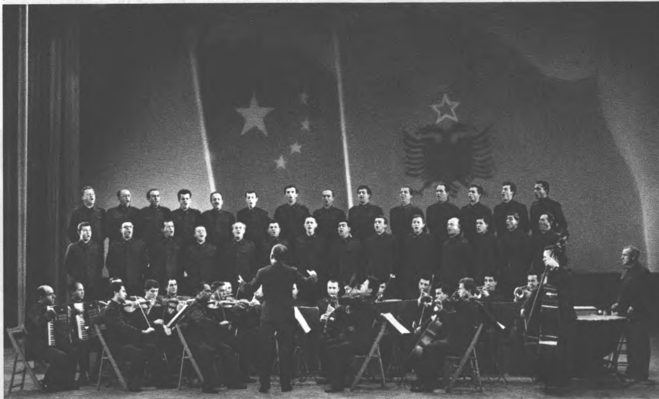
Chorus. The Albanian literary and art workers warmly praise Comrade Enver Hoxha, the great leader of the Albanian people, and Chairman Mao, the great leader of the Chinese people. They also praise the unbreakable militant friendship between the two peoples of China and Albania.

The Albanian literary and art workers attend the performance, Celebrating the 25th Anniversary of the Liberation of Albania . It was composed and put on by the Mao Tsetung Thought propaganda team of the Peking No.3 Cotton Mill. After the performance the Albanian friends went backstage and cheered "Long live Chairman Mao!" "Long live Comrade Enver Hoxha!" together with the Chinese workers.