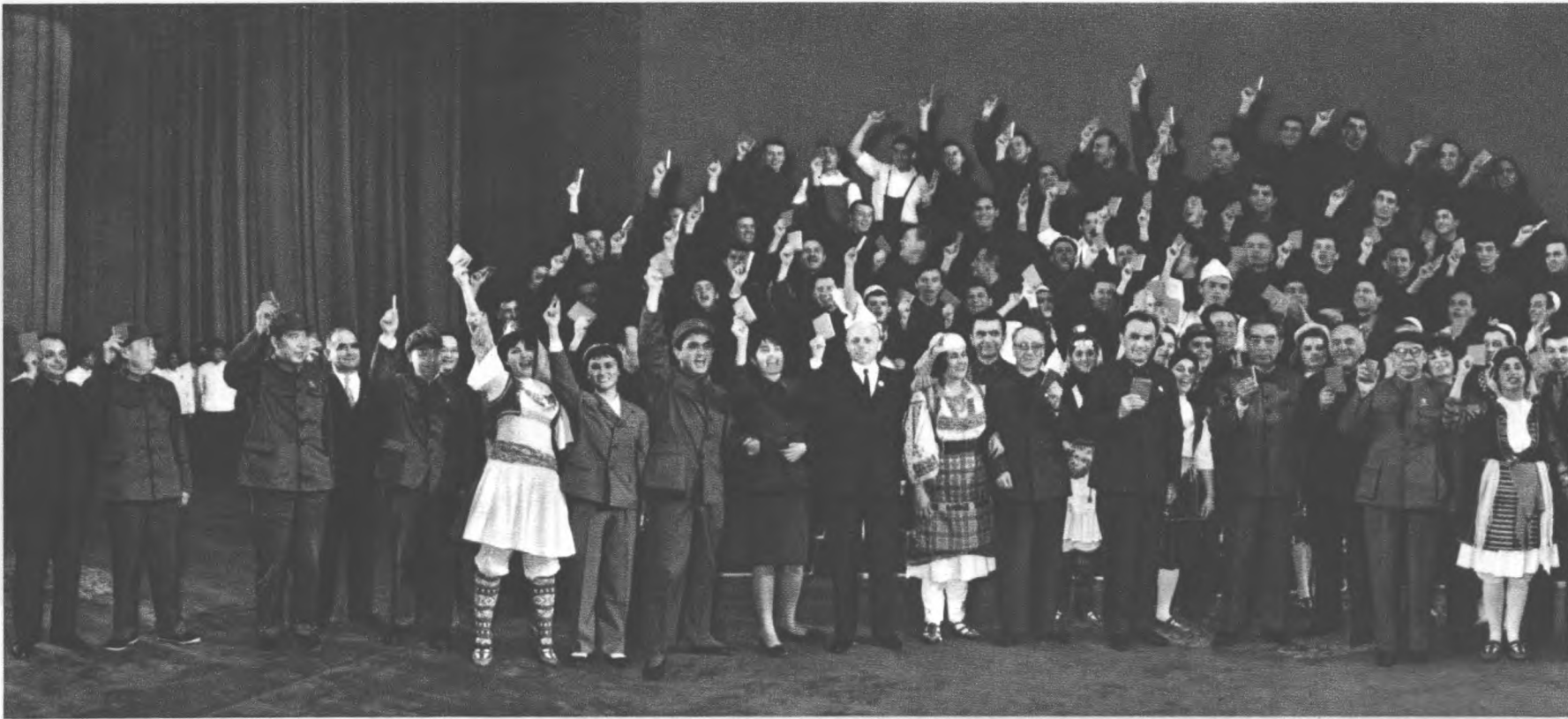
On the evening of November 27, 1969, the Albanian People's Army Art Troupe gave a splendid performance at the Great Hall of the People. Attending the performance were: Chou En-lai, Chen Po-ta and Kang Sheng, Members of the Standing Committee of the Political Bureau of the Central Committee of the Chinese Communist Party; (the following are listed in the order of the number of strokes of the surnames) Wu Fa-hsien, Yao Wen-yuan, Huang Yung-sheng and Hsieh Fu-chih, Members of the Political Bureau of the Party Central Committee; and Chi Teng-kuei, Alternate Member of the Political Bureau of the

Party Central Committee. The commanders and fighters of the Revolution Army, revolutionary literary and art workers and other revolutionaries, totalling several thousands in number, also attended the performance, Chou En-lai, Chen Po-ta, Kang Sheng and other members of the central organizations mounted the stage and had a photo taken with the performers.