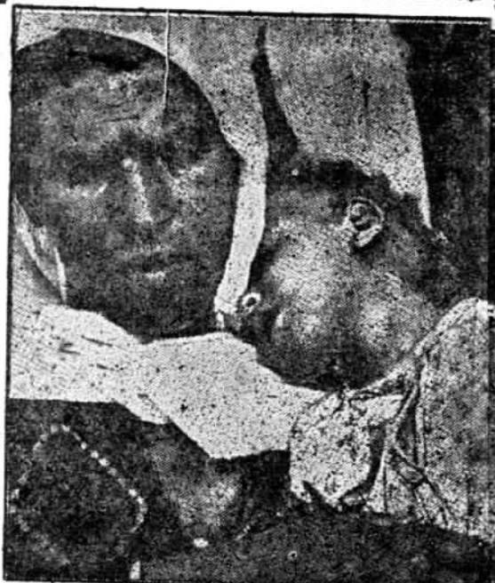
A PALESTINIAN refugee with her little one.

But if our flesh is crumbling away and our hope