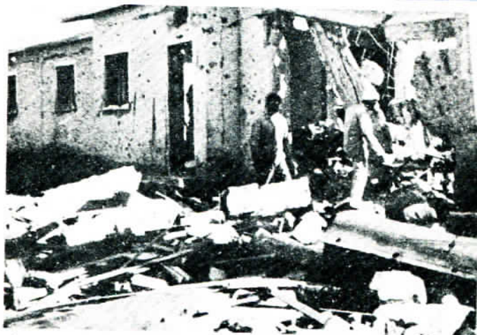
A general view of the school after the attack with the pupils' desks scattered around in the foreground.